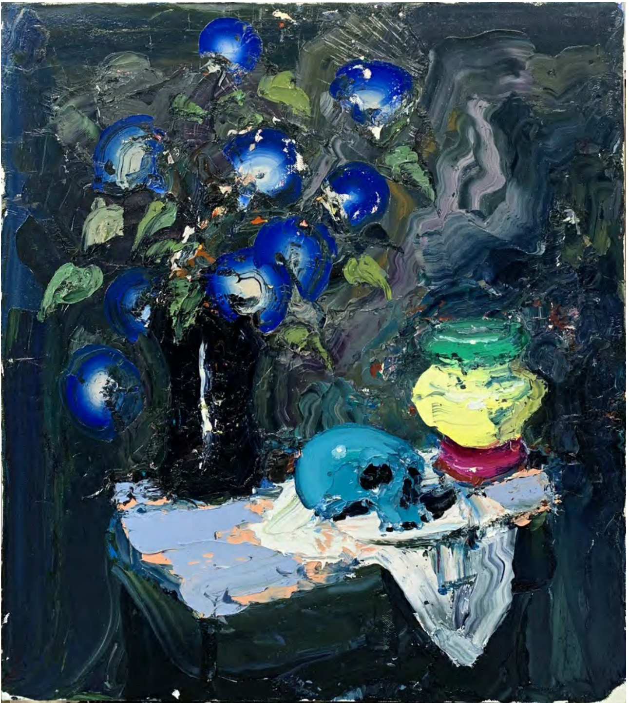
PAUL RYAN Glorious Morning, Raucheon Form, 2020 oil on linen 138 x 122 cm $ 16,000