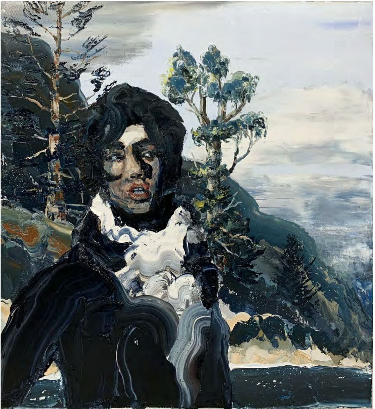
PAUL RYAN Mick Jagger as Joseph Banks, 2020 oil on linen 122 x 122 cm $ 12,000