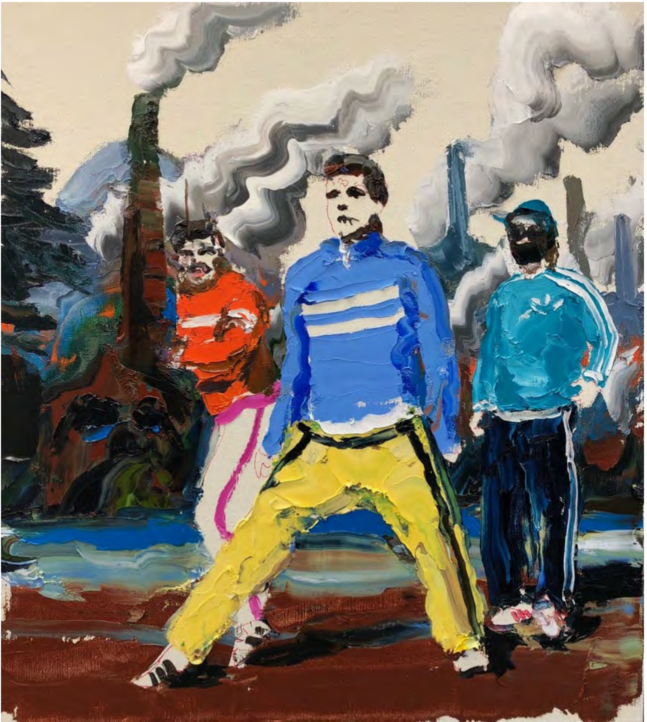
PAUL RYAN Your Mum threw away your best porno mags 2018 oil on linen 138 x 122 cm $ 16,000