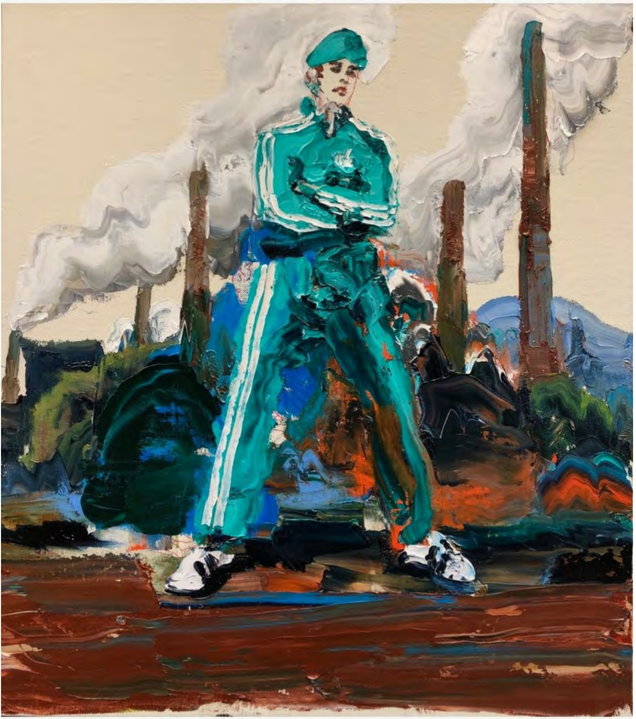
PAUL RYAN Body Movin , 2018 oil on linen 138 x 122 cm $ 16,000