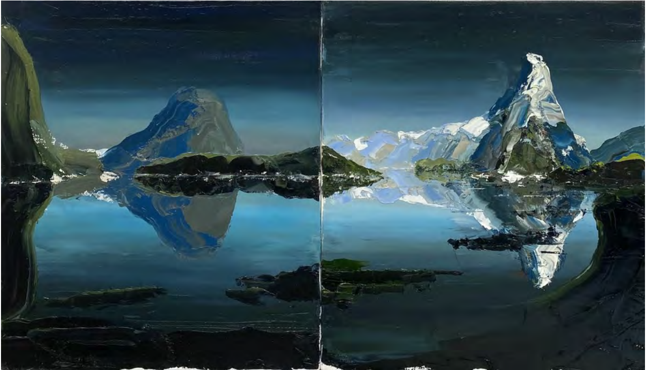
PAUL RYAN Black Mirror (diptych) , 2021 oil on linen 82 x 144 cm $ 12,000