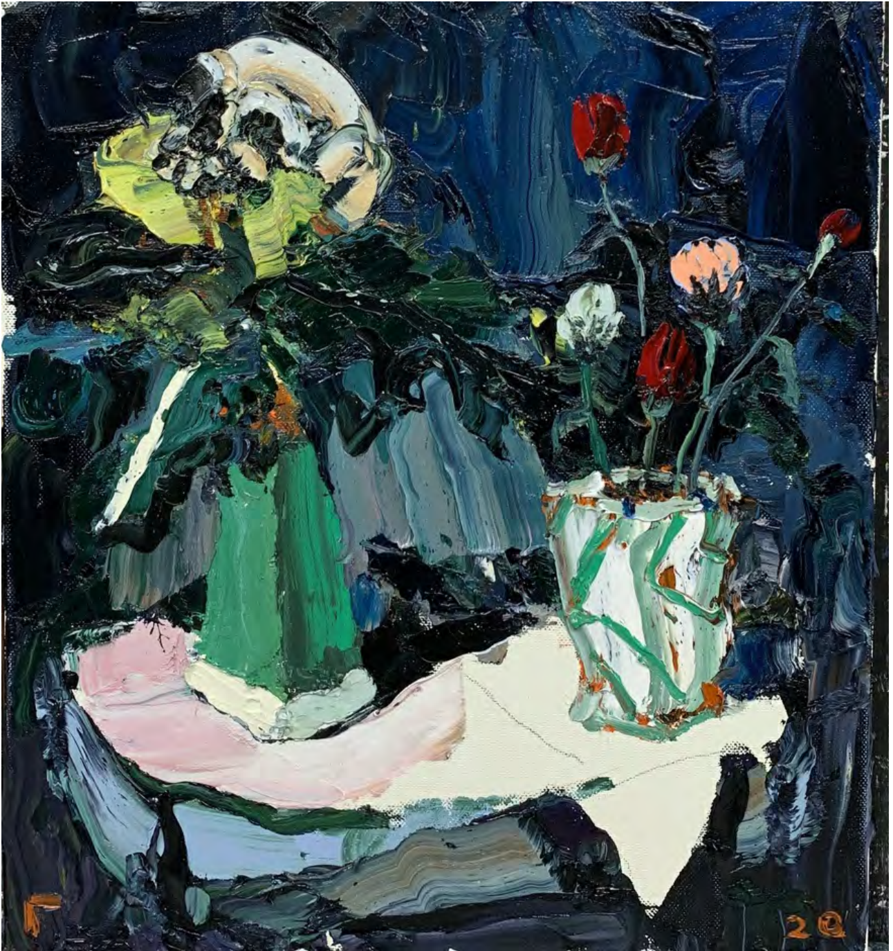
PAUL RYAN Two Green Vessels , 2020 oil on linen 91 x 81 cm $ 8,000