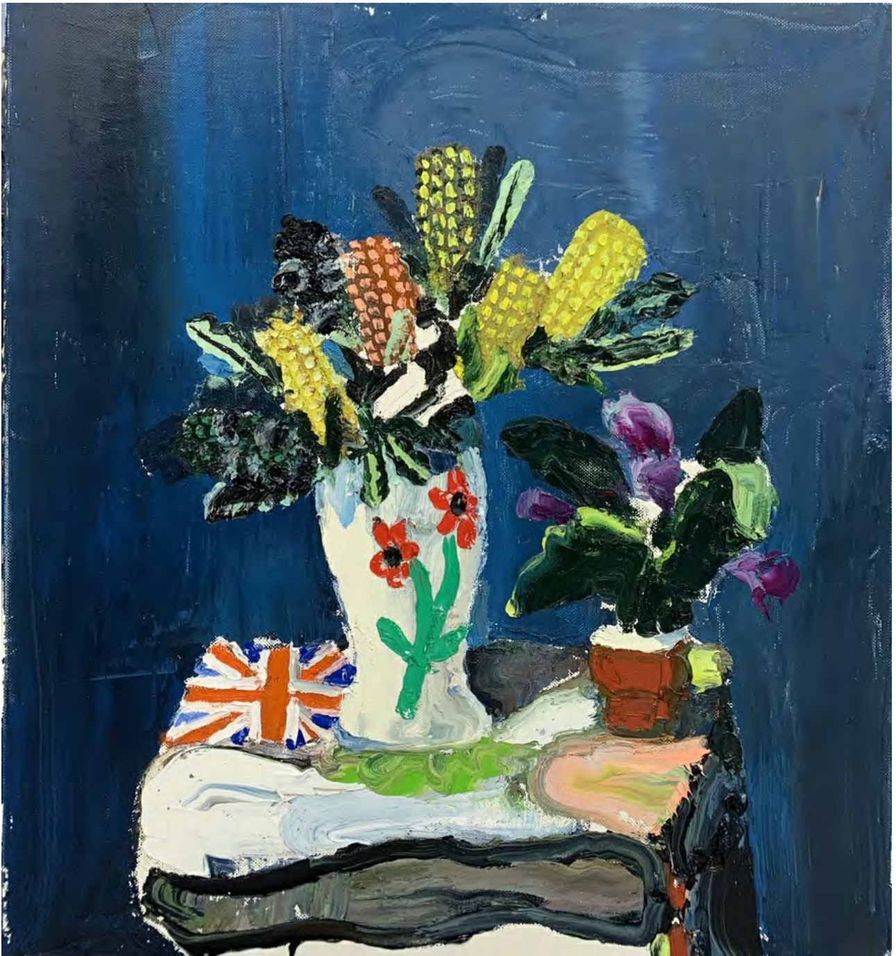
PAUL RYAN Banksias in a Happy Pot , 2020 oil on linen 122 x 112 cm $ 12,000