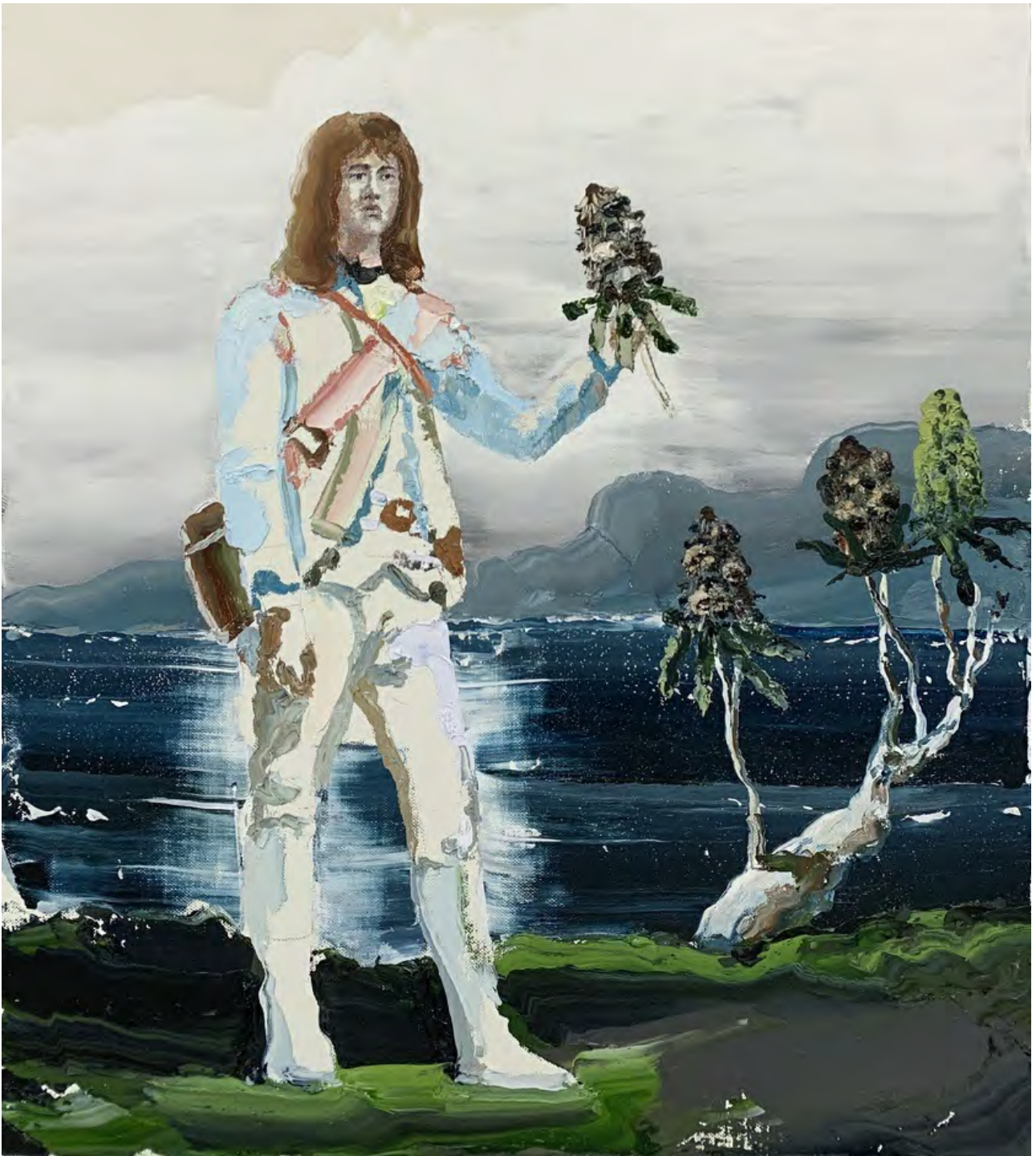
PAUL RYAN Joseph Banks Discovering the Banksia , 2020 oil on linen 138 x 122 cm $ 16,000