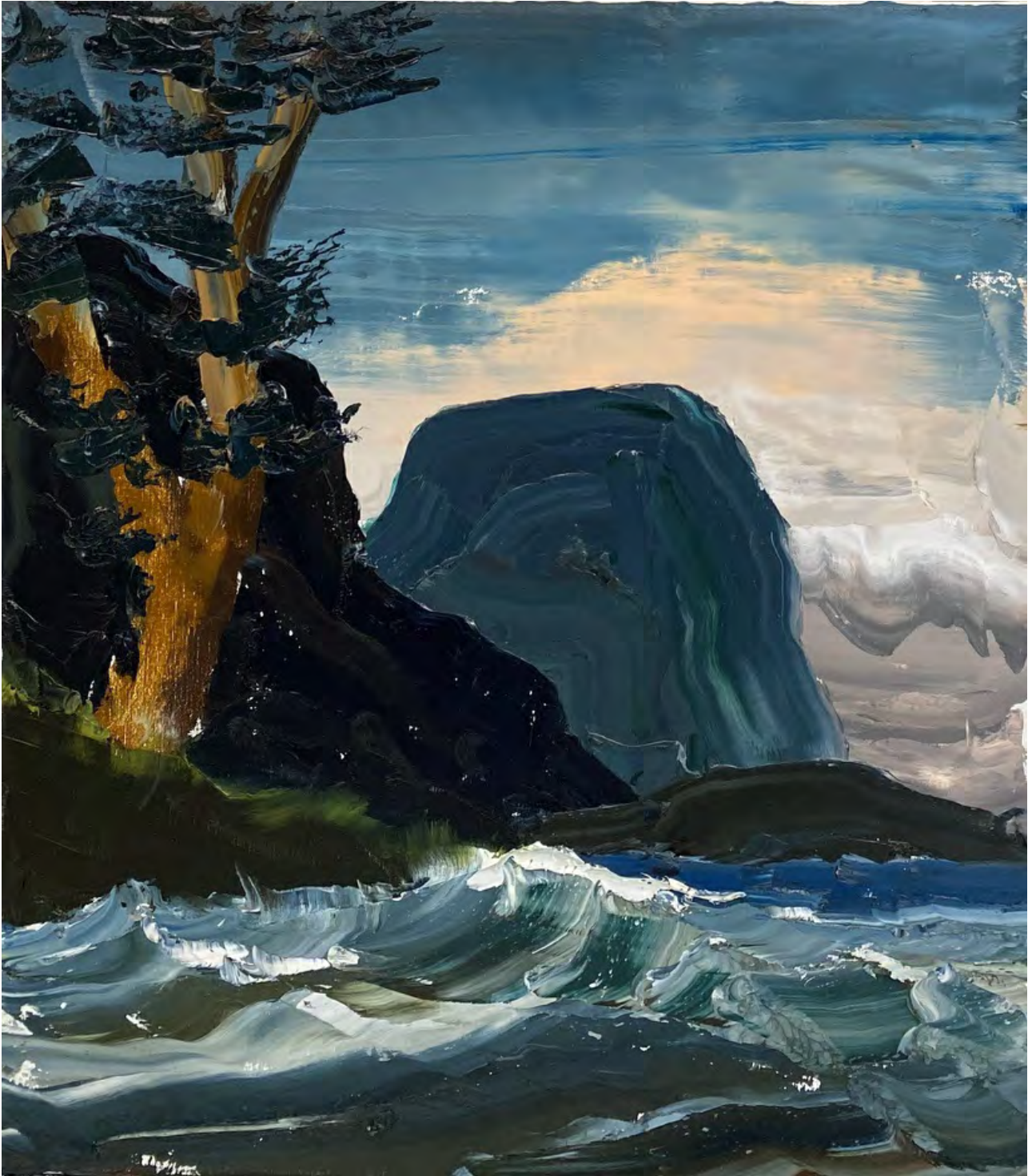
PAUL RYAN Small Pink Storm, Lord Howe , 2020 oil on linen 82 x 72 cm $ 6,000