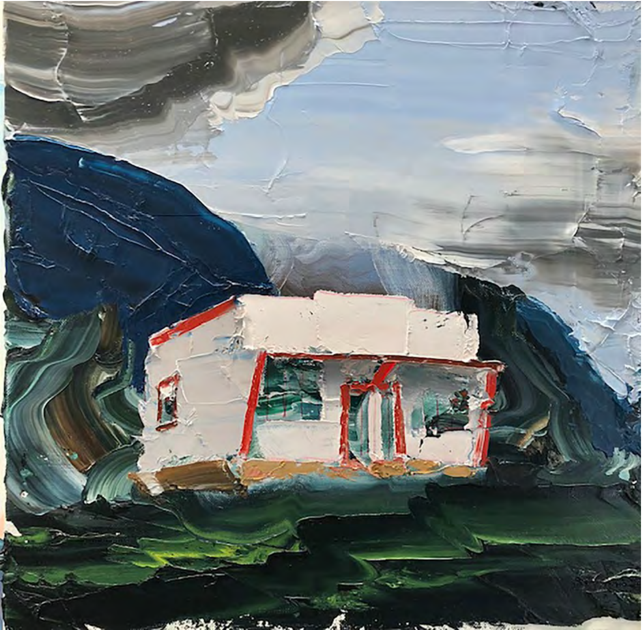
PAUL RYAN Study for Wombarra House, 2018 oil on linen 102 x 102 cm $ 10,000