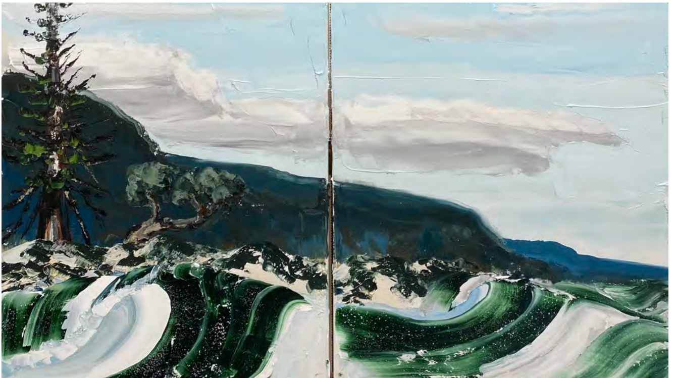
PAUL RYAN The Point (diptych), 2021 82 x 144 cm $ 12,000