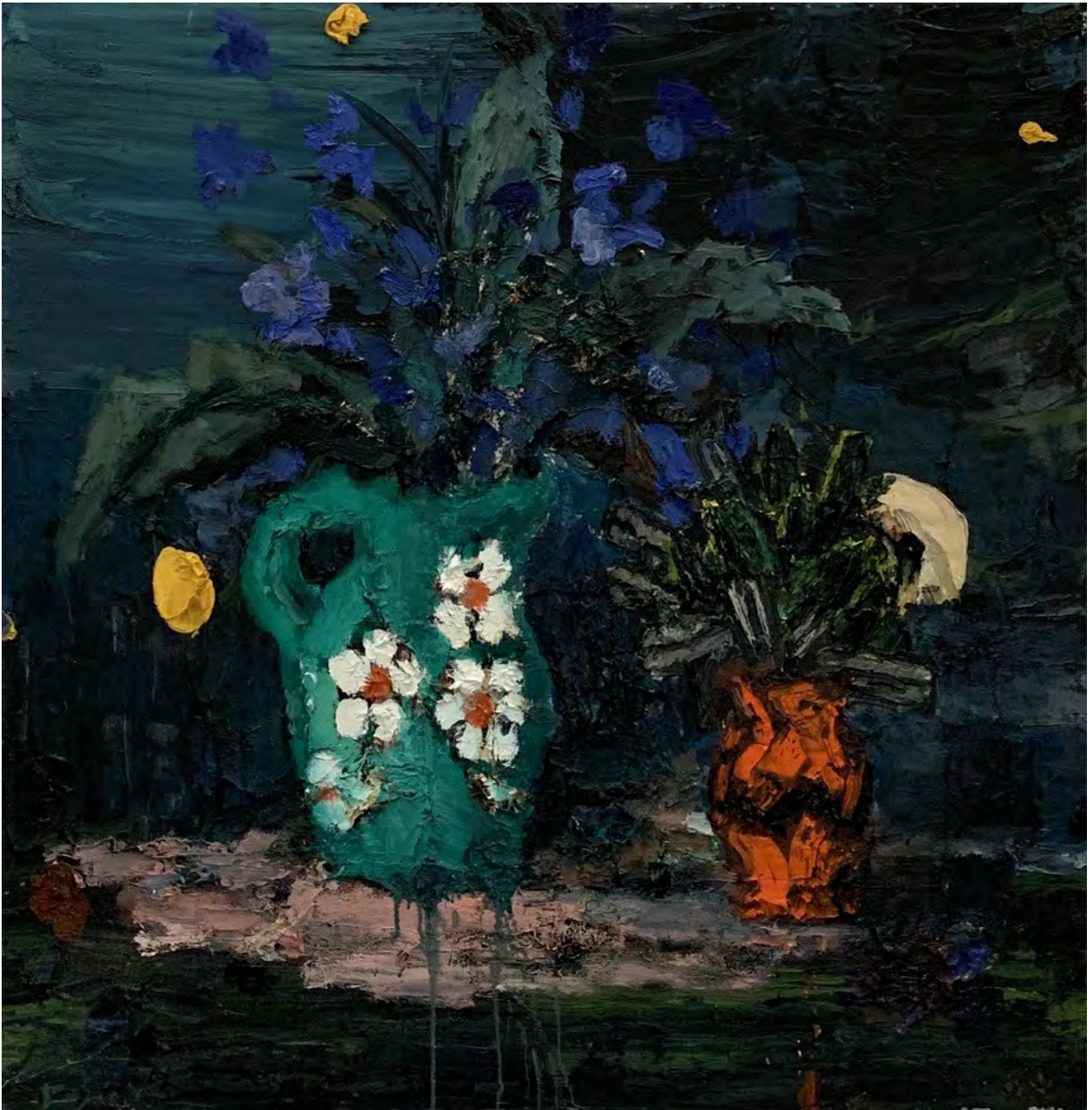
PAUL RYAN Still Night , 2019 oil on linen 168 x 168 cm $ 25,000