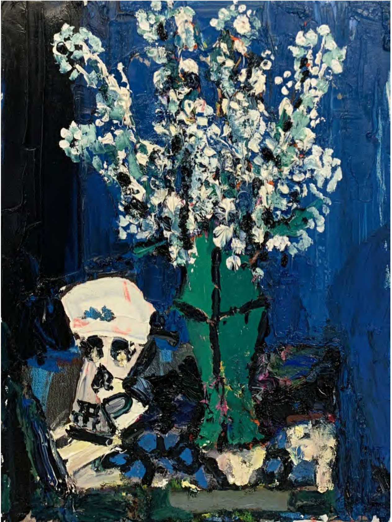
PAUL RYAN Still life with Rocket Blossom , 2020 oil on linen 122 x 92 cm $ 12,000