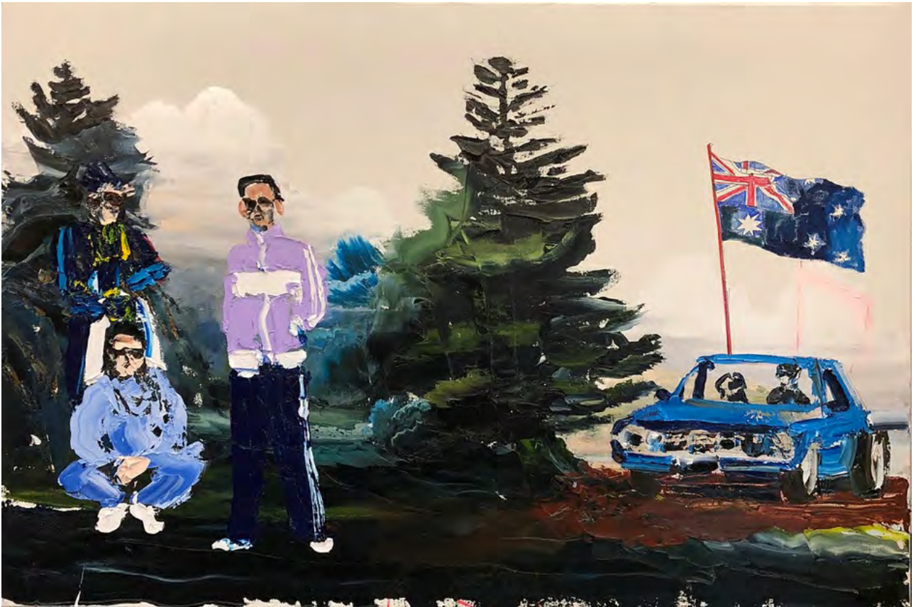
PAUL RYAN Yeah The Boys , 2018 oil on linen 200 x 300 cm $ 34,000