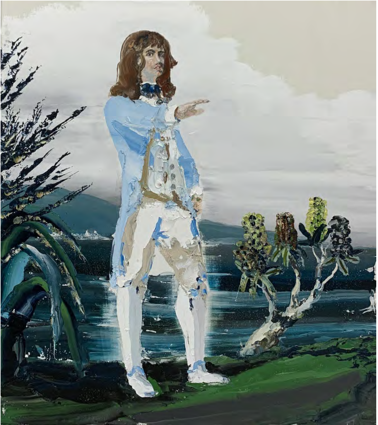
PAUL RYAN Joseph Banks, my plants are this high , 2020 oil on linen 138 x 122 cm $ 16,000