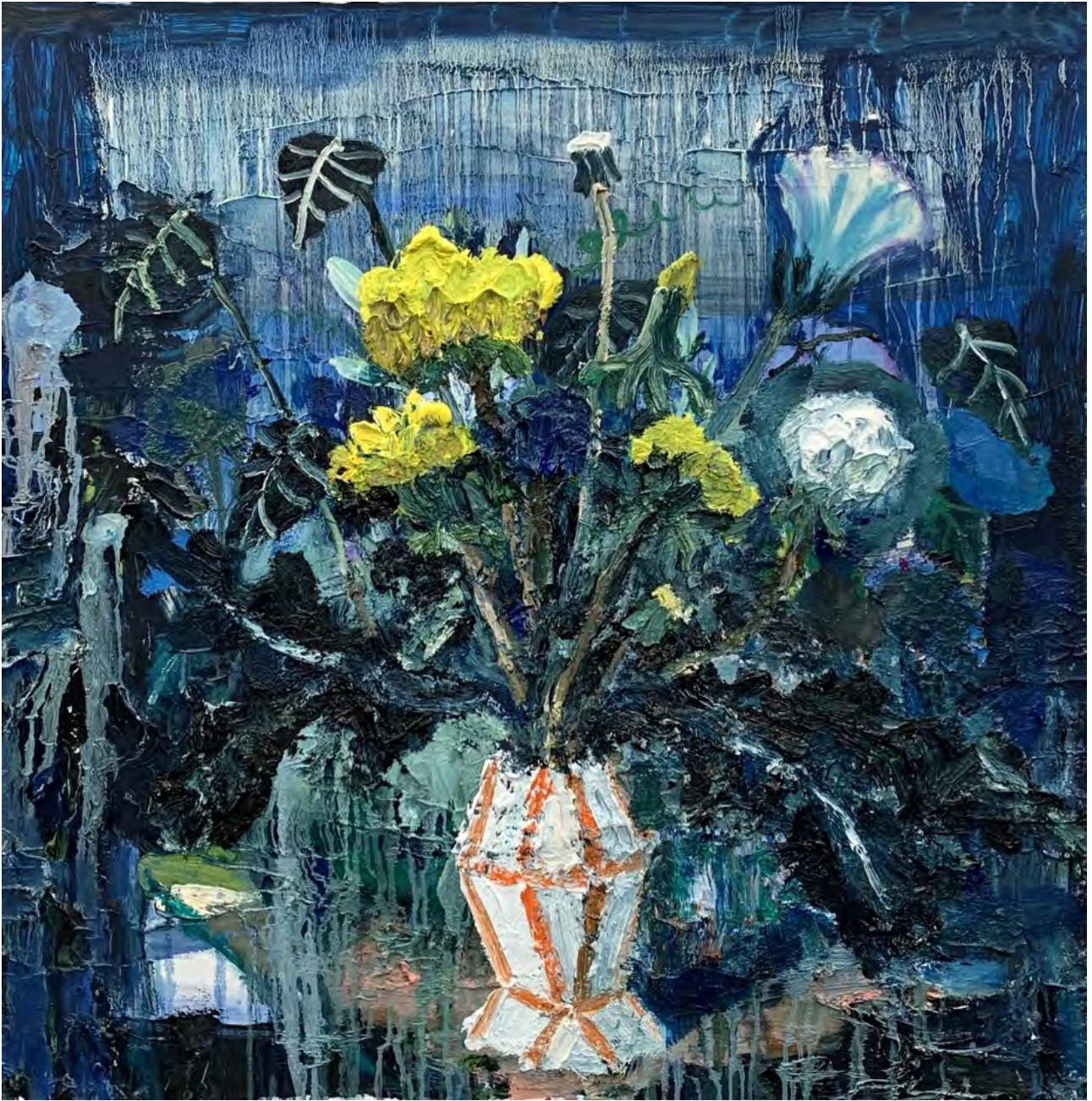
PAUL RYAN Dandelion Morning Glory , 2019 oil on linen 102 x 102 cm $ 11,000