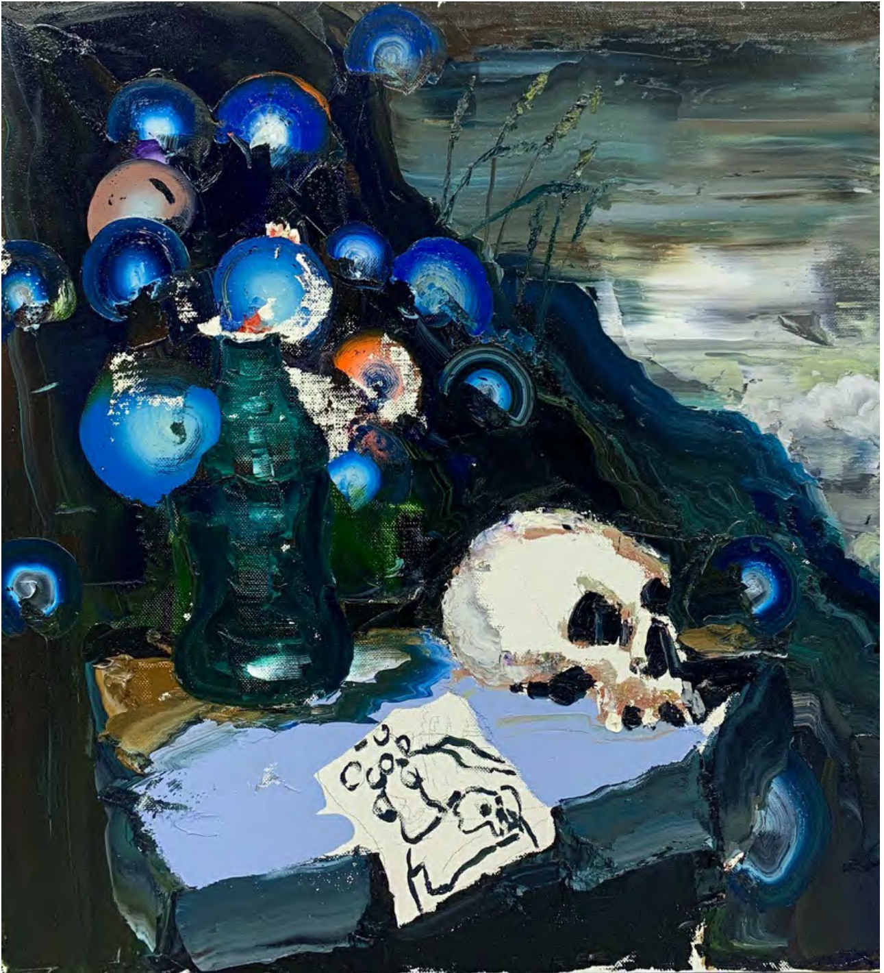
PAUL RYAN Meta , 2020 oil on linen 122 x 112 cm $ 12,000