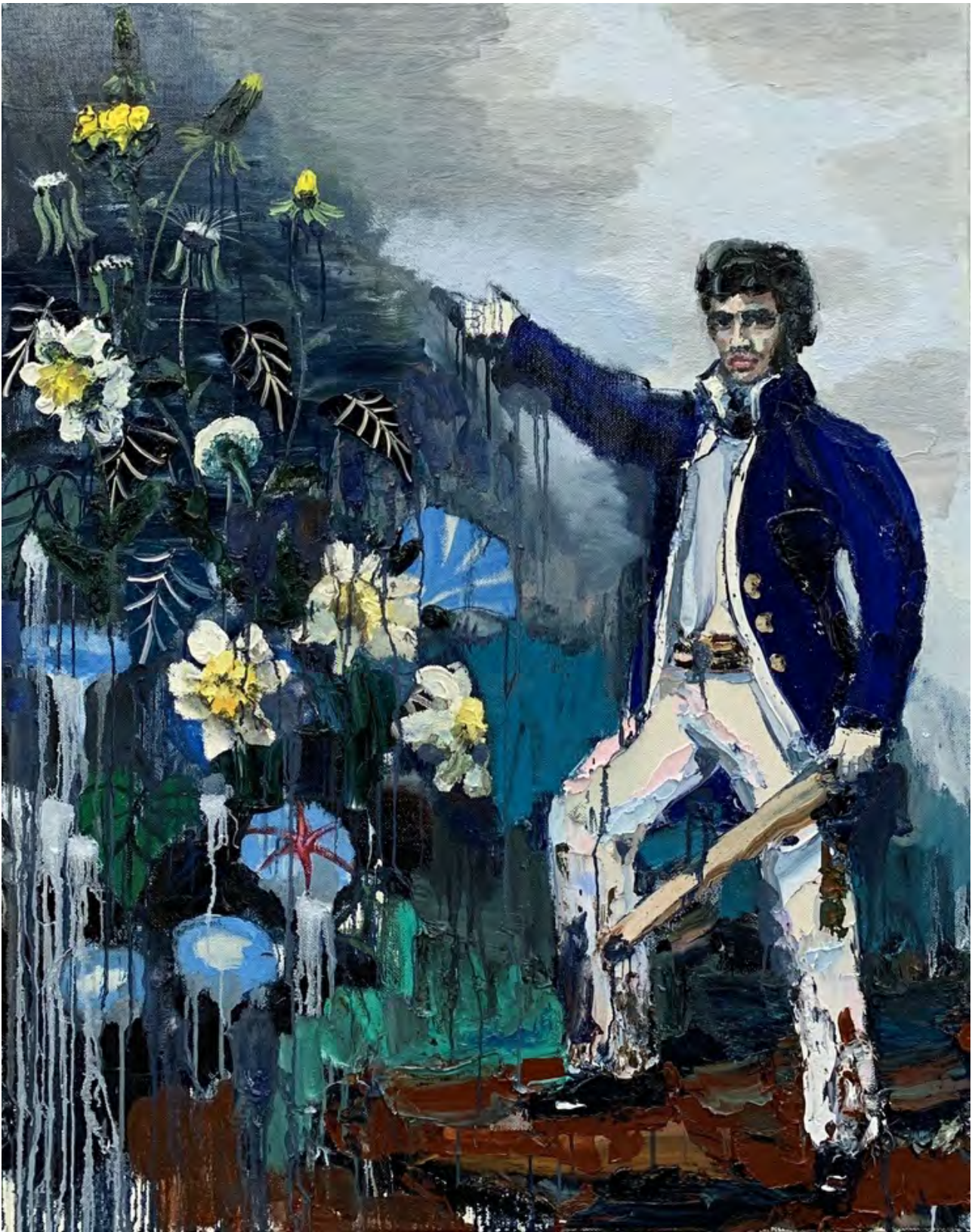
PAUL RYAN Beautiful Weeds, Colonial , 2019 oil on linen 153 x 122 cm $ 18,000