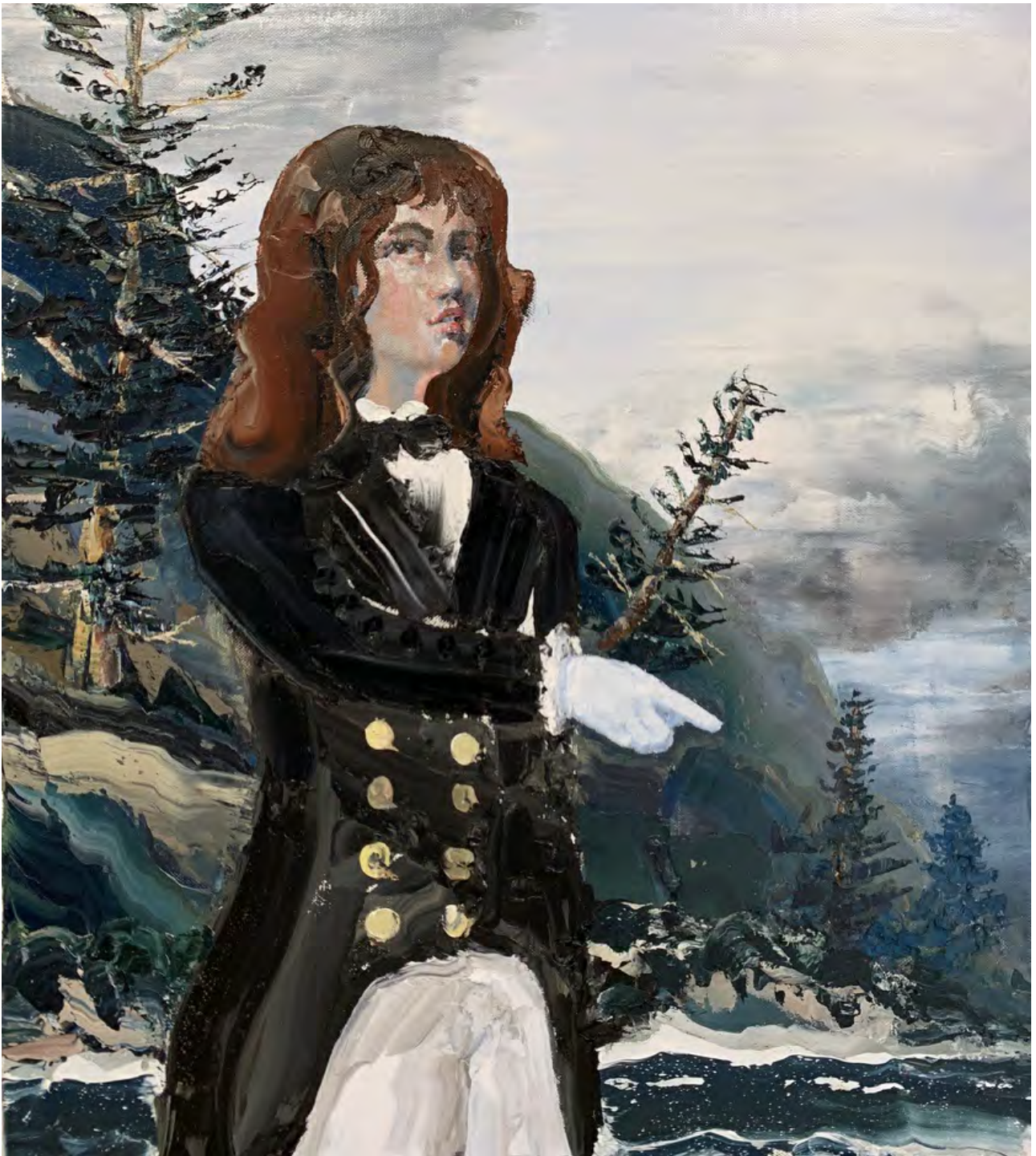
PAUL RYAN Young Joseph Banks , 2020 oil on linen 138 x 122 cm $ 16,000