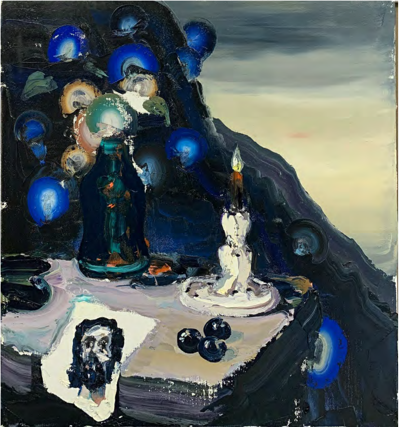
PAUL RYAN Cold April Night, 2020 oil on linen 122 x 112 cm $ 12,000