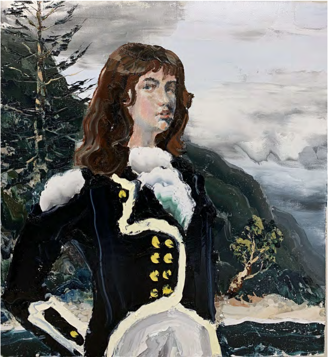
PAUL RYAN Young Joseph Banks, Bulli Portrait, 2020 oil on linen 122 x 112 cm $ 12,000