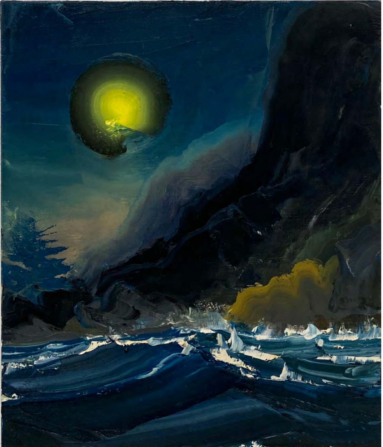
PAUL RYAN Yellow Moon , 2020 oil on linen 66 x 56 cm $ 5,000