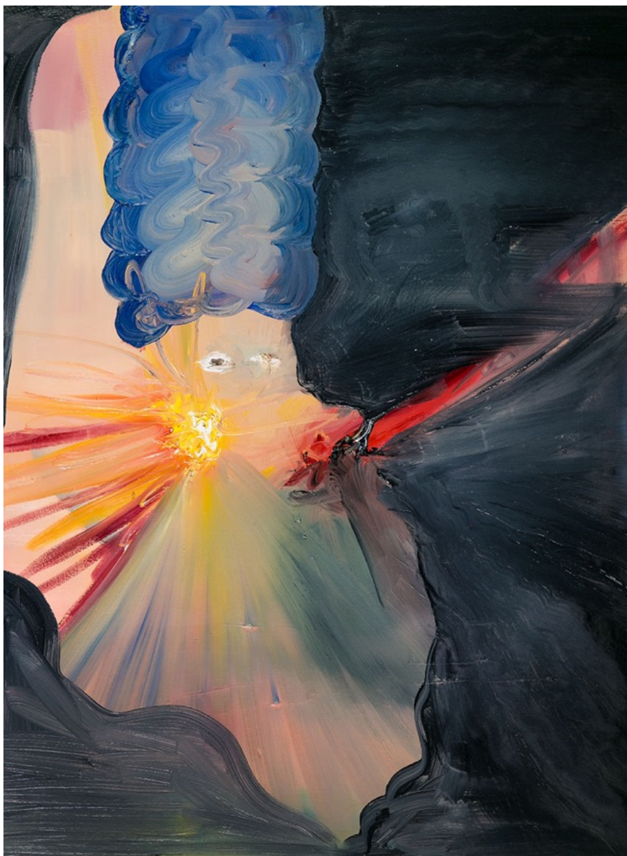
Marge Simpson at the Big Bang 2013 oil on canvas 35.6 x 76.2 cm $2,500