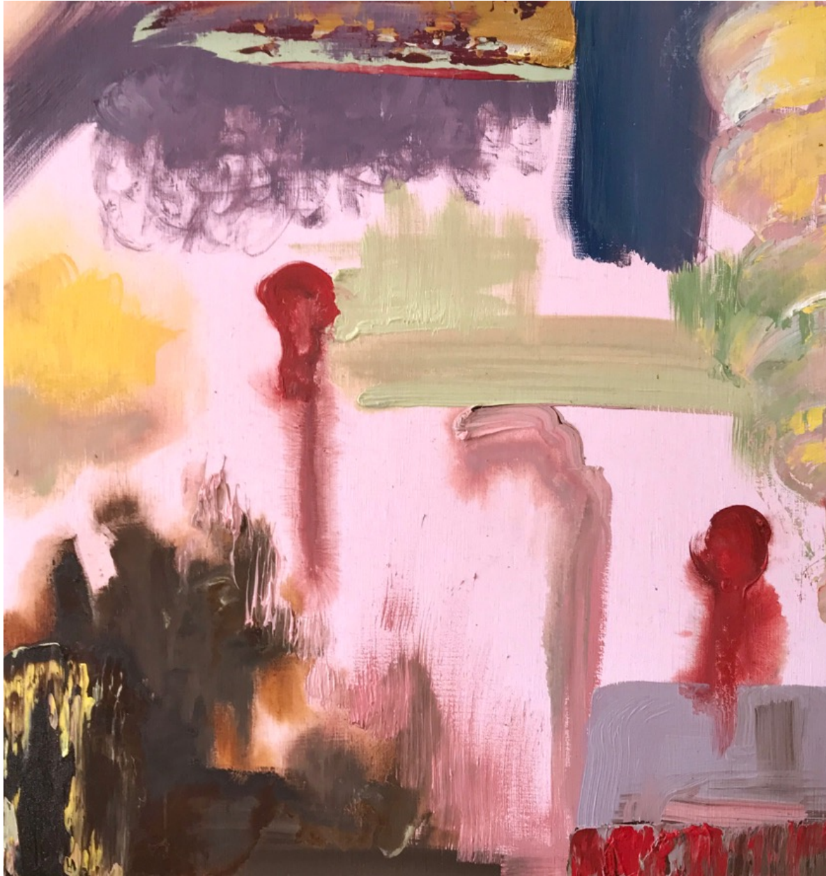
End of Day 220119 2019 oil on panel 42.5 x 40 cm $1,800