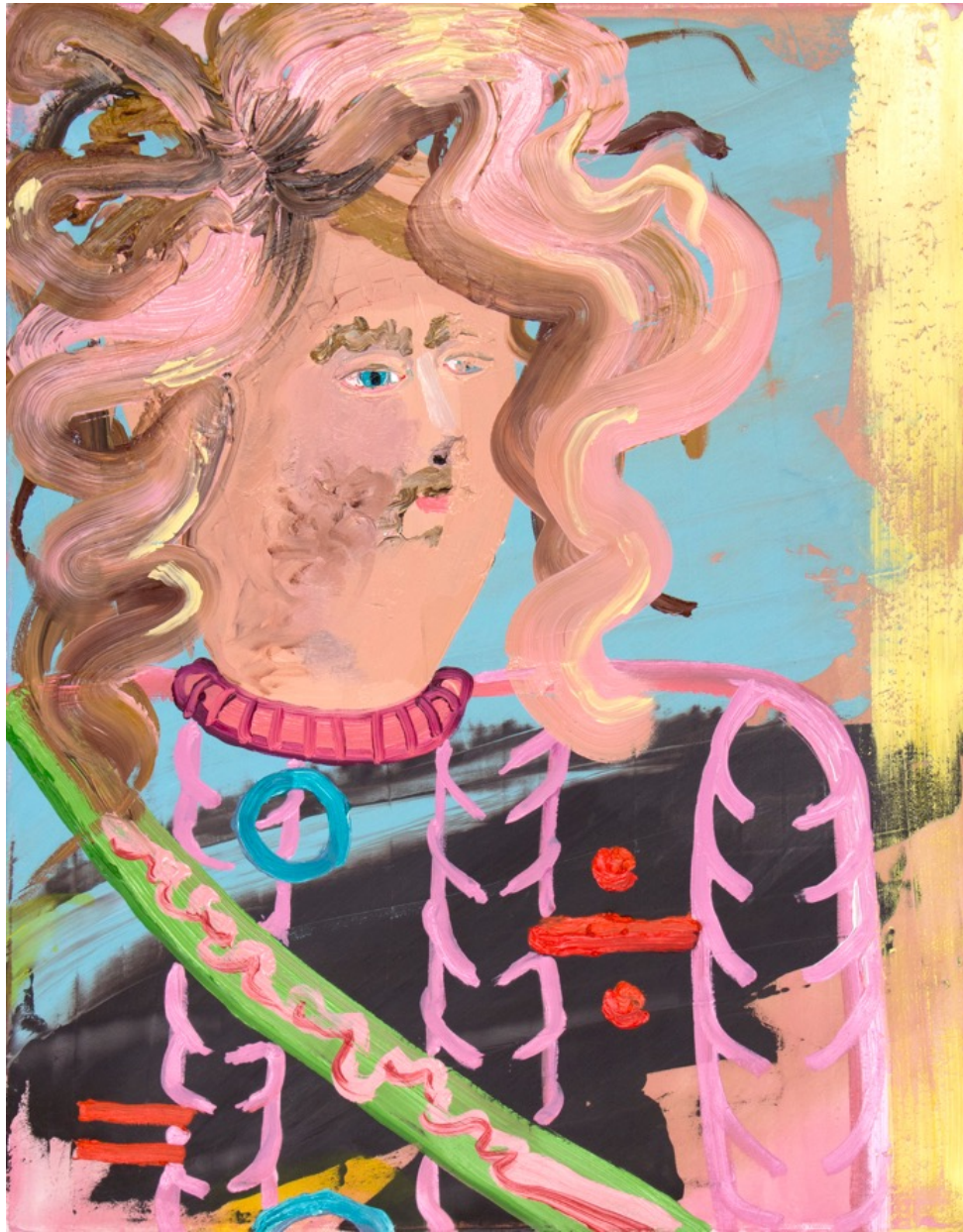
Ladies Man 2017 oil on canvas 40.6 x 50.8 cm $2,000