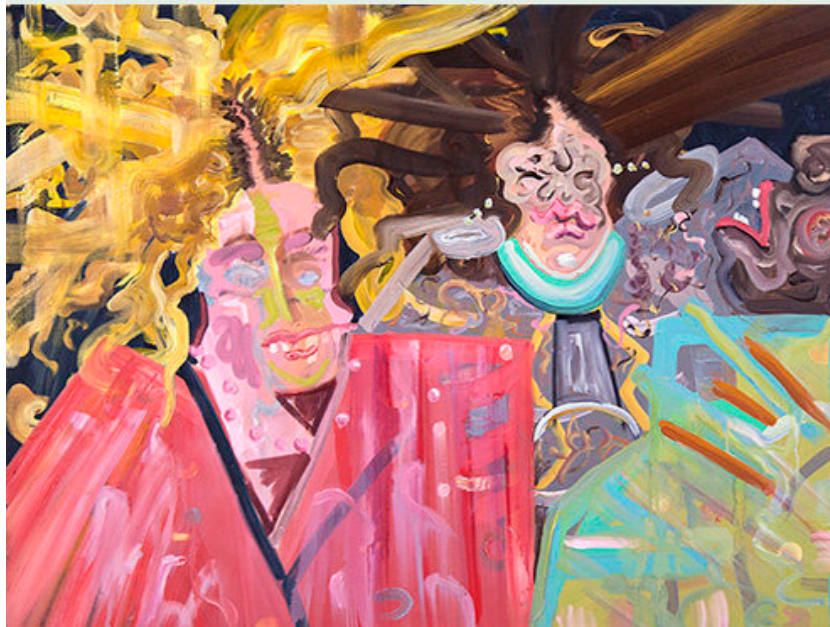
Before and After Open Bar 2018 oil on canvas and polyester 204 x 76 cm $6,000