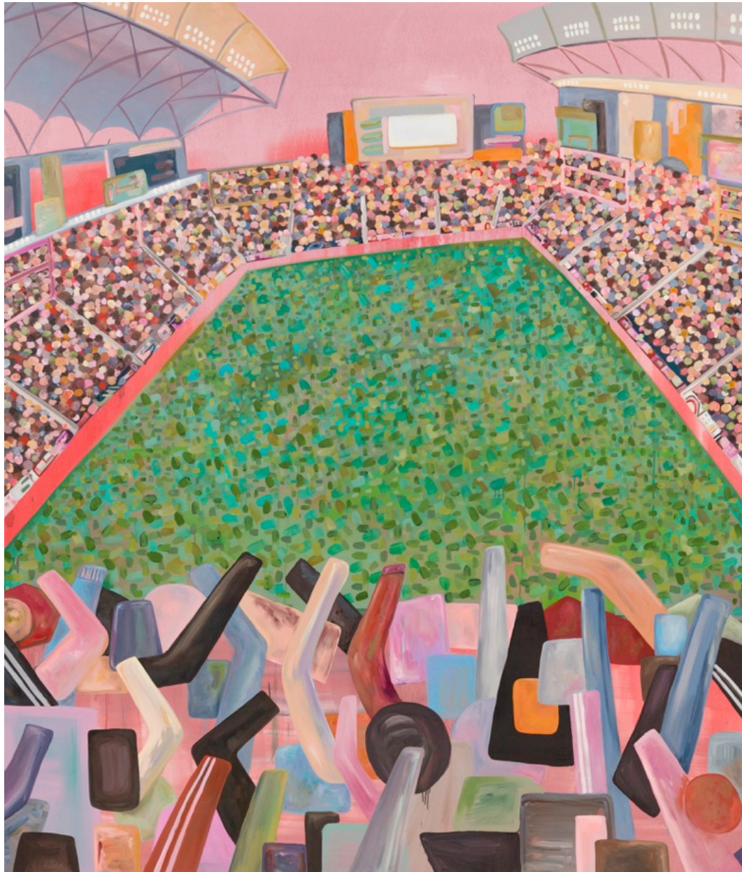
Sport Shaped Crowd 2019 oil on polyester 182.9 x 213.4 cm $10,000