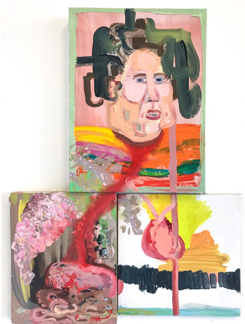
Interior Fashion 2018 oil on canvas and panel 68.6 x 53.3 cm $2,500