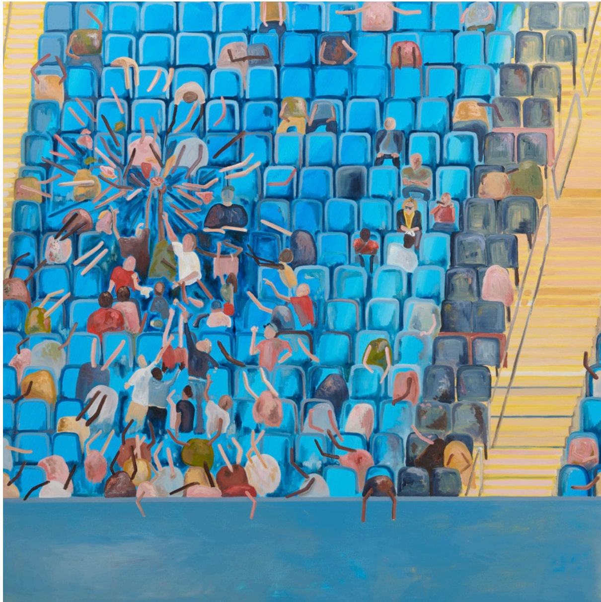
Greatness Souvenir 2020 oil on canvas 182.9 x 182.9 cm $9,500