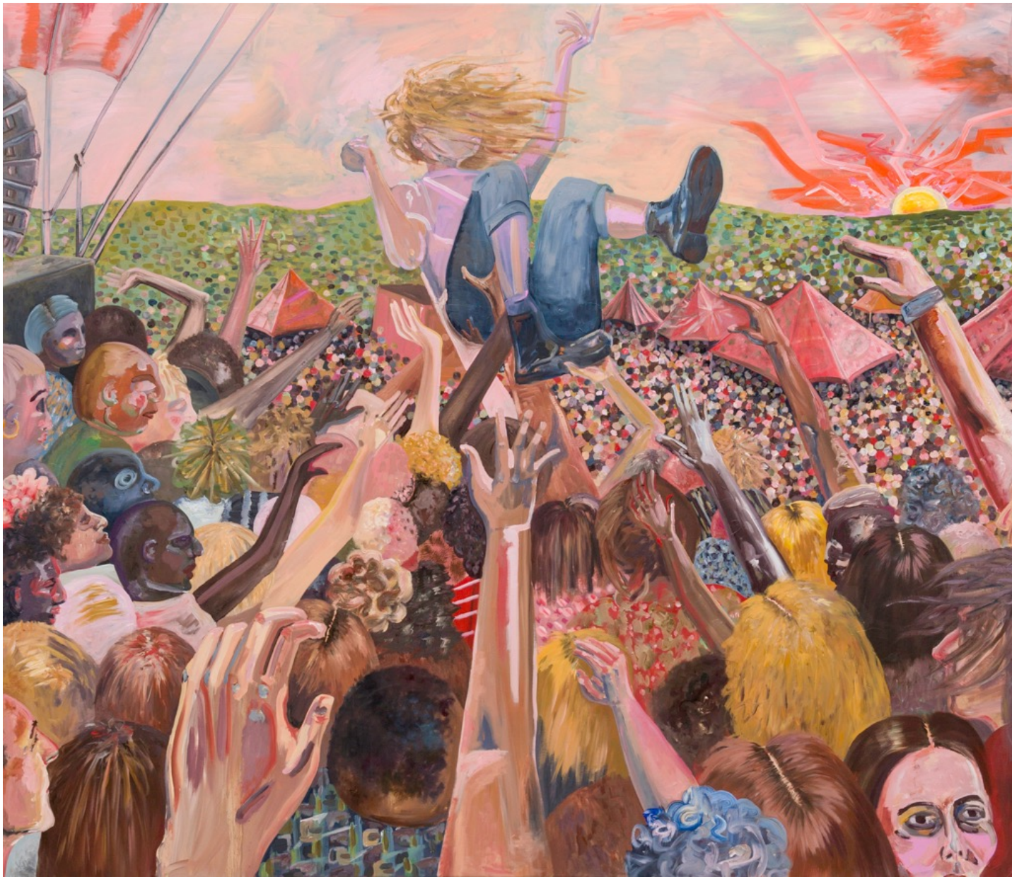
Crowd Surfing 2019 oil on linen 213.4 x 182.9 cm $10,000