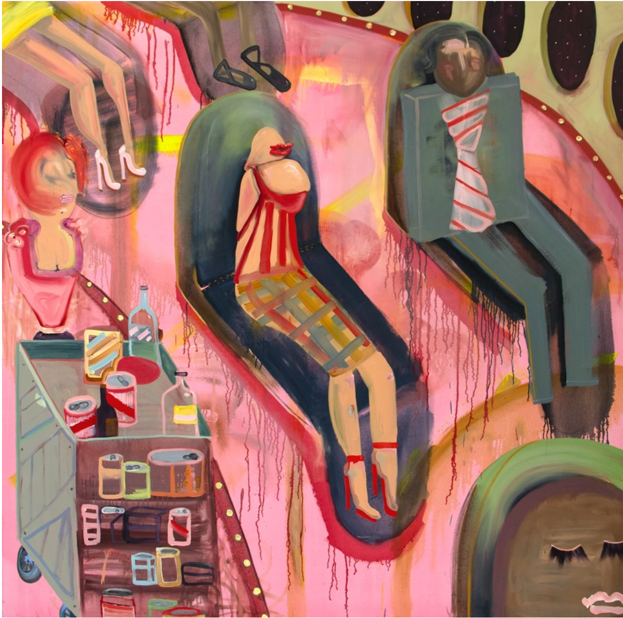
The Shapes of First Class 2018 oil on polyester 182.9 x 182.9 cm $9,500