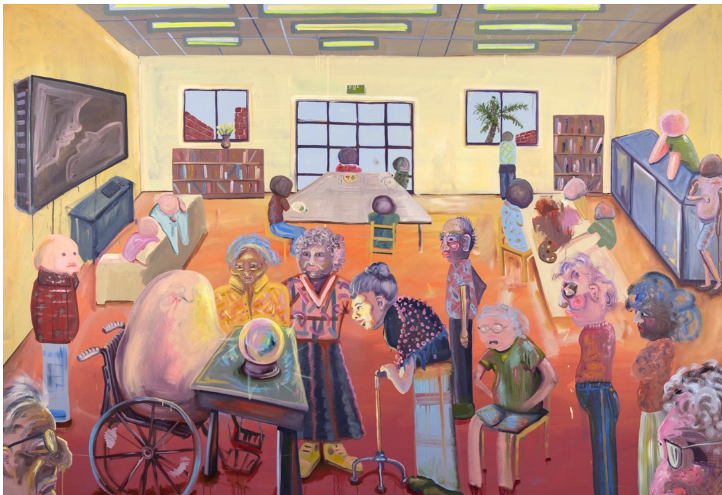
Fortune Teller in a Nursing Home 2018 oil on polyester 274.3 x 182.9 cm $14,000