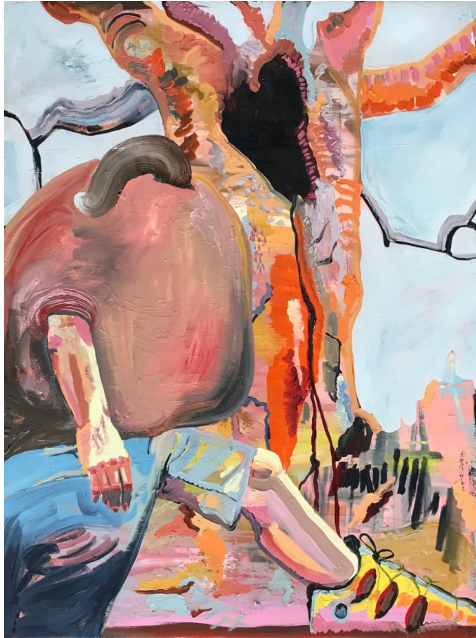
Psychedelic Hike 2018 oil on polyester 71.1 x 91.4 cm $3,000