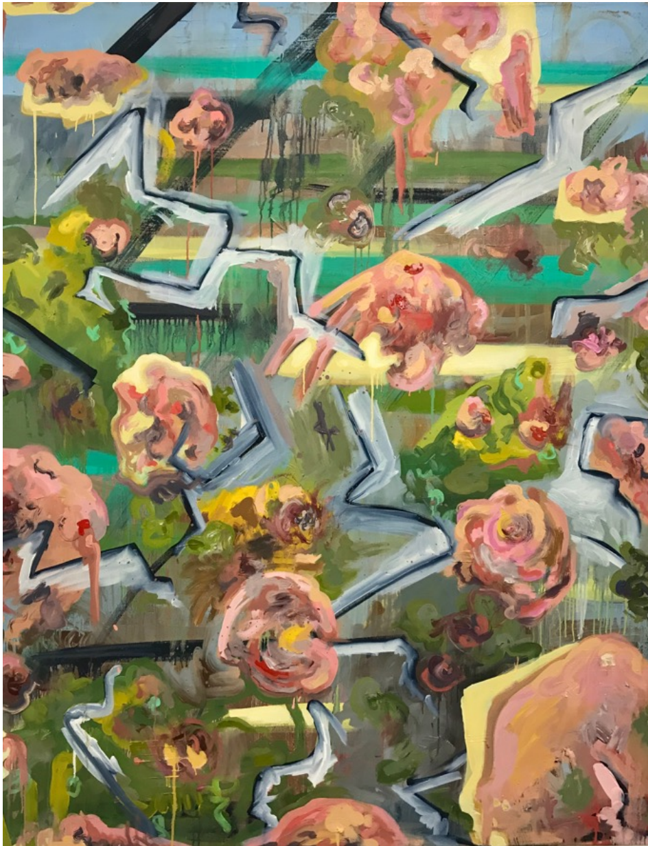
Paint Rags in a Landfill 2018 oil on canvas 152.4 x 121.9 cm $7,000