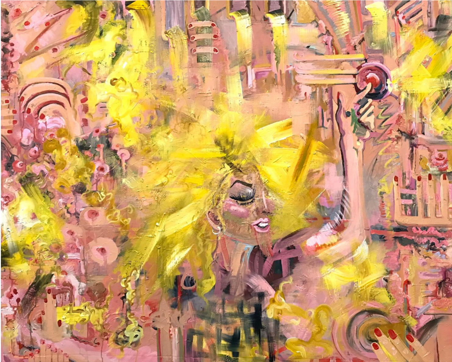
Glamour Machine 2018 oil on canvas 152.4 x 121.9 cm $7,000