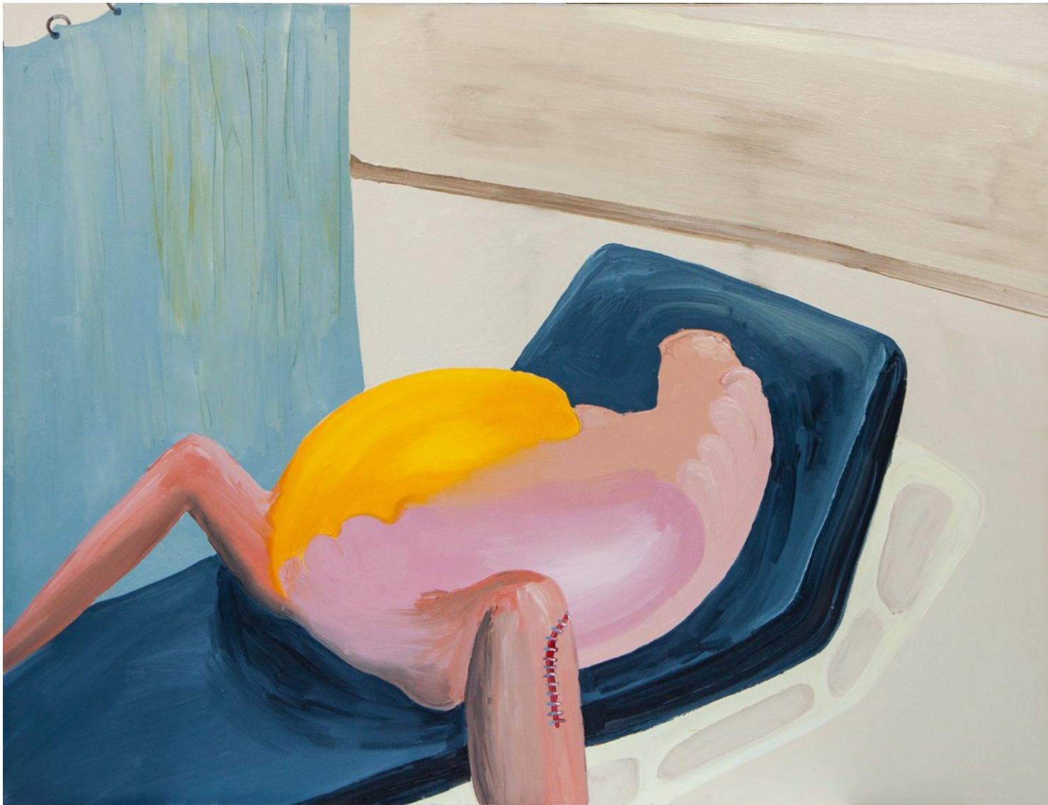
Internal Fixation 2015 oil on canvas 71.1 x 91.4 cm $3,000