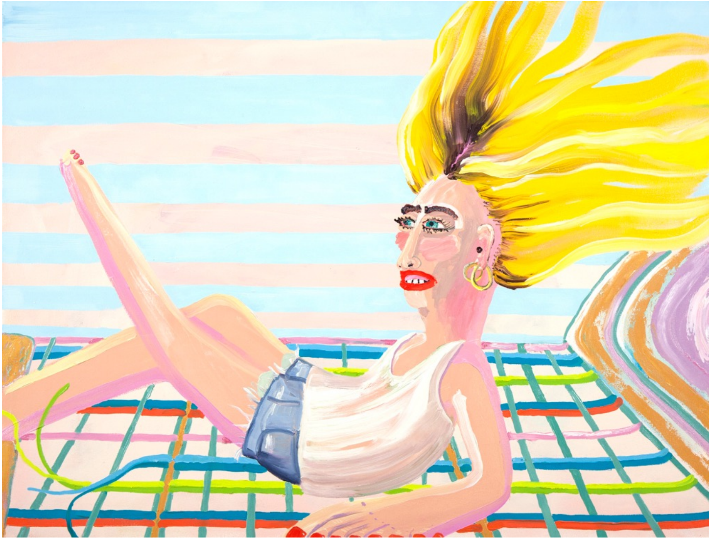
Blond on Lawnchair 2016 oil on canvas 91.4 x 121.9 cm $4,500