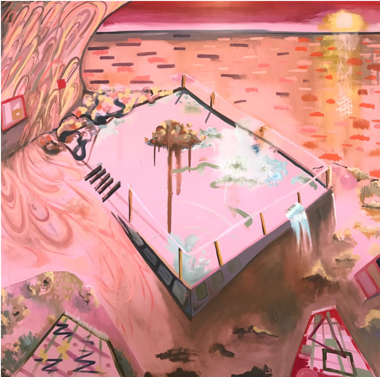
North Curl Curl Rock Pool 2019 oil on Belgian linen 182.9 x 182.9 cm $9,500