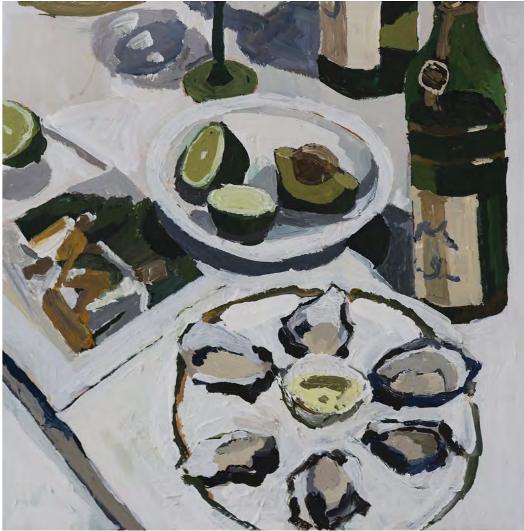
93. Zoe Young, Bayswater Brasserie Script. Scene 1 , 2022, acrylic on birchwood board, 40 x 40 cm, sale price $4,250