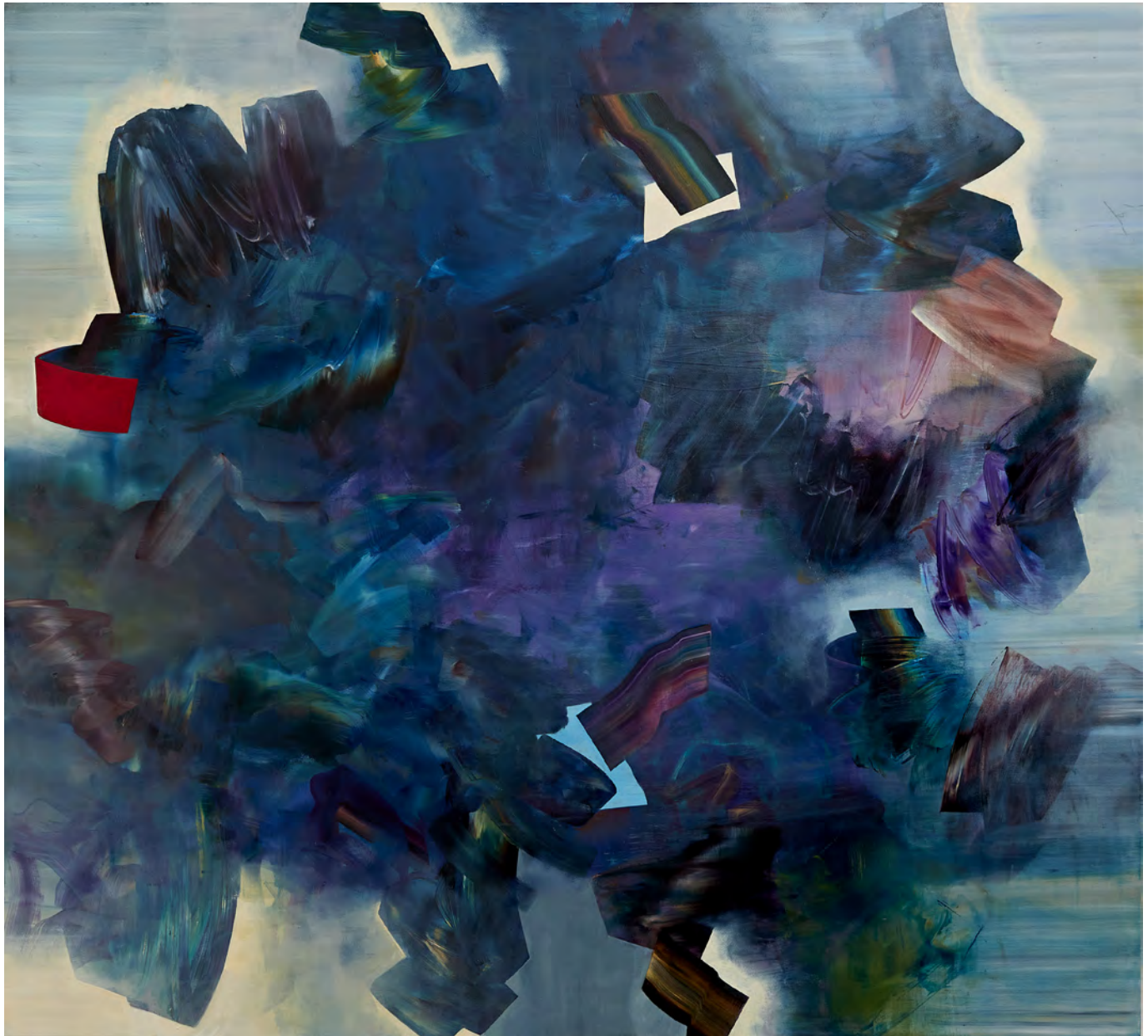
82. Telly Tu'u, Loop , 2022, oil on polycotton, 153 x 168 cm, photo Nick De Lorenzo, sale price $7,200