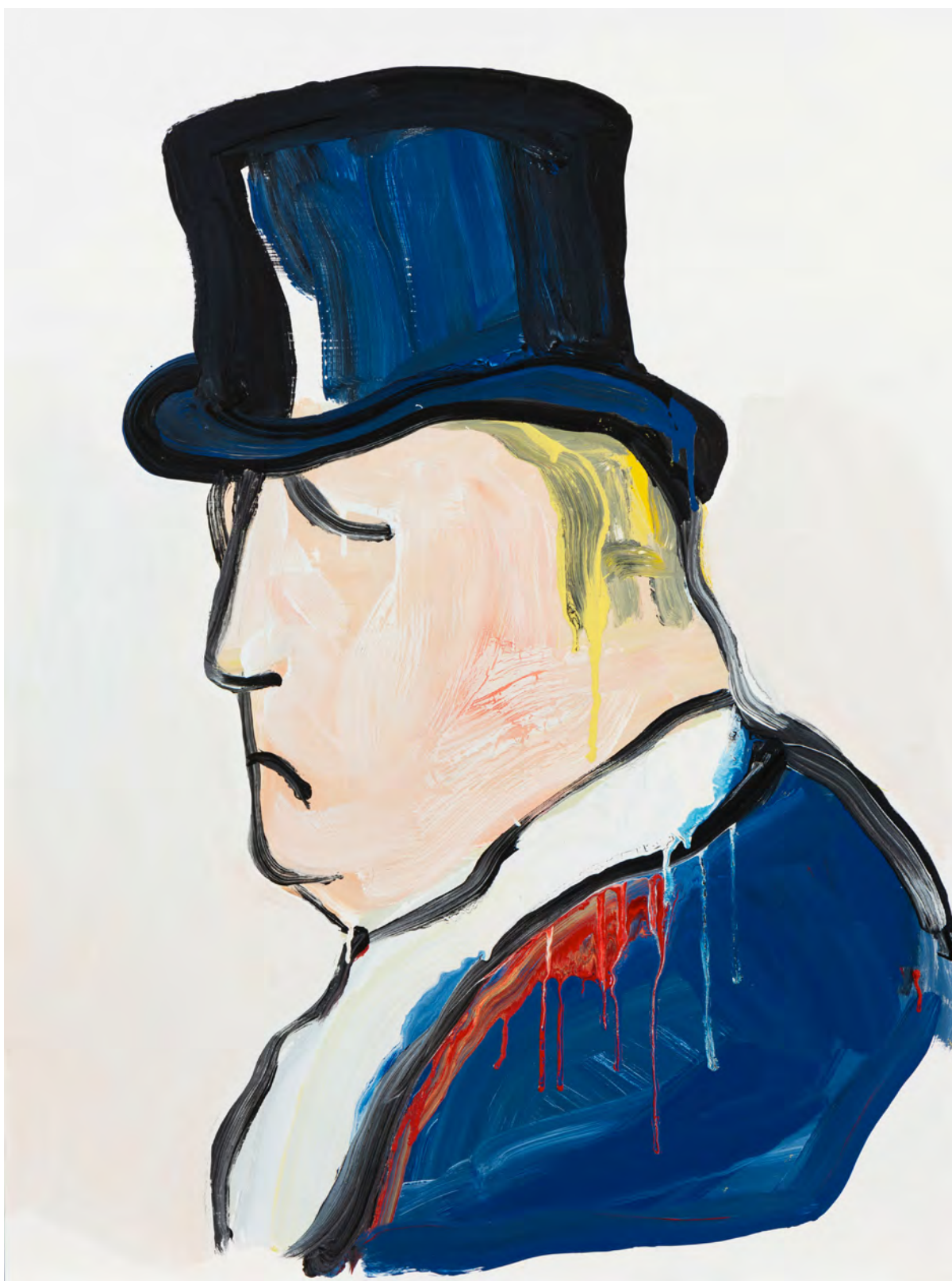
66. Jasper Knight, True lies (after the the Chap Book) , 2021, enamel, gloss acrylic and gesso on coreflute, framed in Tasmanian oak, 102 x 75 cm, sale price $4,500