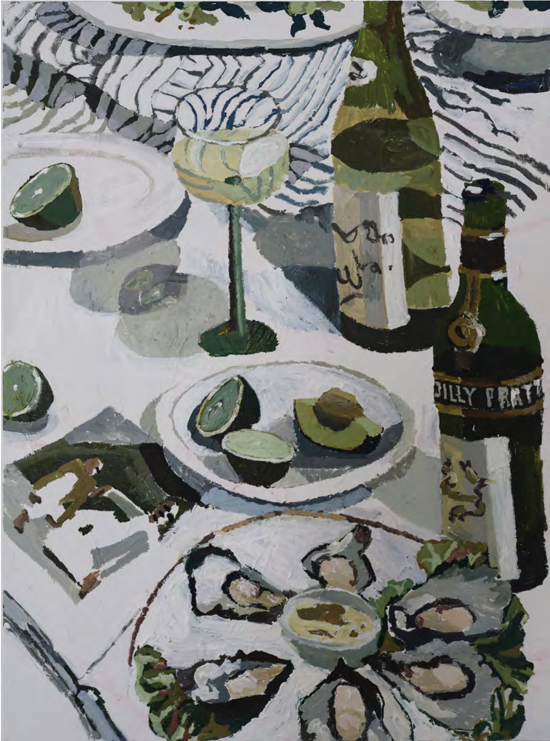
92. Zoe Young, Bayswater Brasserie Beta Video , 2022, acrylic on Belgian linen, 90 x 120 cm, photo Reg Iremonger, sale price $14,000