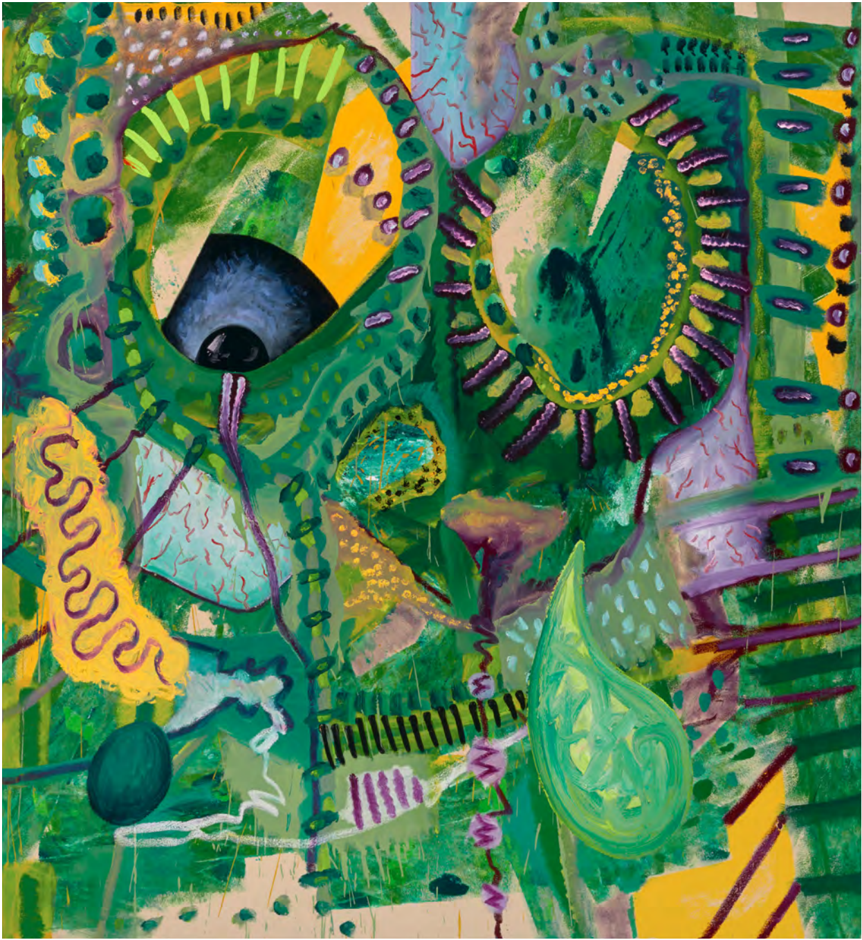
37. David Griggs, Untitled , 2022, oil on canvas, 183 × 168 cm, photo Mim Stirling, sale price $18,000