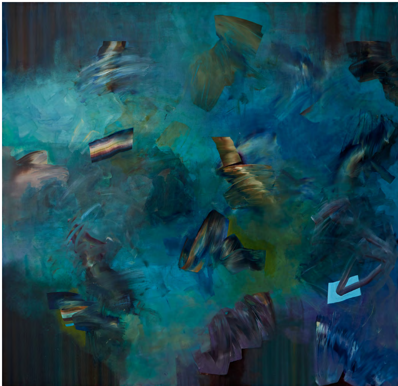
83. Telly Tu'u, Vestiges , 2022, oil on polycotton, 163 x 169 cm, photo Nick De Lorenzo, sale price $7,200