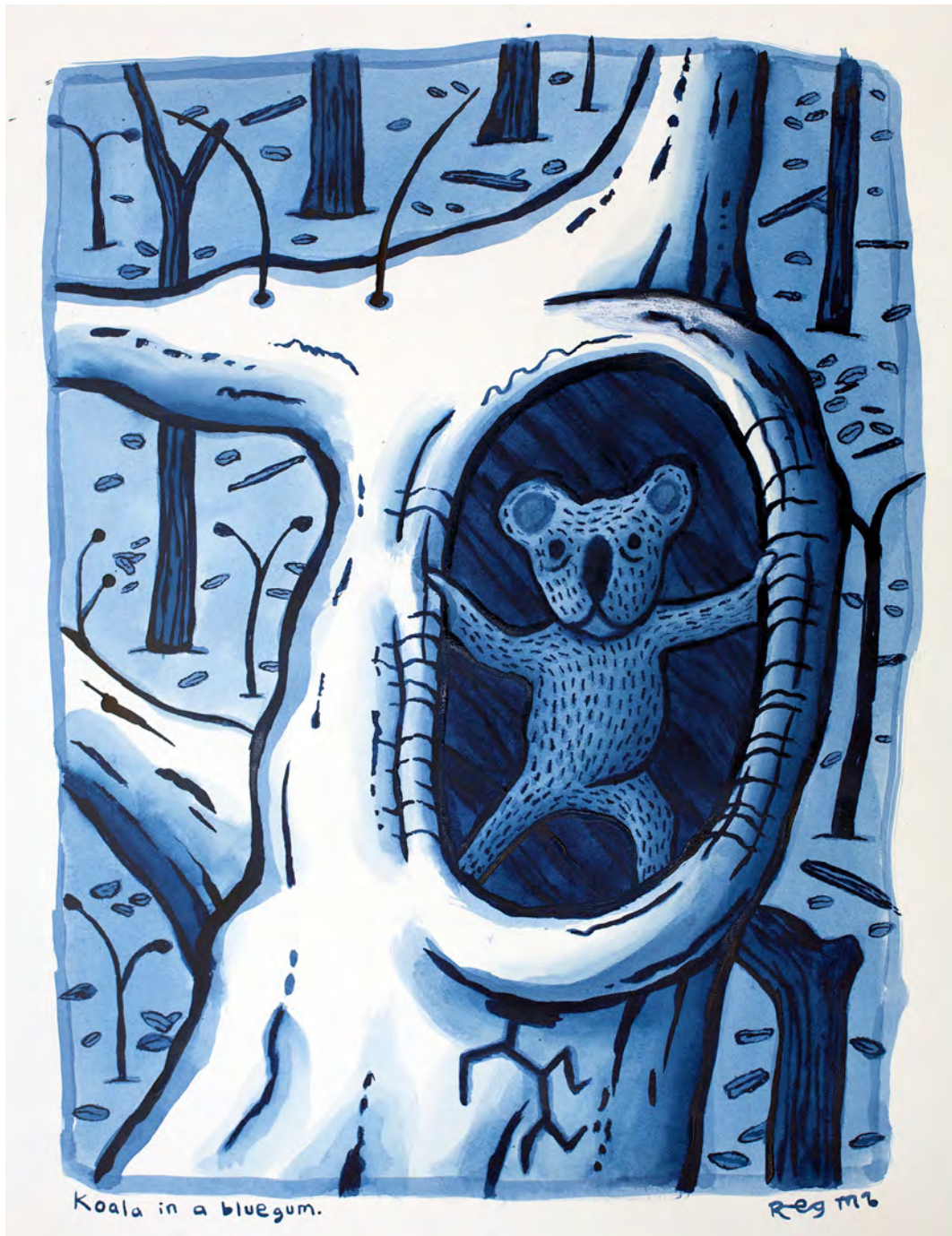
24. Chris O'Doherty a.k.a. Reg Mombassa, Koala in a blue gum , 2021, pen and ink wash, 39 x 53 cm, sale price $5,500