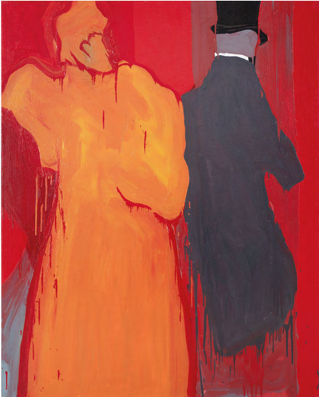
61. Jasper Knight, Husbands & Wives (after L'Argent) , 2021, enamel, gloss acrylic and gesso on linen, framed in Tasmanian Oak, 150 × 120 cm, sale price $16,000