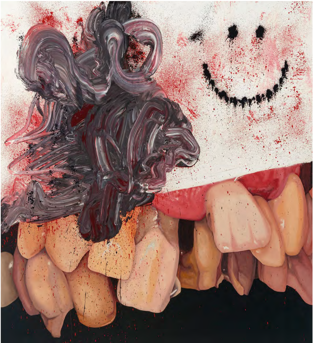
33. David Griggs, Untitled , 2022, oil on canvas, 183 × 168 cm, photo Mim Stirling, sale price $18,000