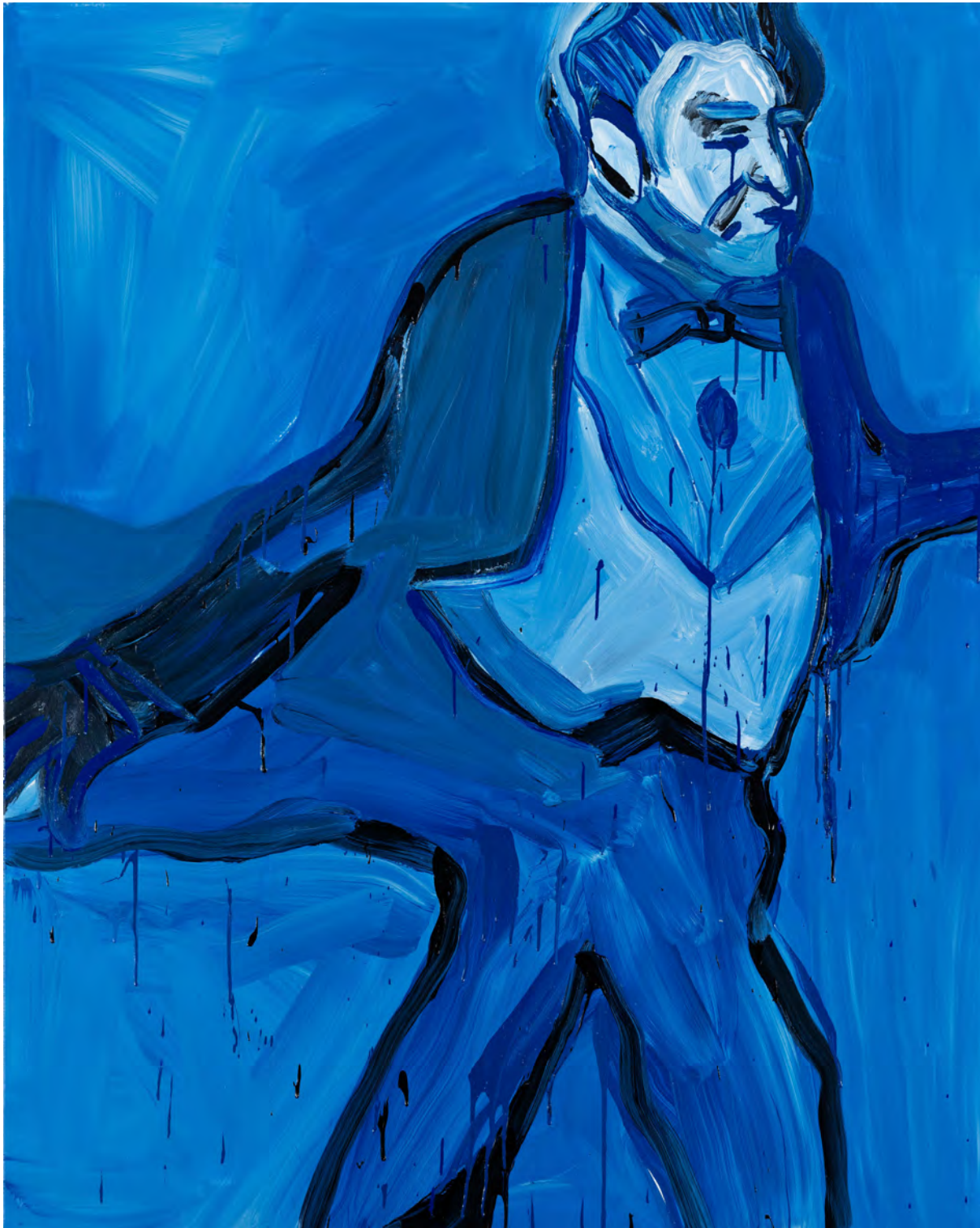
63. Jasper Knight, The Comedian (after Caudieux) , 2021, enamel, gloss acrylic and gesso on linen, framed in Tasmanian oak, 150 × 120 cm, photo Michael Bradfield, sale price $16,000