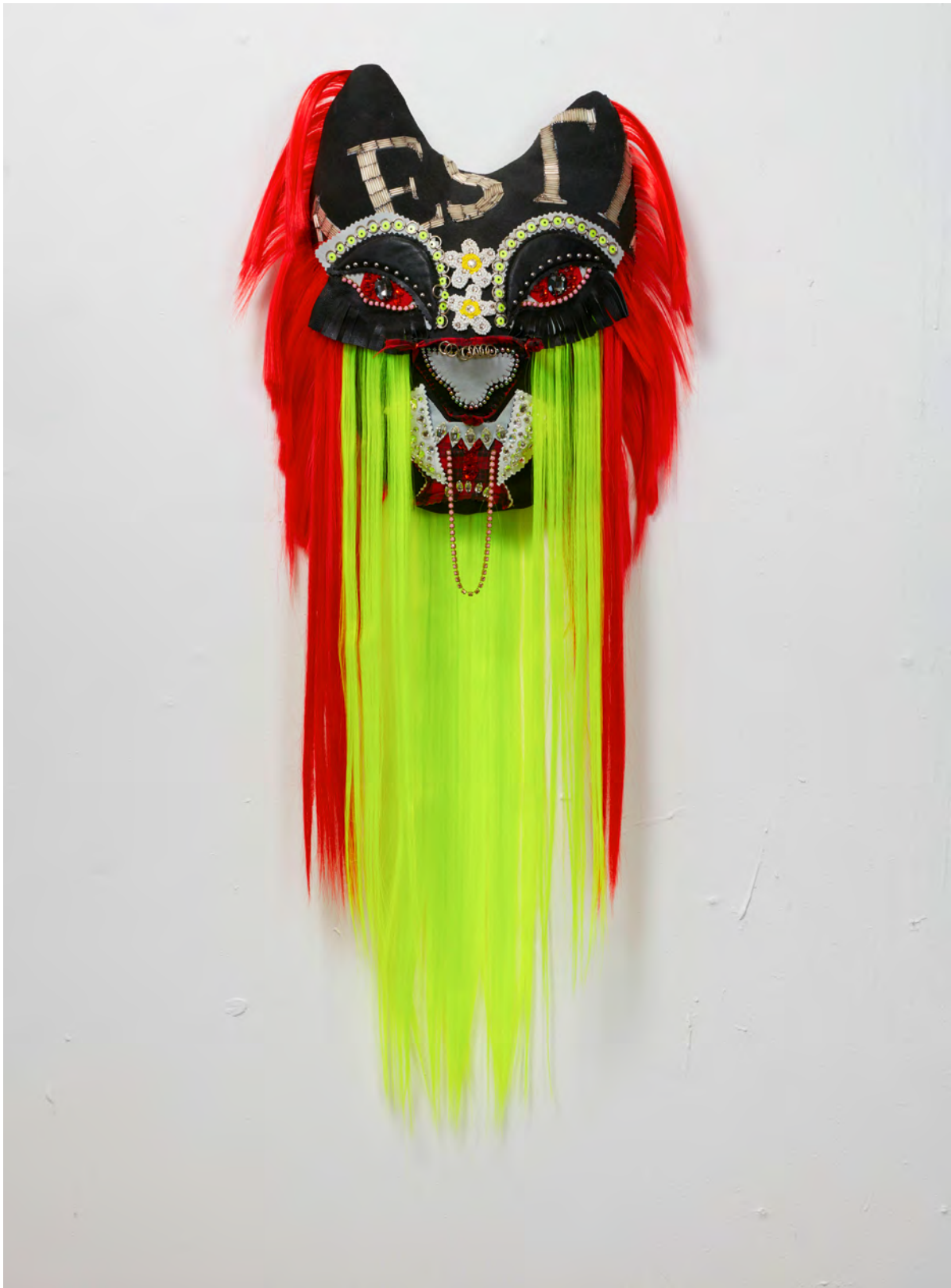
14. Bella Bruzzese, Mestiza Mischief , 2021, plaster, synthetic hair, crystal beads, leather, cup chain, glass beads, wire, 100 x 51 x 16 cm, sale price $2,500