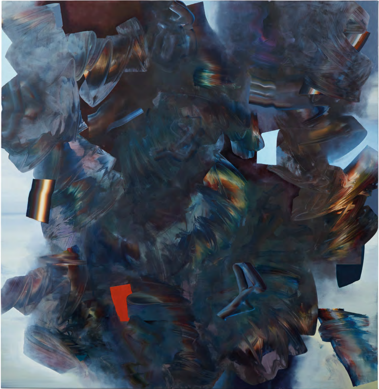
81. Telly Tu'u, Rime , 2022, oil on linen, 158 x 163 cm, sale price $7,200