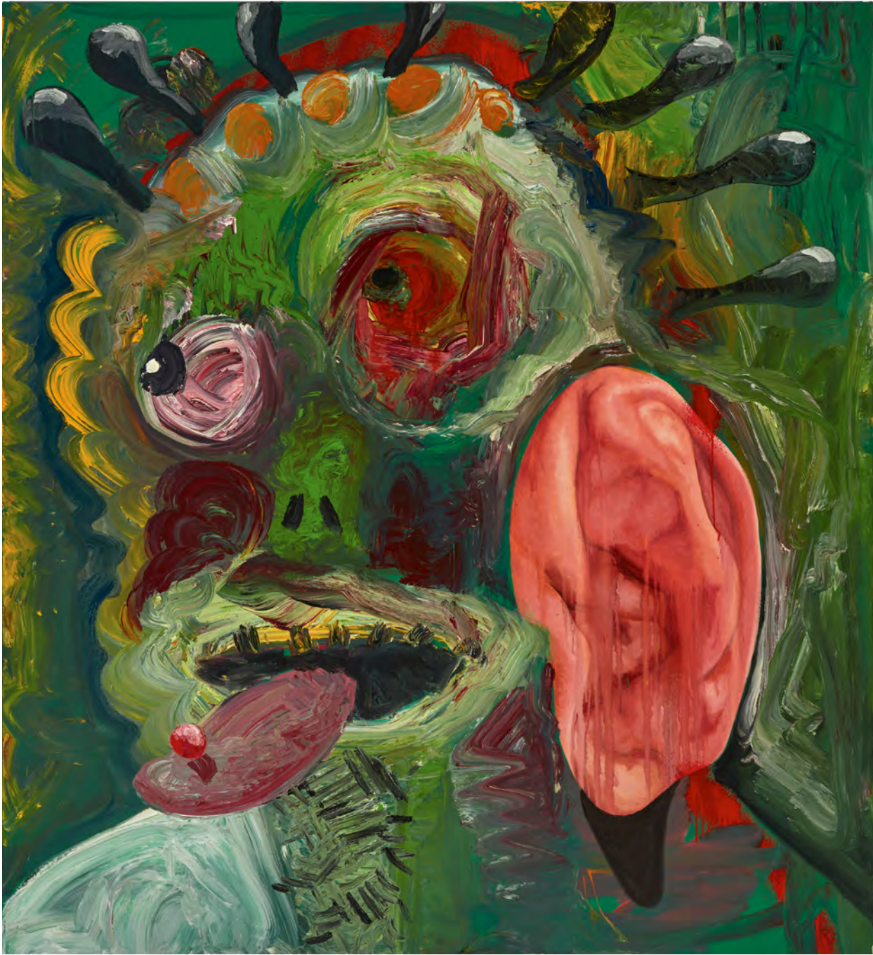
34. David Griggs, Untitled , 2022, oil on canvas, 183 × 168 cm, photo Mim Stirling, sale price $18,000