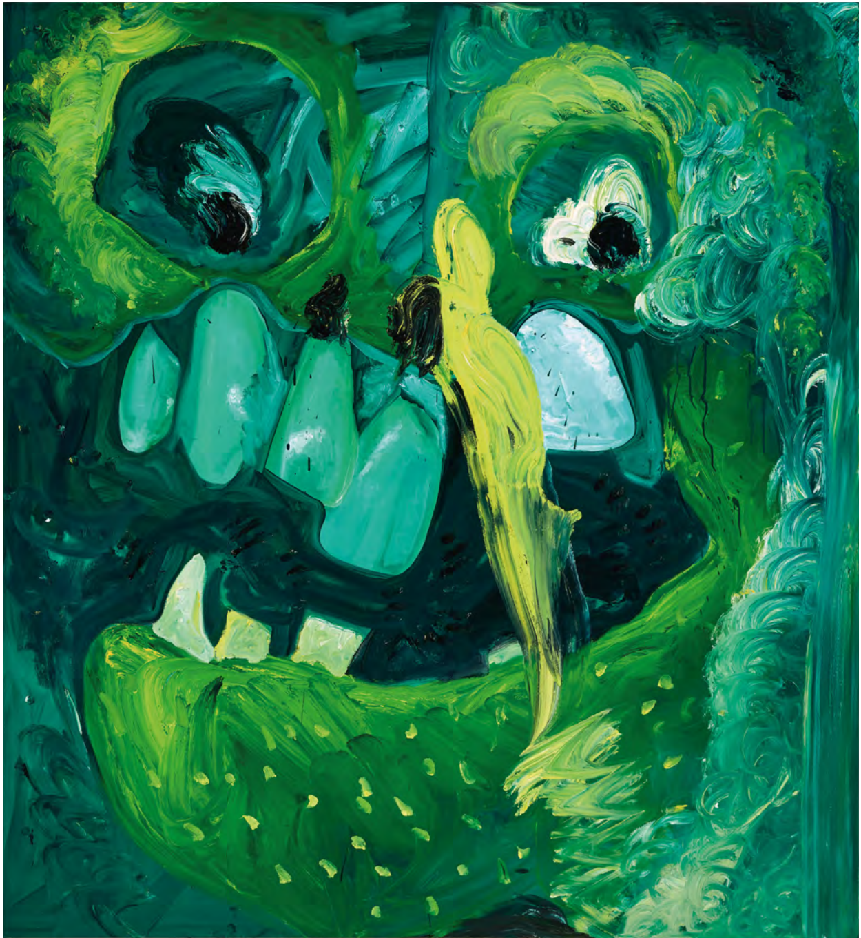
32. David Griggs, Untitled , 2022, oil on canvas, 183 × 168 cm, photo Mim Stirling, sale price $18,000