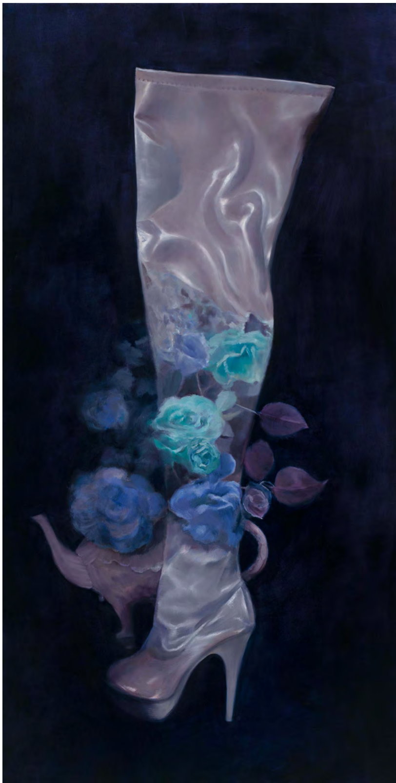
42. Heidi Yardley, Stivale , 2021, oil on linen, 154 x 75 cm, photo Matthew Stanton, sale price $9,000