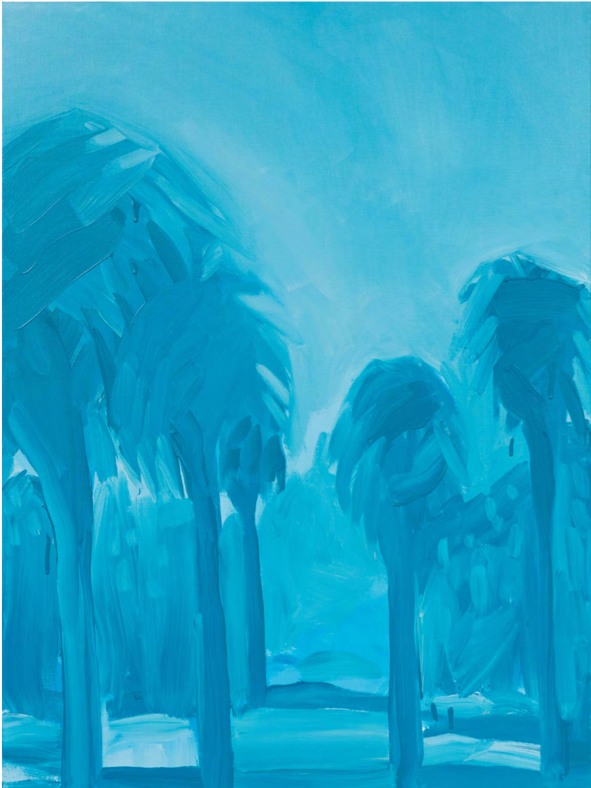
65. Jasper Knight, Bachelors in Paradise , 2022, enamel, gloss acrylic and gesso on linen framed in Tasmanian oak, 122 x 92 cm, photo Michael Bradfield, sale price $12,000