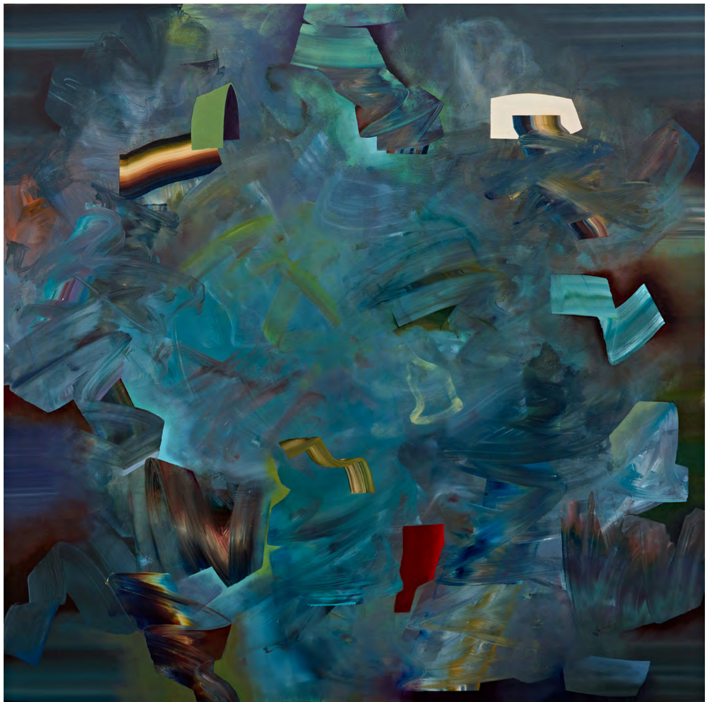
84. Telly Tu'u, Plumose , 2022, oil on linen, 132 x 132 cm, photo Nick De Lorenzo, sale price $6,800