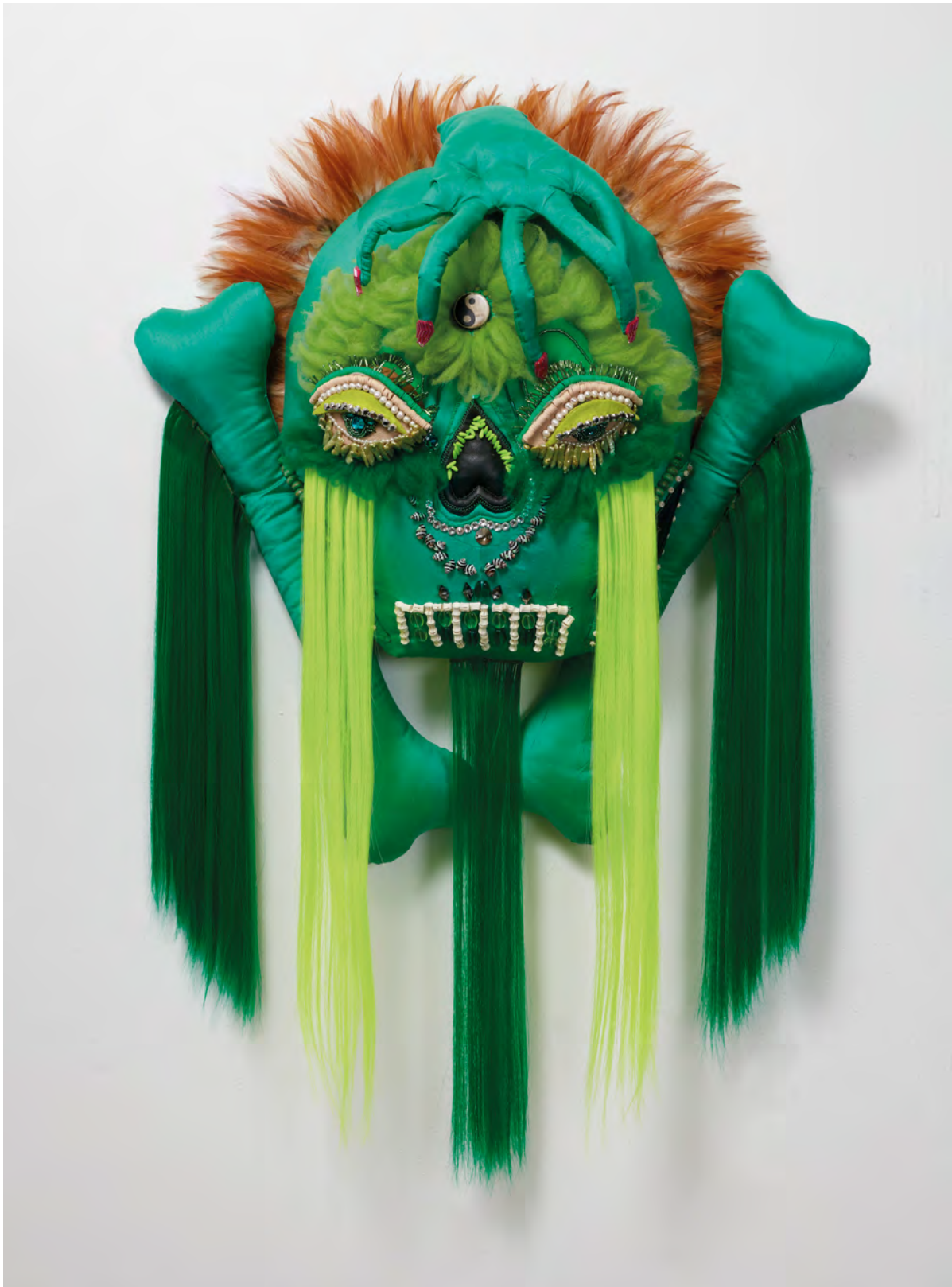
11. Bella Bruzese, Goblin Grace , 2022, plaster, Thai silk, synthetic hair, crystal beads, leather, shells, fish bone, feathers, glass beads, wire, 96 x 70 x 22 cm, photo Mim Stirling, sale price $3,000