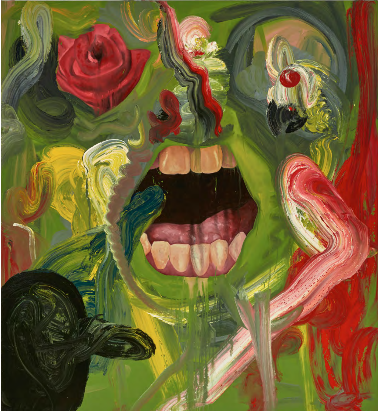
31. David Griggs, Untitled , 2022, oil on canvas, 183 × 168 cm, sale price $18,000