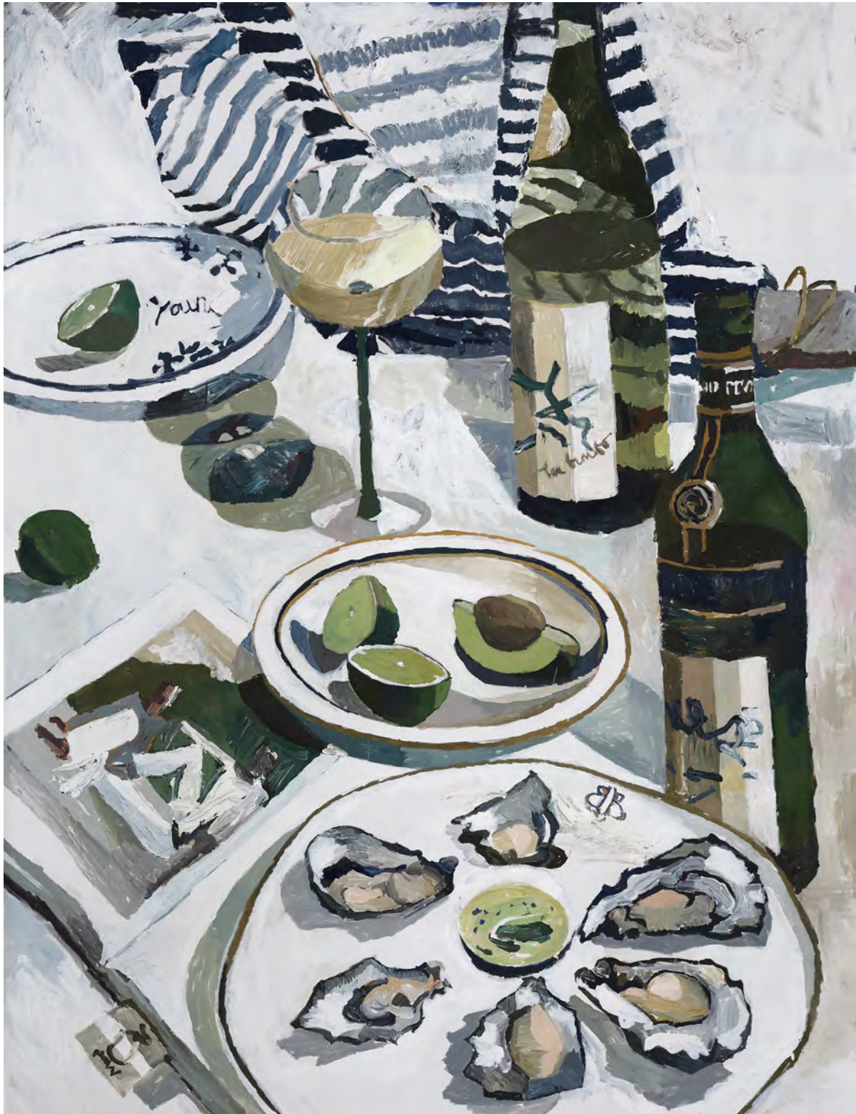
91. Zoe Young, Bayswater Brasserie Silver Screen Motion Picture , 2022, acrylic on Belgian linen, 135 × 180 cm, photo Reg Iremonger, sale price $24,000