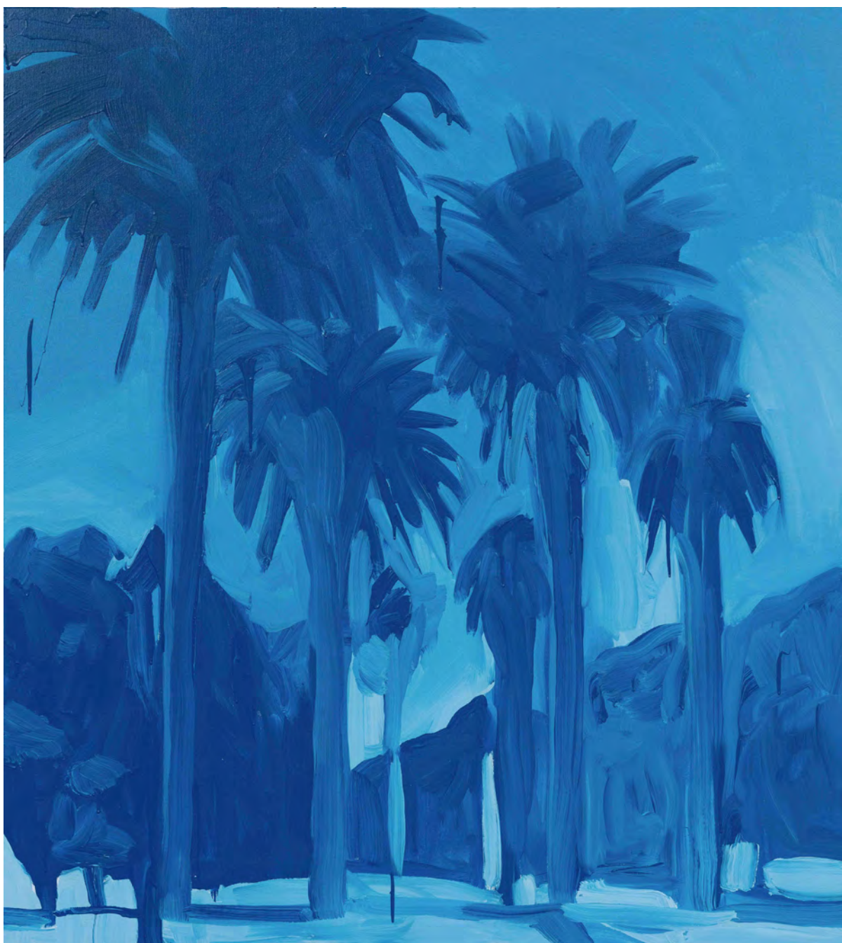
64. Jasper Knight, Centennial Palms , 2022, enamel, gloss acrylic and gesso on linen framed in Tasmanian oak, 152 × 122 cm, sale price $16,000