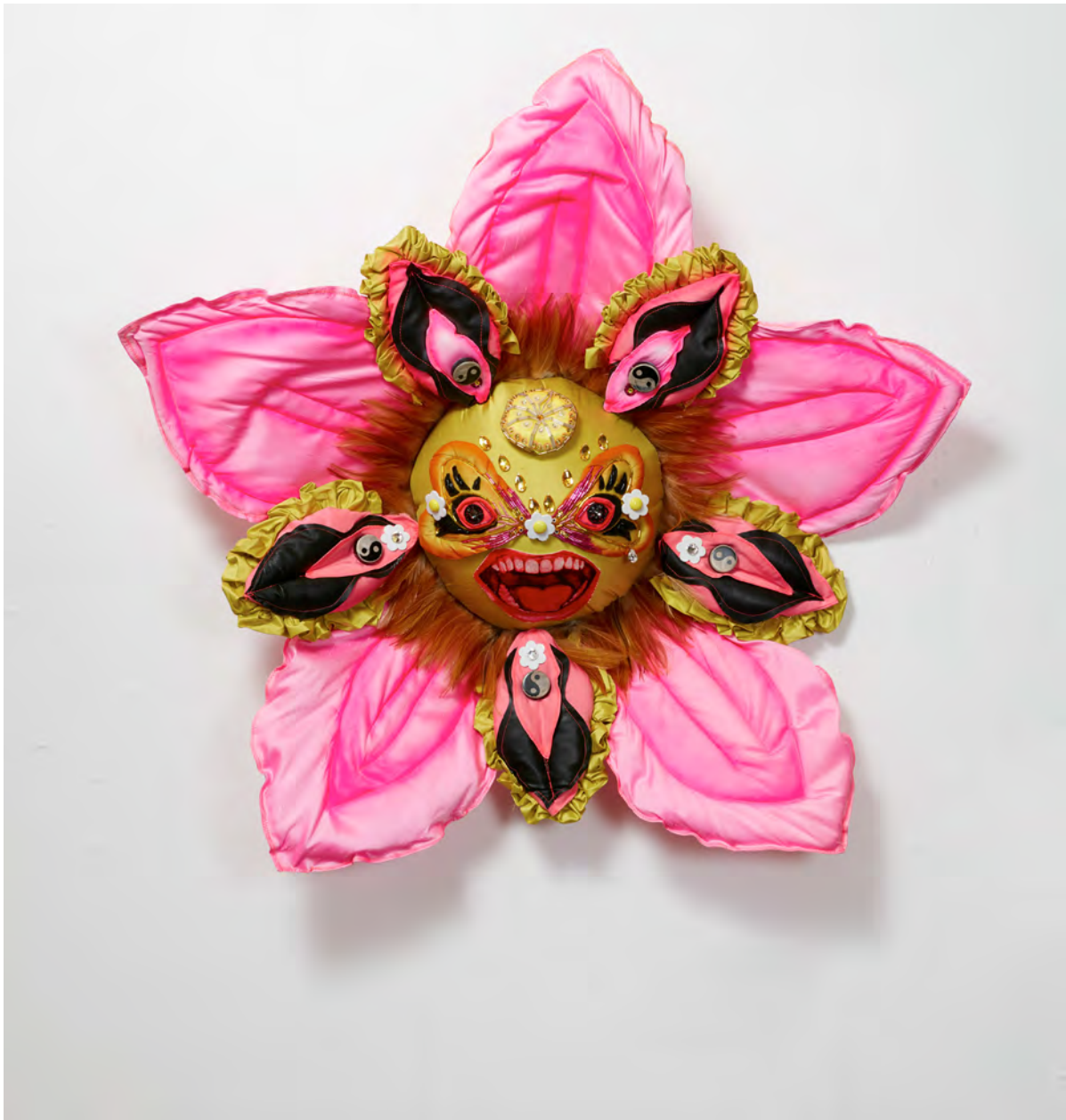
12. Bella Bruzzese, Seasonal Smile , 2022, plaster, synthetic hair, crystal beads, leather, cup chain, glass beads, 86 x 82 x 12cm, photo Mim Stirling, sale price $3,000