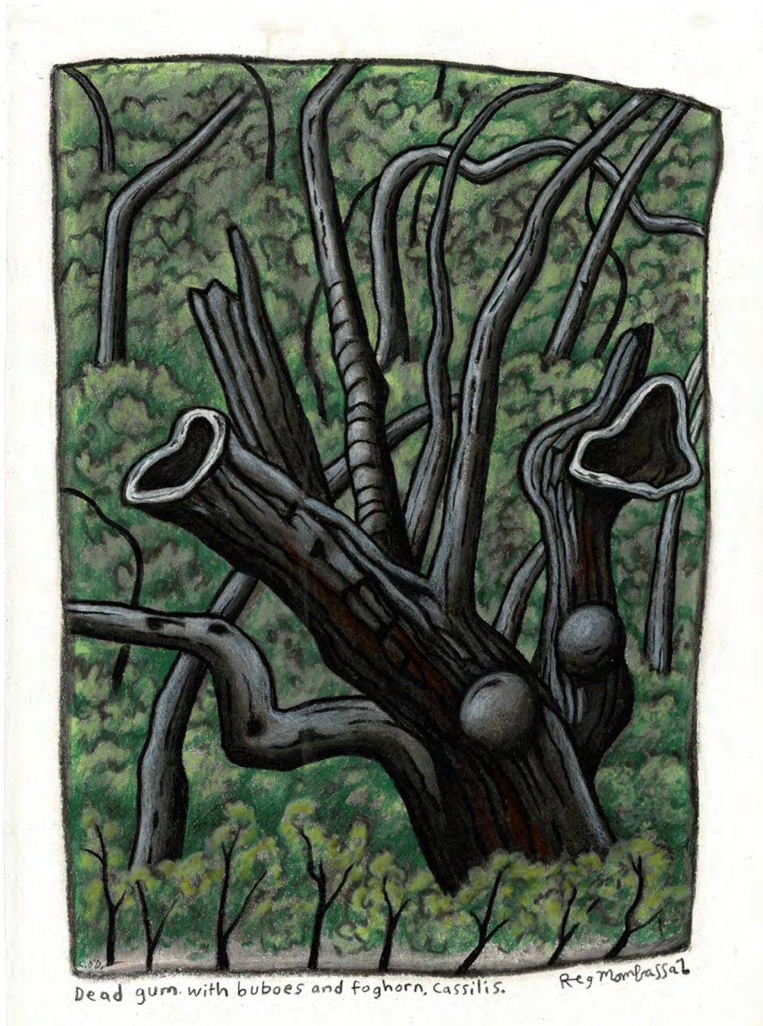
Dead gum with buboes and foghorn, Cassilis.