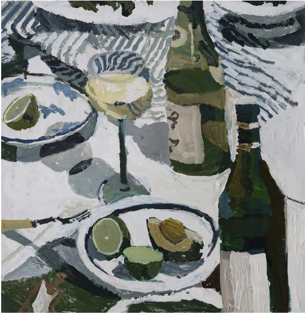
94. Zoe Young, Bayswater Brasserie Script. Scene II , 2022, acrylic on birchwood board, 40 x 40 cm, photo Reg Iremonger, sale price $4,250