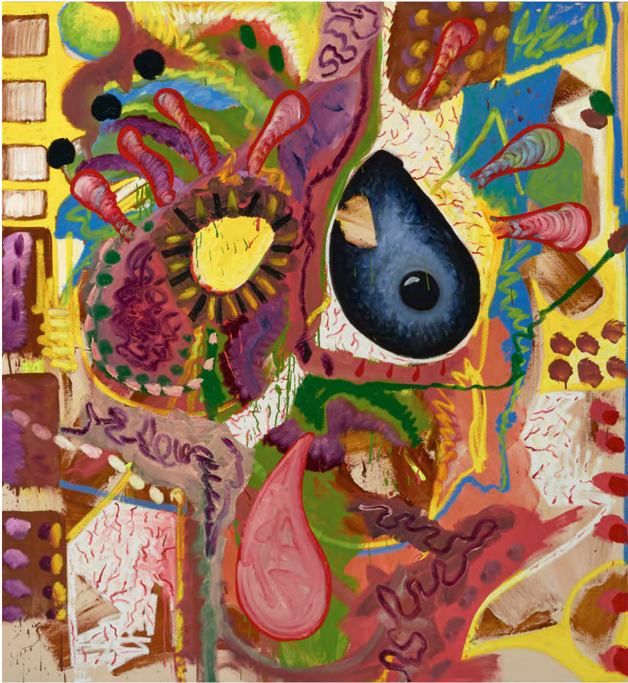
35. David Griggs, Untitled , 2022, oil on canvas, 183 × 168 cm, photo Mim Stirling, sale price $18,000