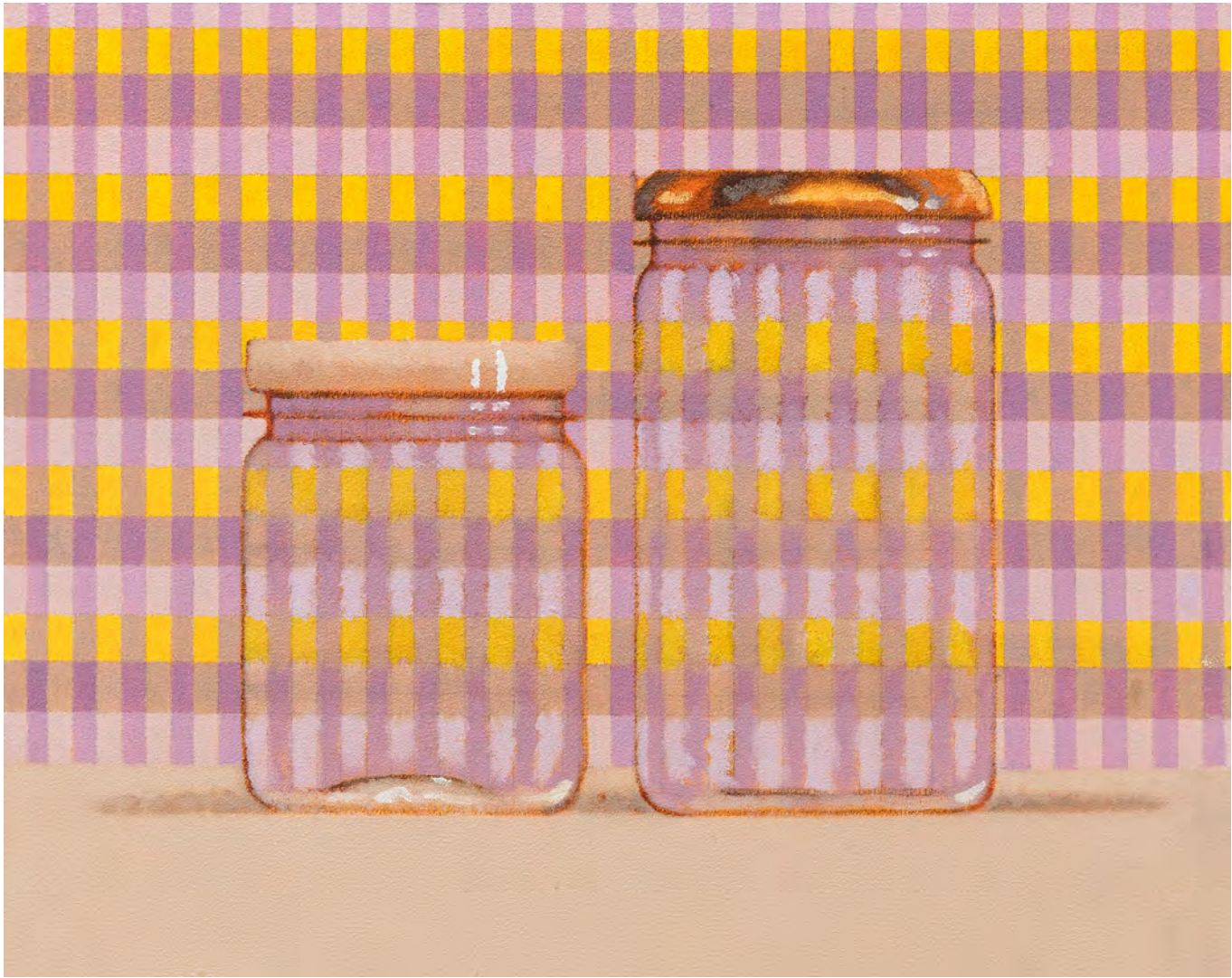
52. India Mark, IGNIS XI , 2022, oil on wood panel, 20.5 x 25.5 cm, photo Jordan Malane, sale price $2,300