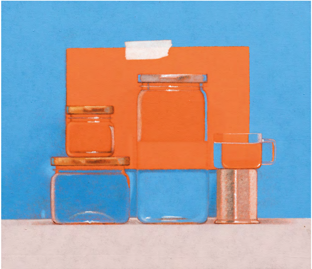
51. India Mark, SCHMINCKE VI , 2022, oil on wood panel, 35 × 40 cm, photo Jordan Malane, sale price $3,500