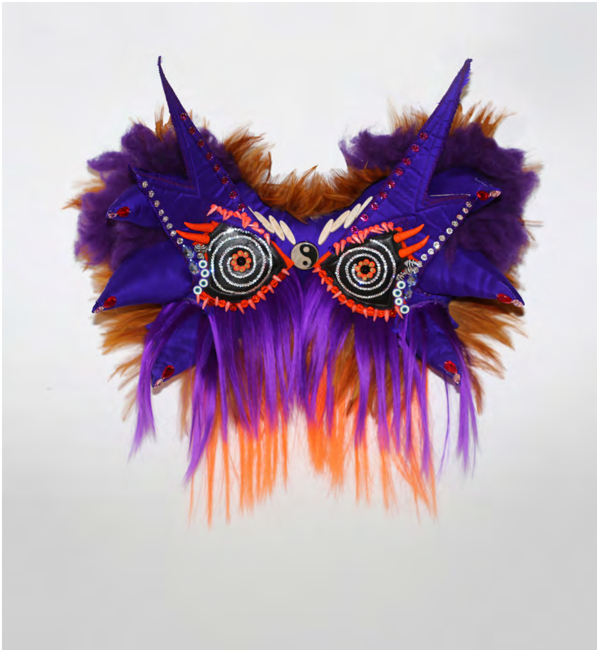
13. Bella Bruzzese, Abracadabra , 2022, plaster, Thai silk, synthetic hair, crystal beads, leather, shells, wool, feathers, glass beads, wire, 47 x 49 x 16cm, photo Mim Stirling, sale price $2,500