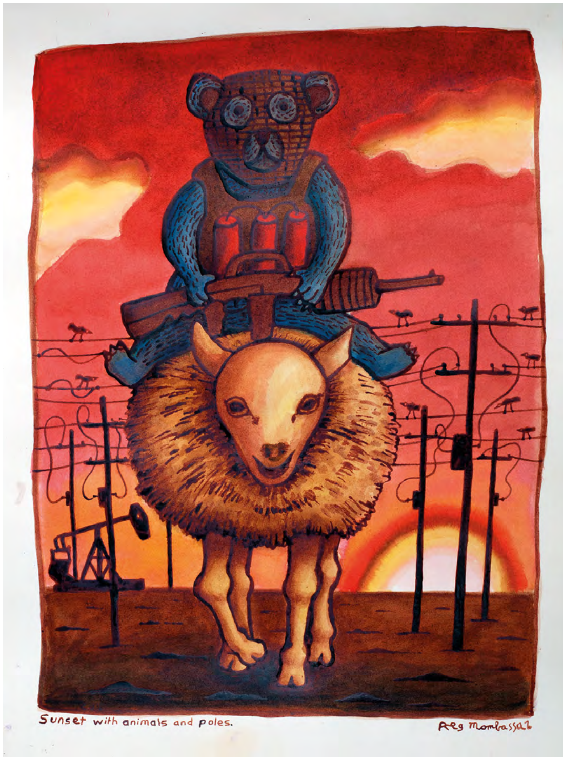
22. Chris O'Doherty a.k.a. Reg Mombassa, Sundown with animals and poles , 2021, pen and ink wash, 40 × 54 cm, photo Martina O'Doherty, sale price $6,600