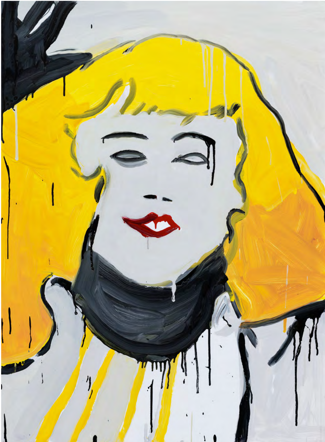
66. Jasper Knight, London & Paris (after Confetti) , 2021, enamel, gloss acrylic and gesso on coreflute, framed in matte white, 122 x 91 cm, photo Michael Bradfield, sale price $5,500