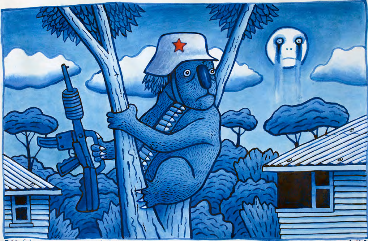
Deepfake nocturne: Koala with an AR15.