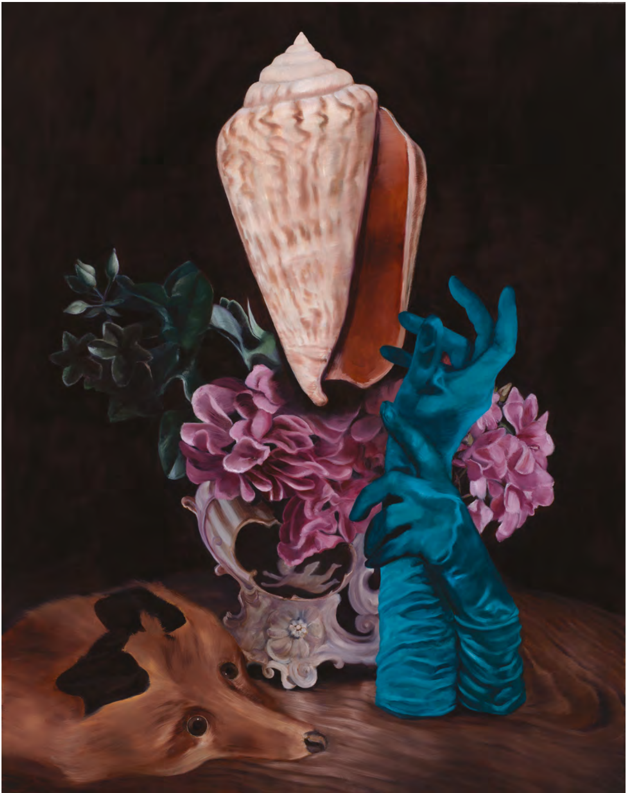
41. Heidi Yardley, Drenched in a lonely vase , 2021, oil on linen, 140 × 110 cm, photo Matthew Stanton, sale price $12,000