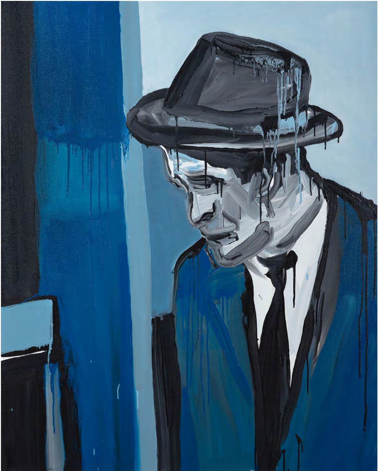
62. Jasper Knight, Lost on Third Avenue , 2021, enamel, gloss acrylic and gesso on linen, framed in Tasmanian oak, 150 × 120 cm, sale price $16,000