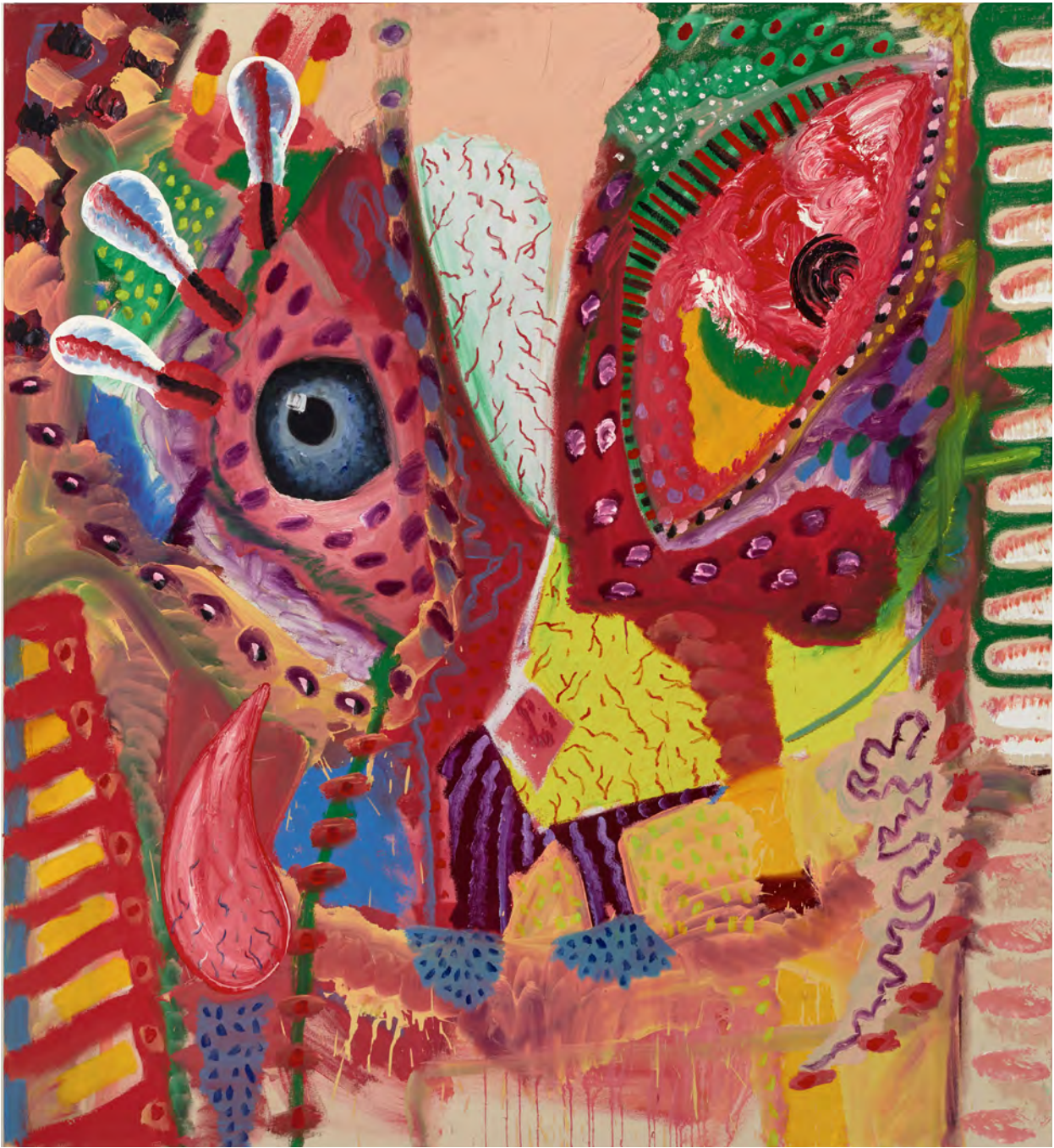
36. David Griggs, Untitled , 2022, oil on canvas, 183 × 168 cm, photo Mim Stirling, sale price $18,000