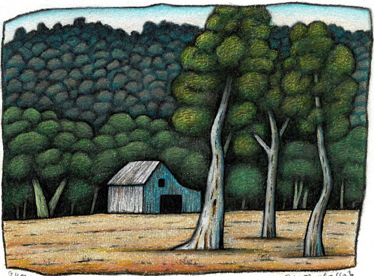
Gums and barn, Megalong Valley.