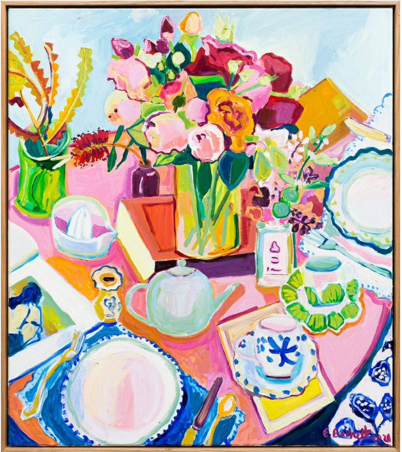
ELIZABETH BARNETT Table for Two , 2021 oil on linen 77 x 67cm $ 4,400