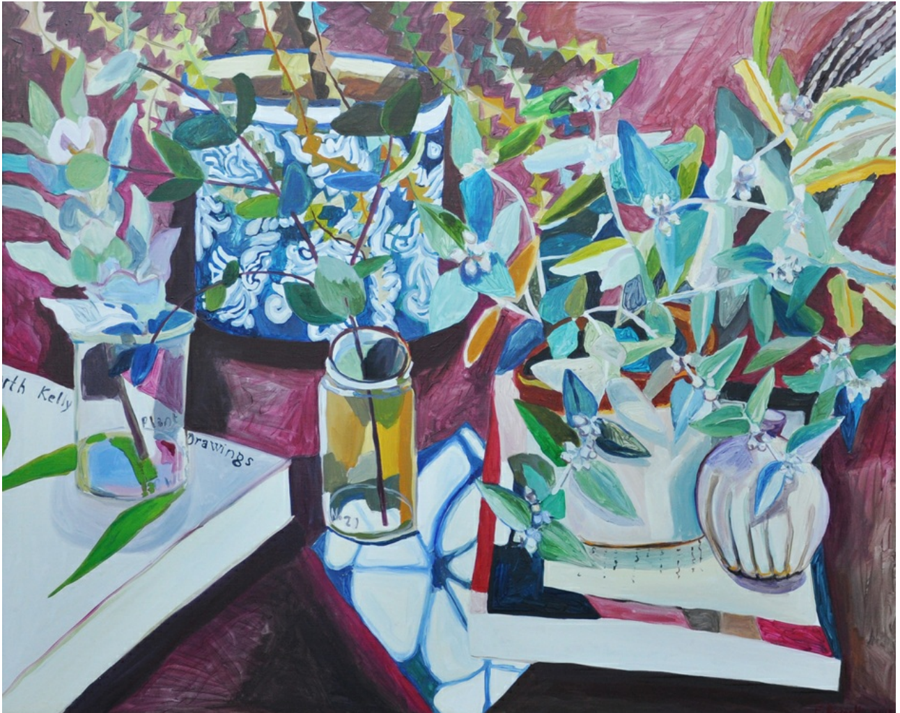
ELIZABETH BARNETT Plant drawings and foraged foliage, 2019 oil on linen 123 x 152cm $ 7,900