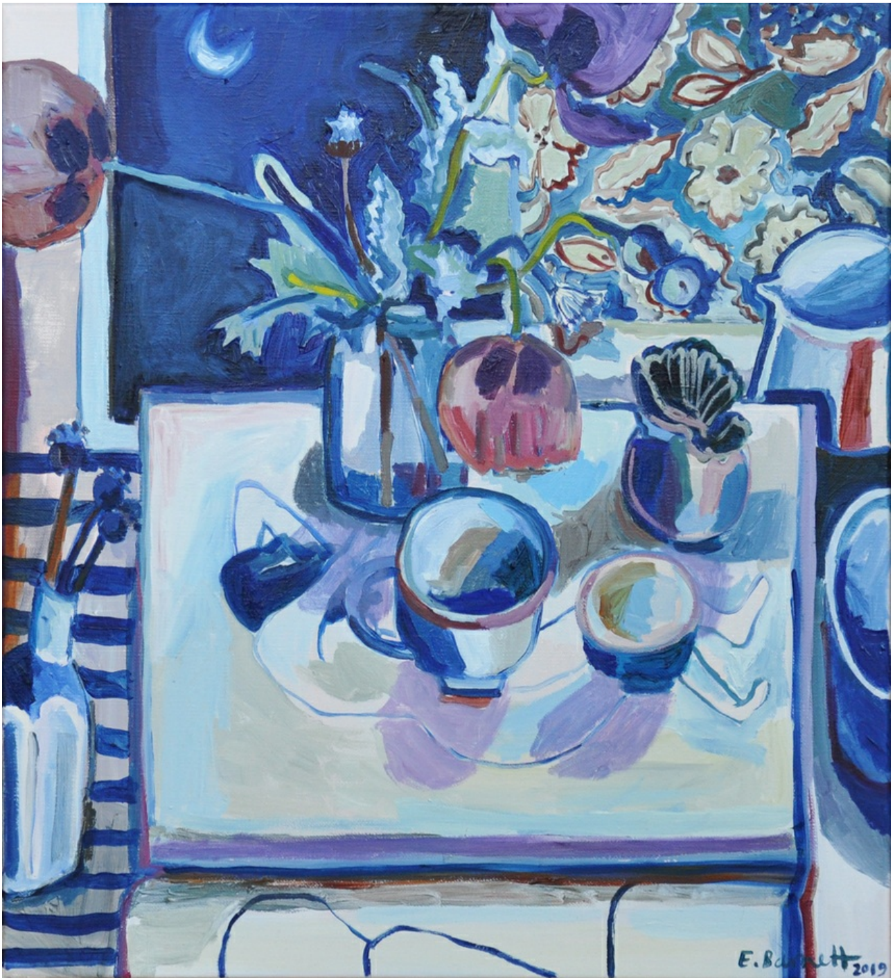
ELIZABETH BARNETT When I'm not sleeping honey , 2019 oil on linen 56 x 51cm $ 3,400