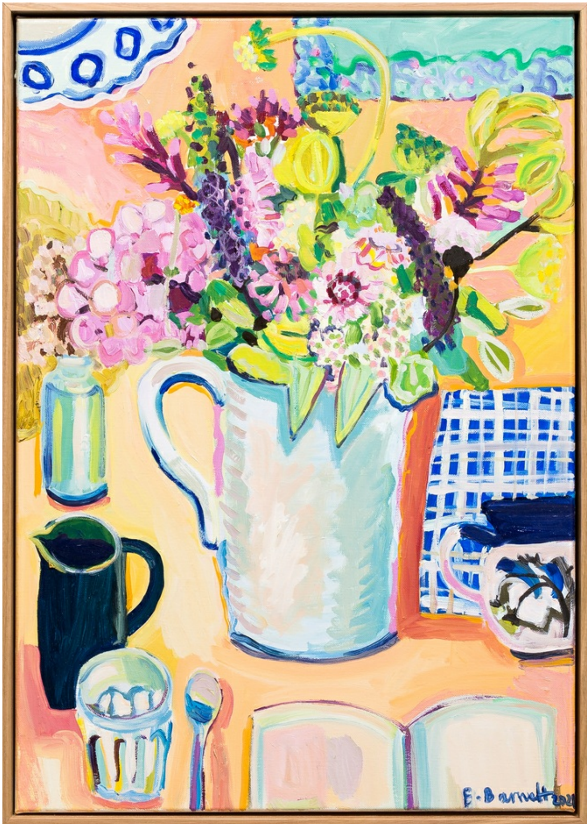
ELIZABETH BARNETT In My Own Company , 2021 oil on linen 71 x 51cm $ 4,000