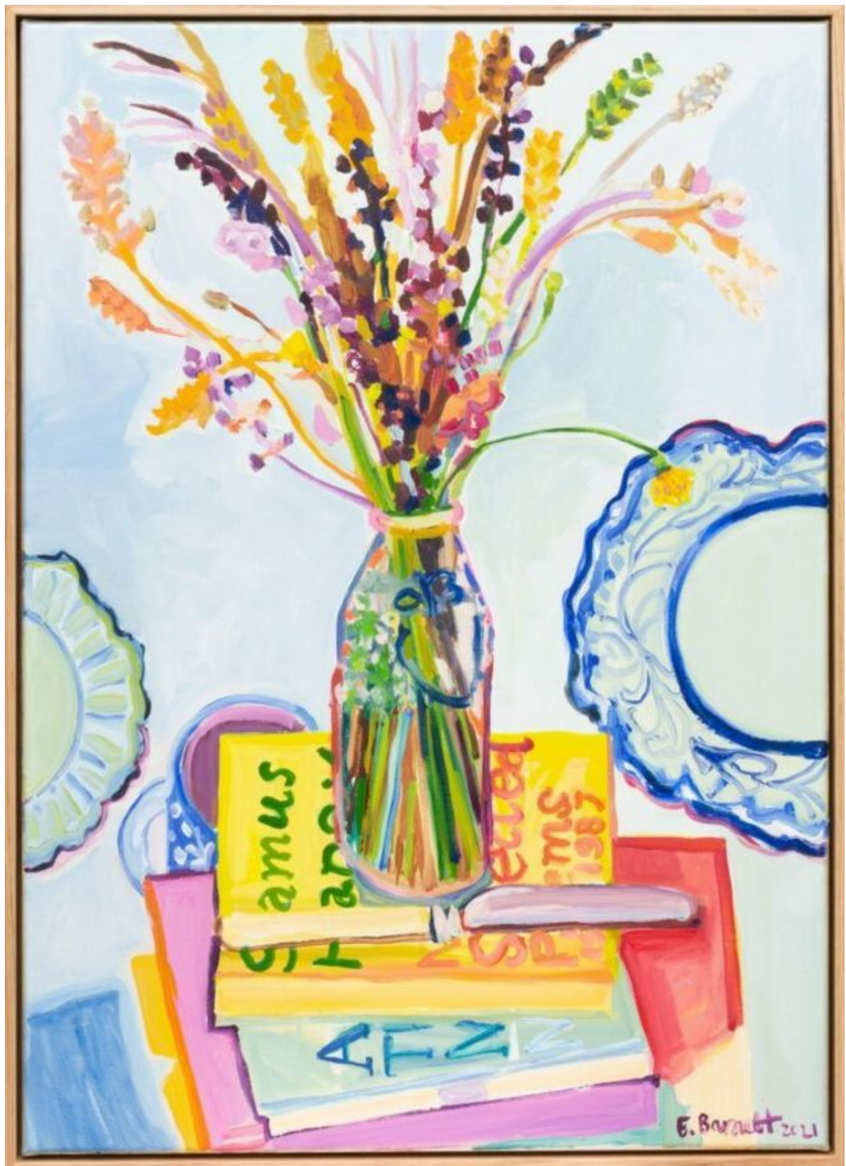
ELIZABETH BARNETT Farmer's Table with Cut Grasses , 2021 oil on linen 71 x 51cm $ 4,000