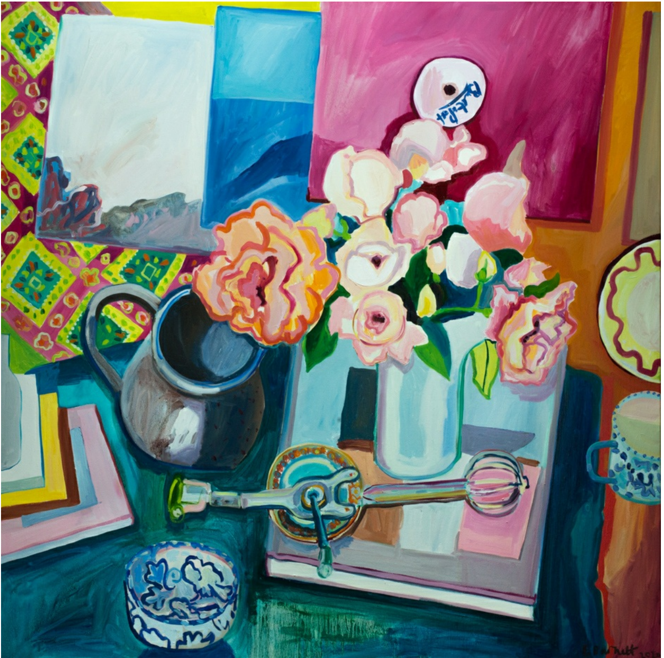
ELIZABETH BARNETT Roses Never Smelled as Sweet , 2020 oil on linen 107 x 107cm $ 5,400