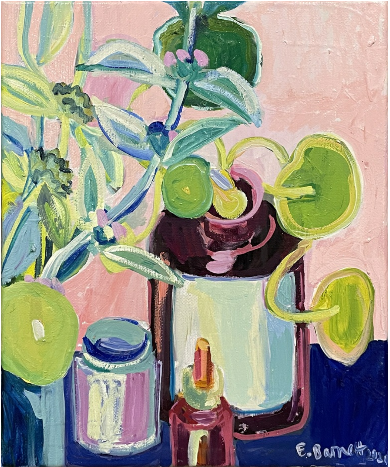
ELIZABETH BARNETT Slow Growth , 2020 oil on linen 31 x 26cm $ 1,300