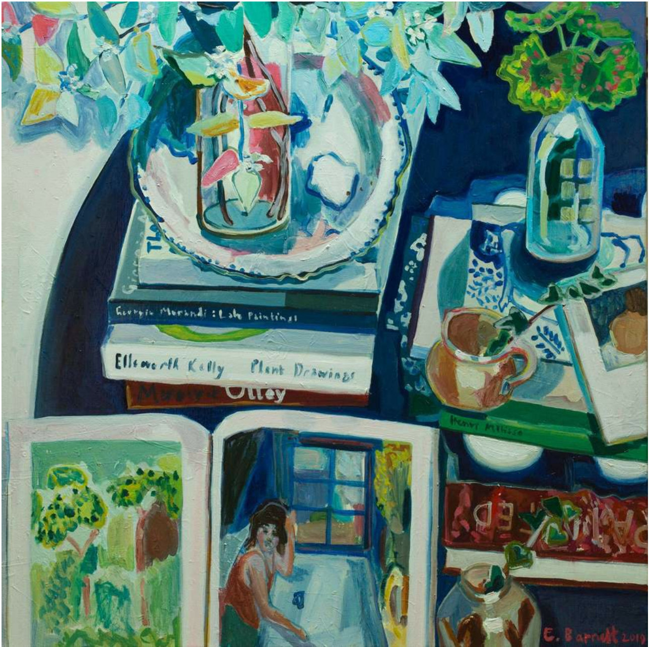
ELIZABETH BARNETT Window Reflections , 2019 oil on linen 71 x 71cm $ 4,400