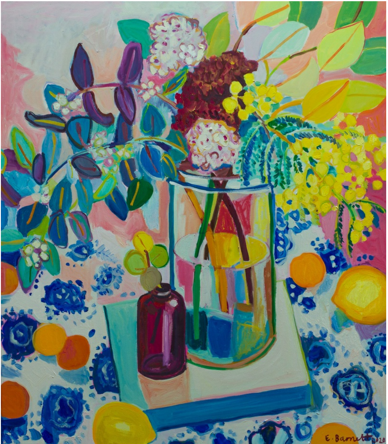
ELIZABETH BARNETT Morning Moment with the Garden , 2020 oil on linen 76 x 66cm $ 4,400