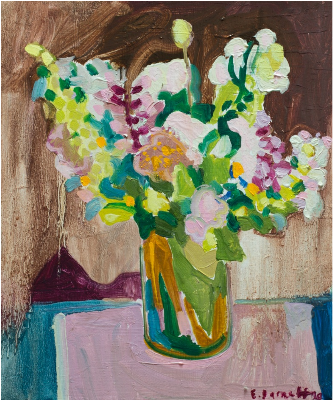
ELIZABETH BARNETT Summer Bouquet Study , 2020 oil on linen 31 x 26cm $ 1,300