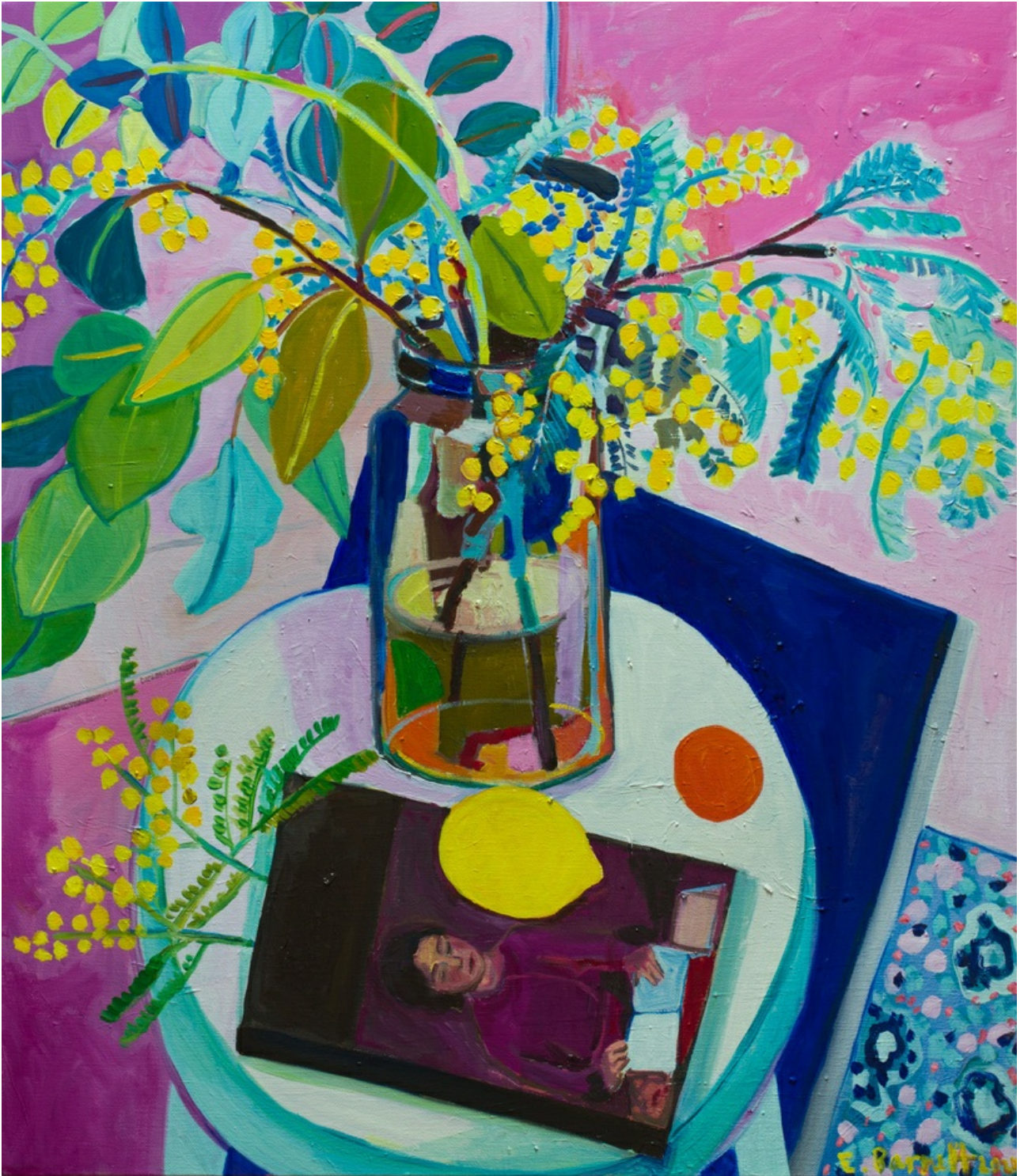
ELIZABETH BARNETT Keepsake , 2020 oil on linen 76 x 66cm $ 4,400