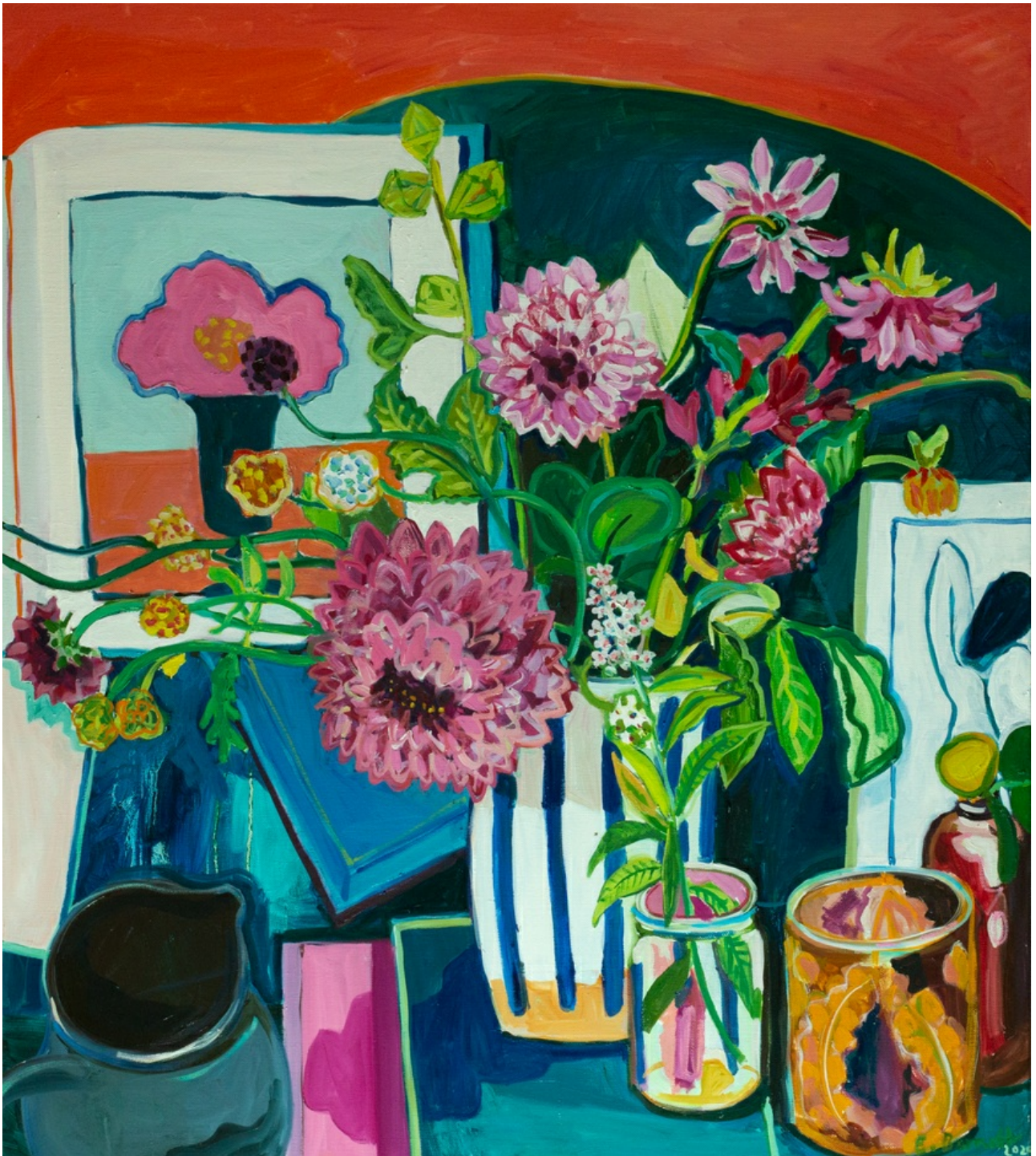
ELIZABETH BARNETT The Golden Dawn , 2020 oil on linen 92 x 81.5cm $ 4,900