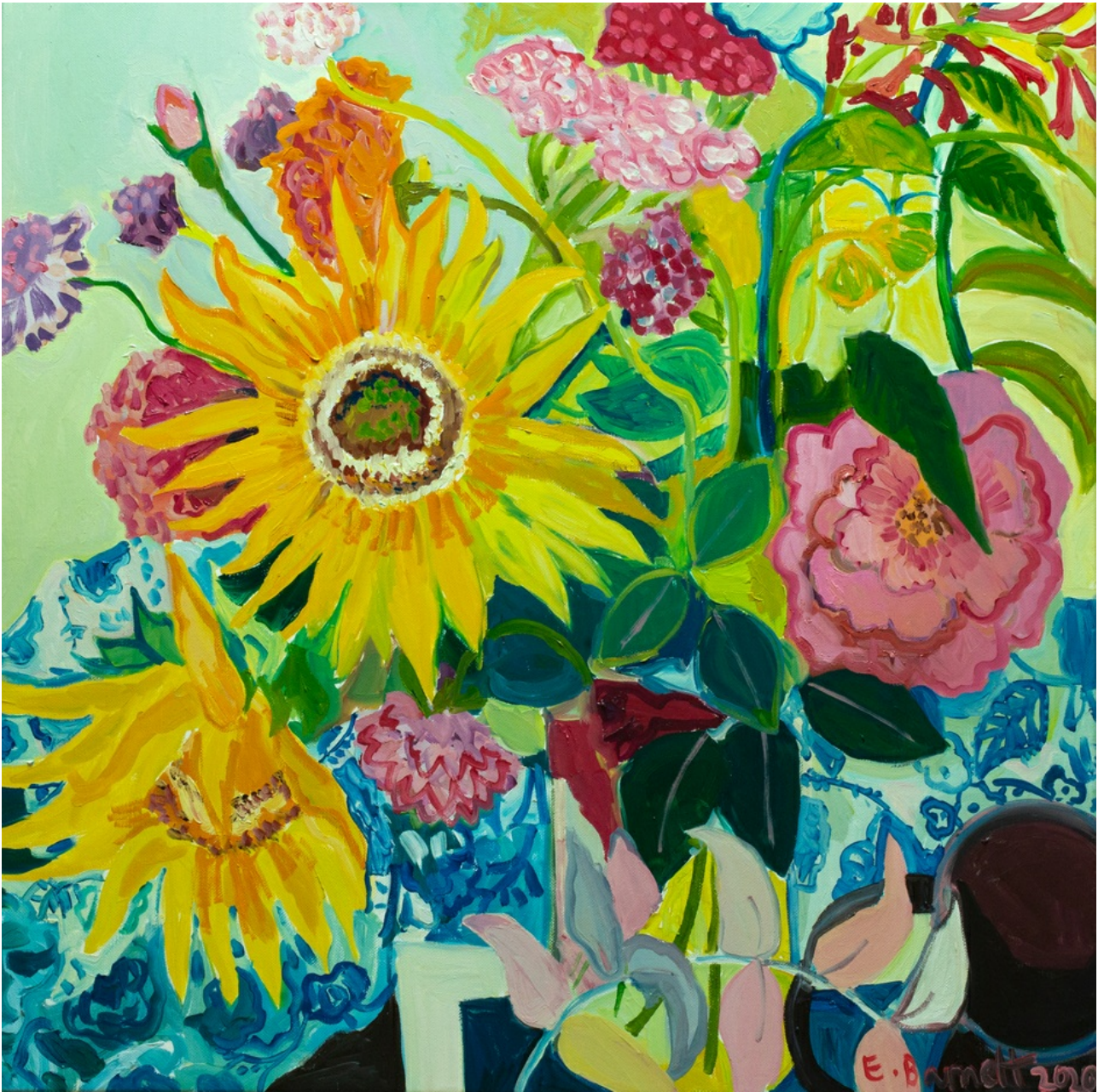
ELIZABETH BARNETT Everything Summer , 2020 oil on linen 71 x 71cm $ 4,400