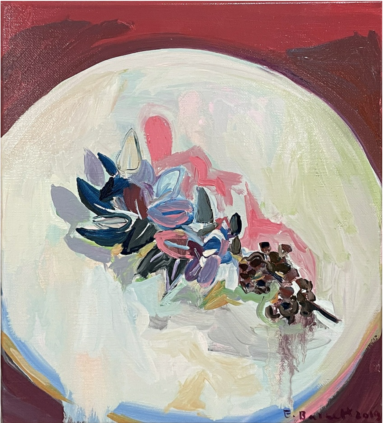
ELIZABETH BARNETT Full moon in the ranges , 2020 oil on linen 36 x 31cm $ 1,600