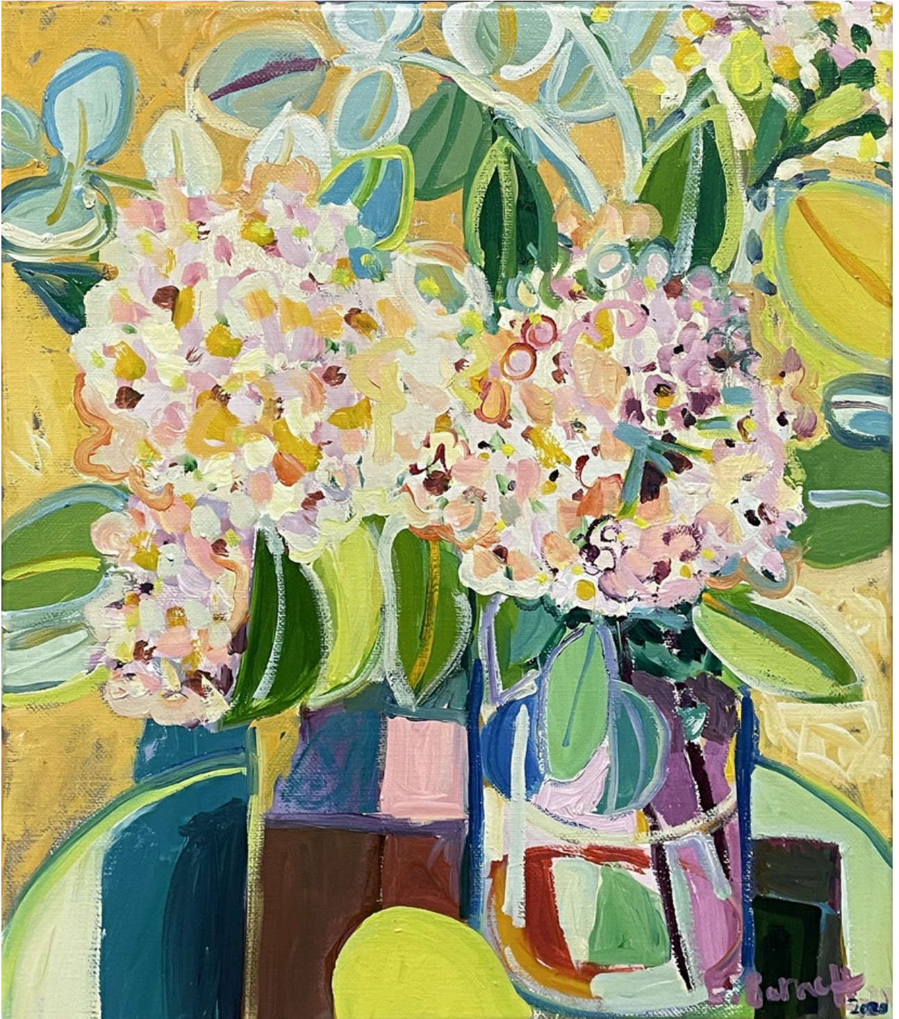
ELIZABETH BARNETT The Gardener , 2020 oil on linen 41 x 36cm $ 2,800