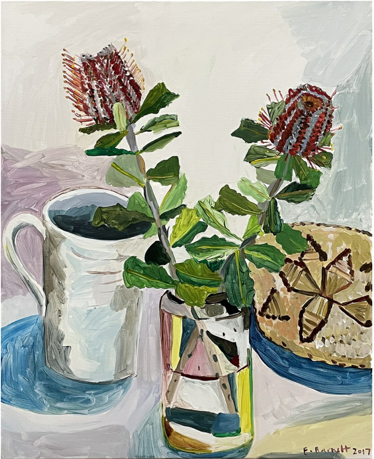
ELIZABETH BARNETT Two Banksias and a White Jug , 2017 oil on linen 72 x 67cm $ 4,100