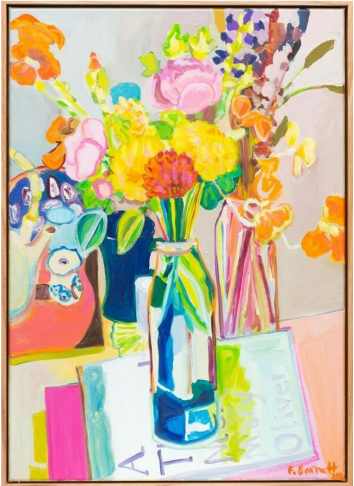
ELIZABETH BARNETT A Thousand Mornings II , 2021 oil on linen 71 x 51cm $ 4,000