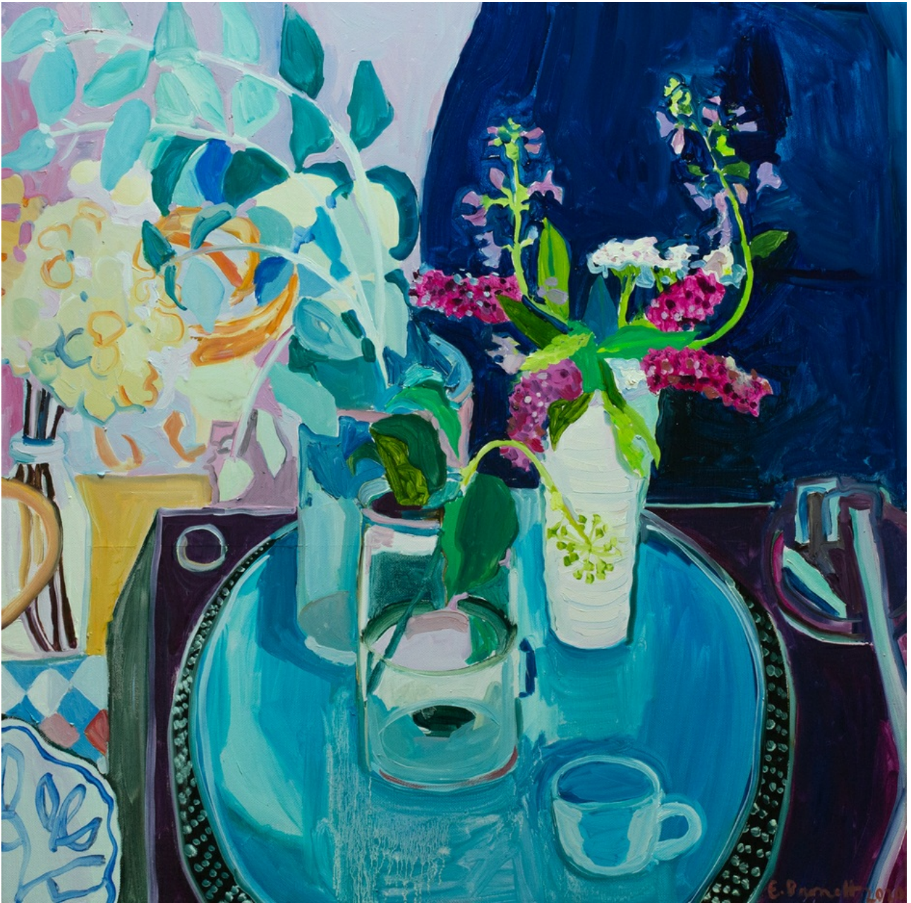
ELIZABETH BARNETT Spin Around the Sun , 2020 oil on linen 71 x 71cm $ 4,400