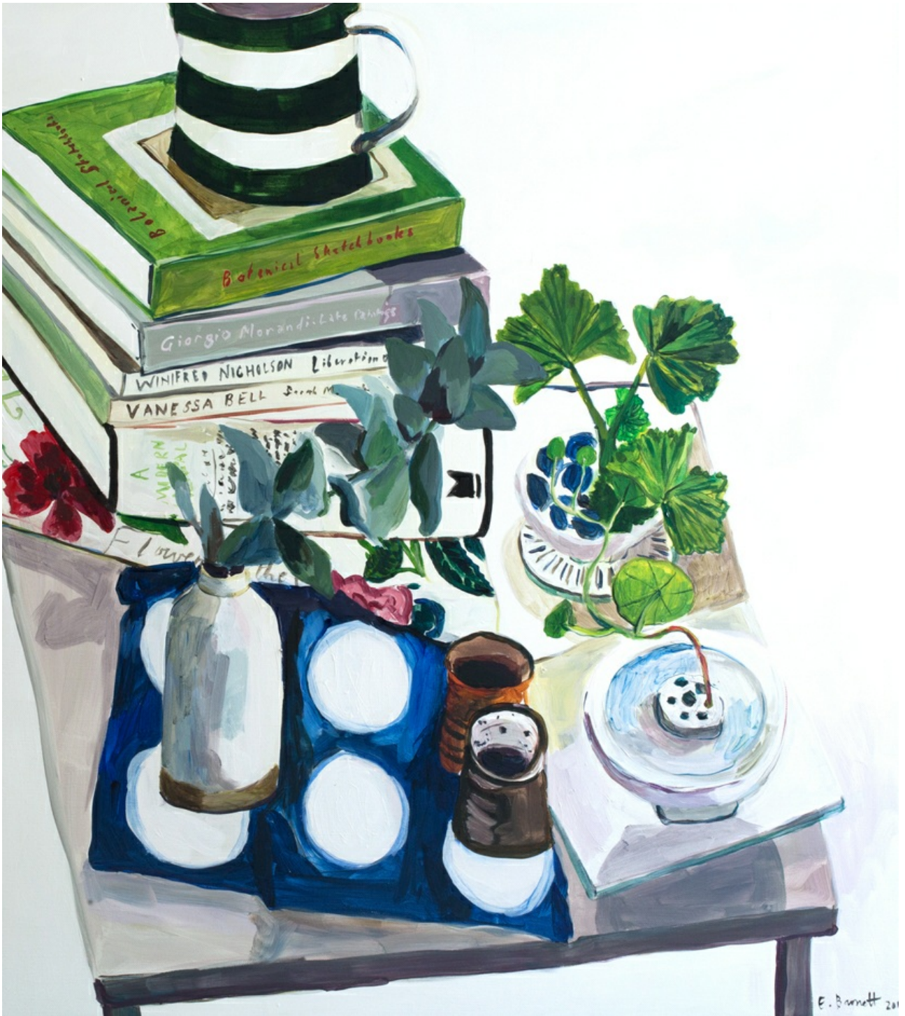
ELIZABETH BARNETT The Beginning of Spring , 2017 oil on linen 92 x 82cm $ 4,900