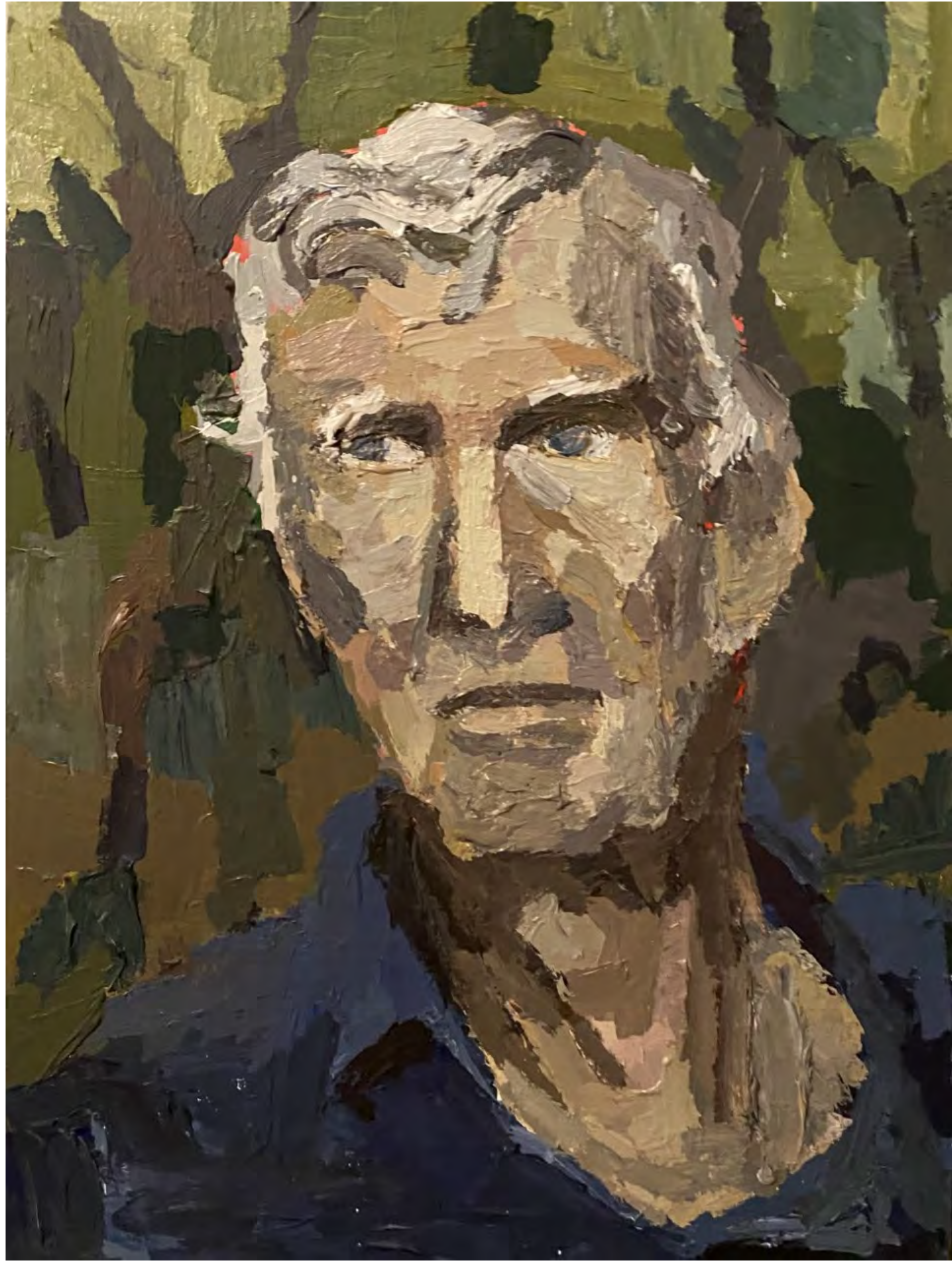
Study of David Williamson 2020 Acrylic on Marine Ply 20 x 30 cm $6,000.00