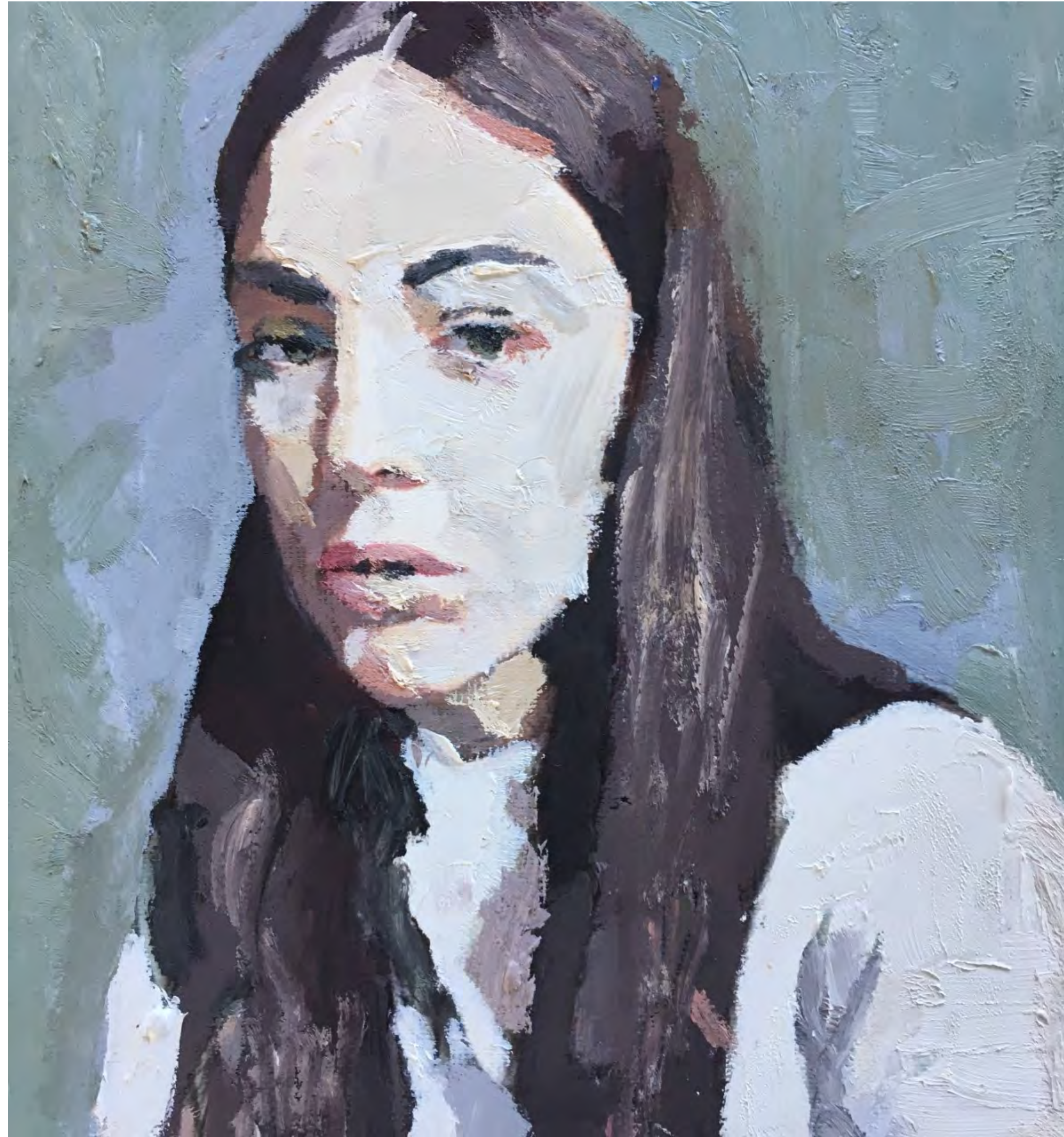
Filtered Selfie 2019 Acrylic on Canvas 25 x 15cm $3,500.00