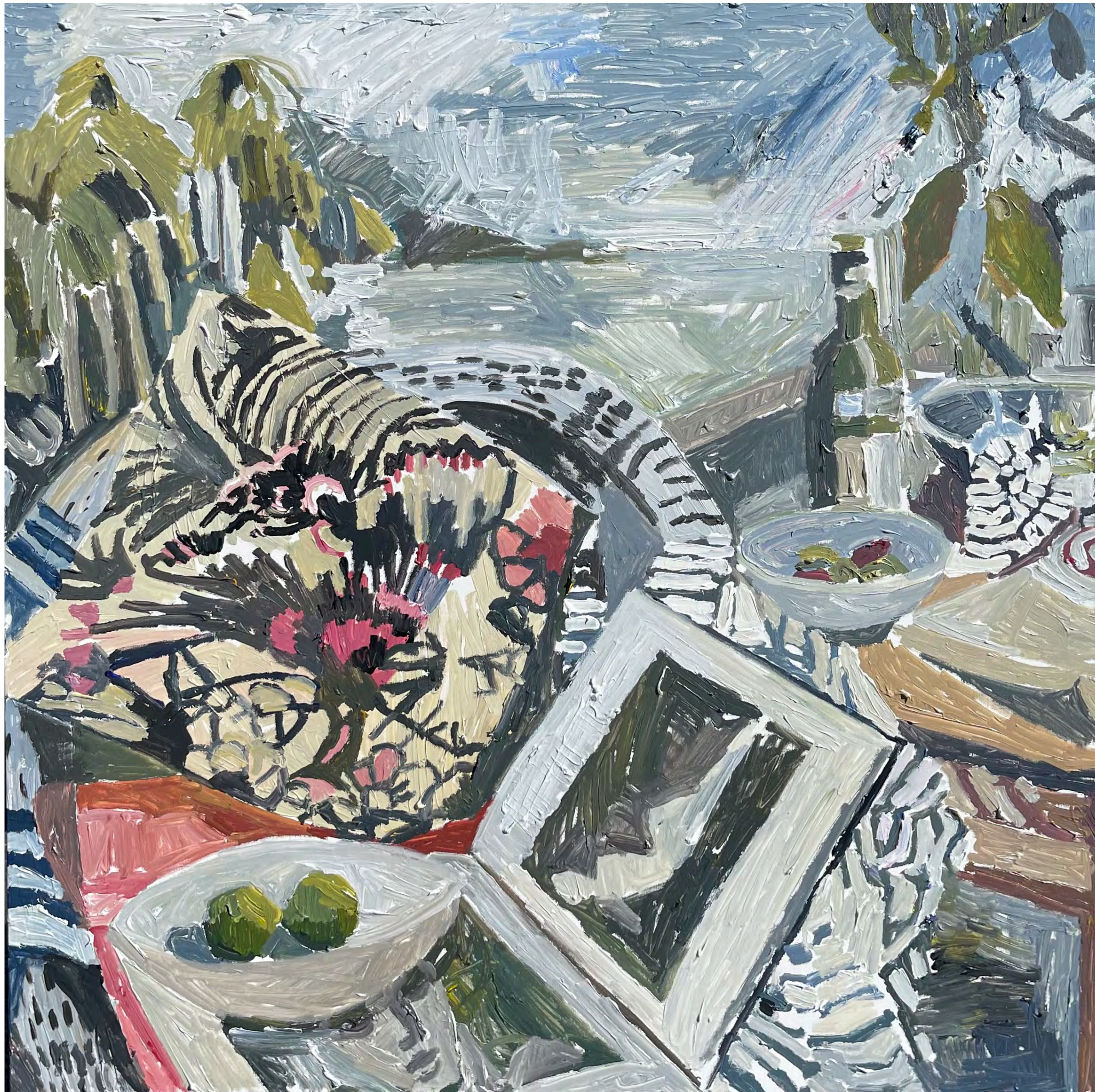
Preston + Pernod at The Pacific Club 2021 90 x 90 Acrylic on Belgian Linen $12,000.00