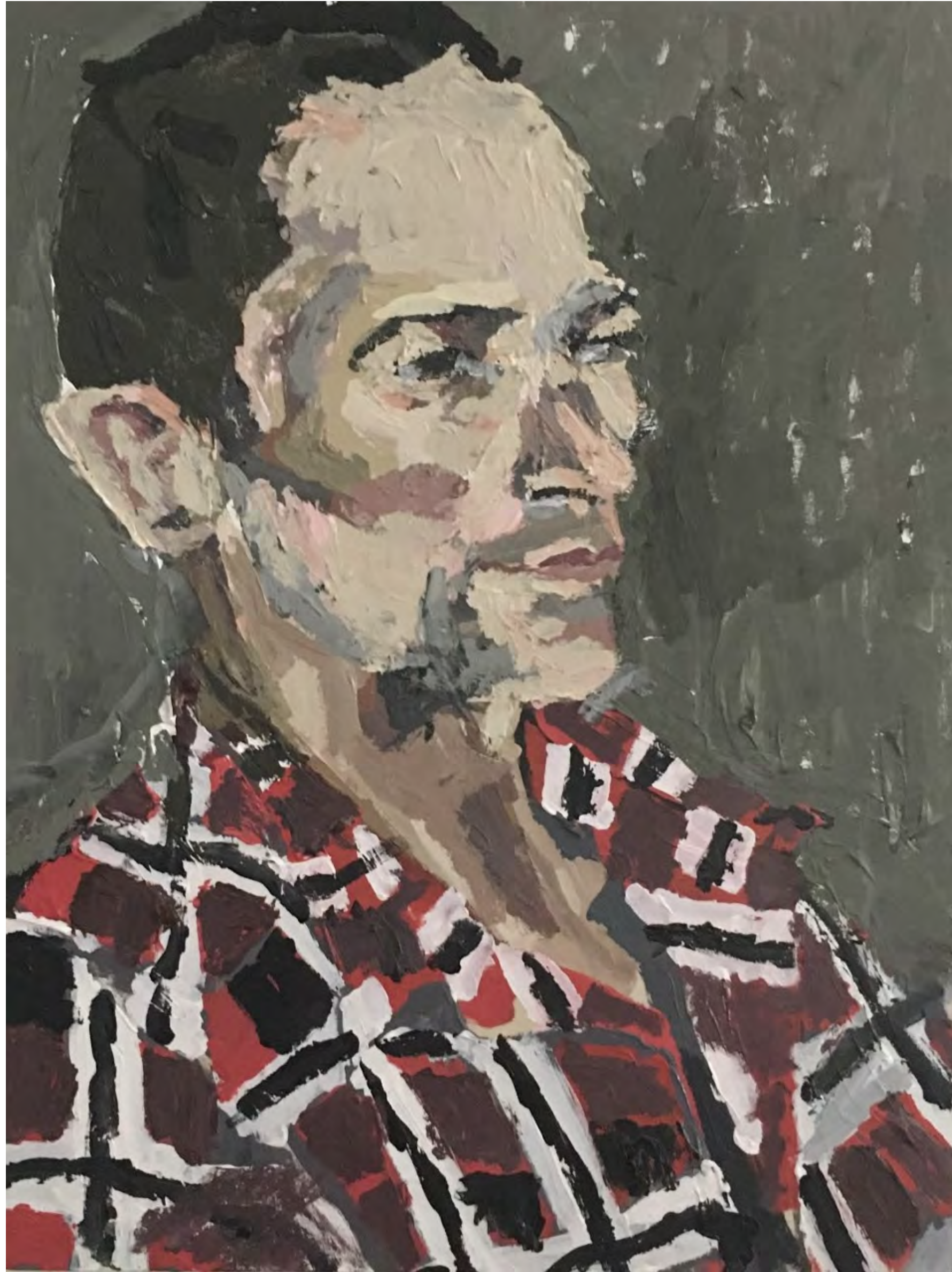
The Writer, Andrew McGahan 2018 Acrylic on Birchwood 30 x 40 cm NFS