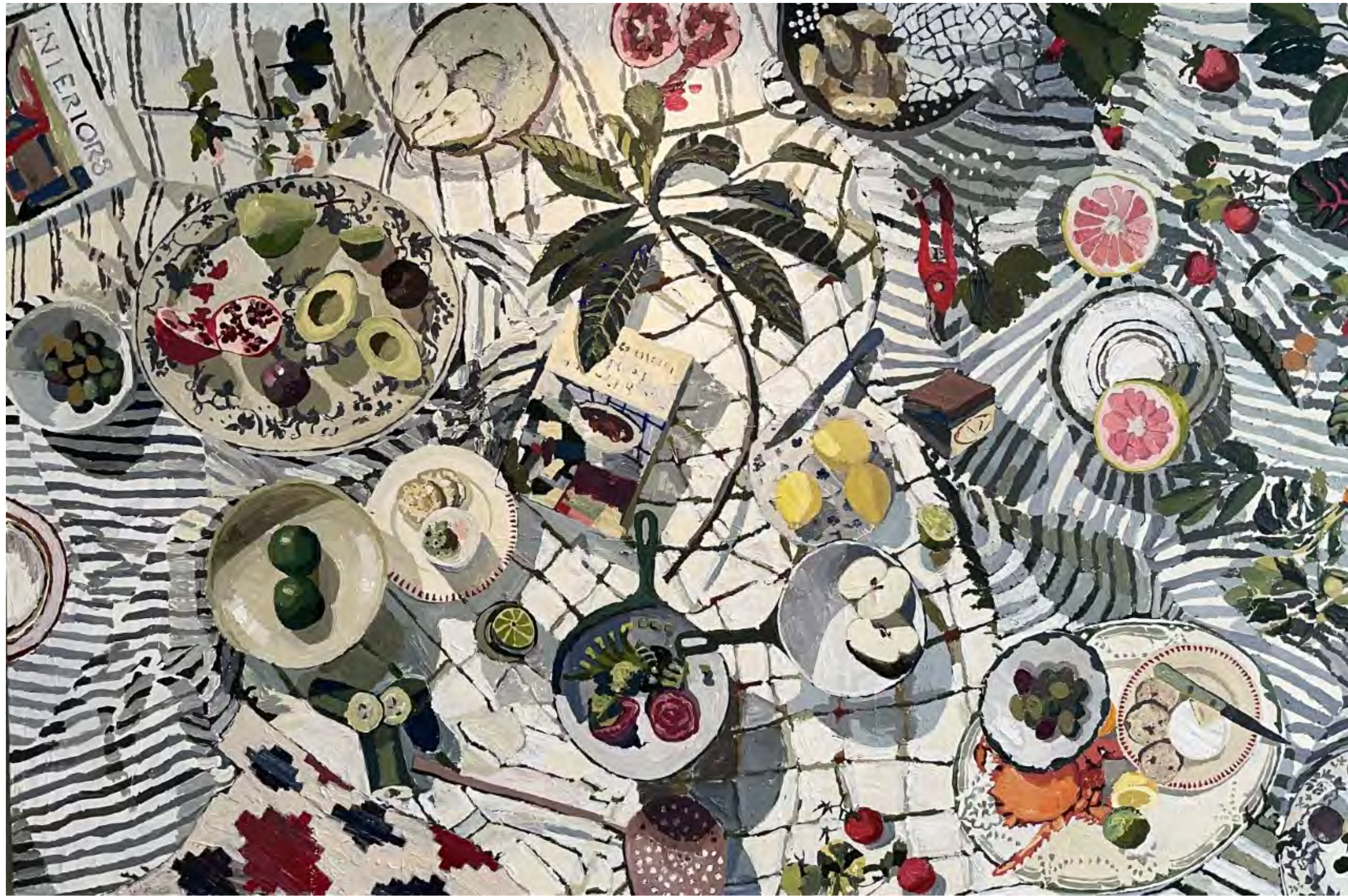
Picnic by the Weir 2021 Acrylic on Belgian linen 260 x 140cm NFS