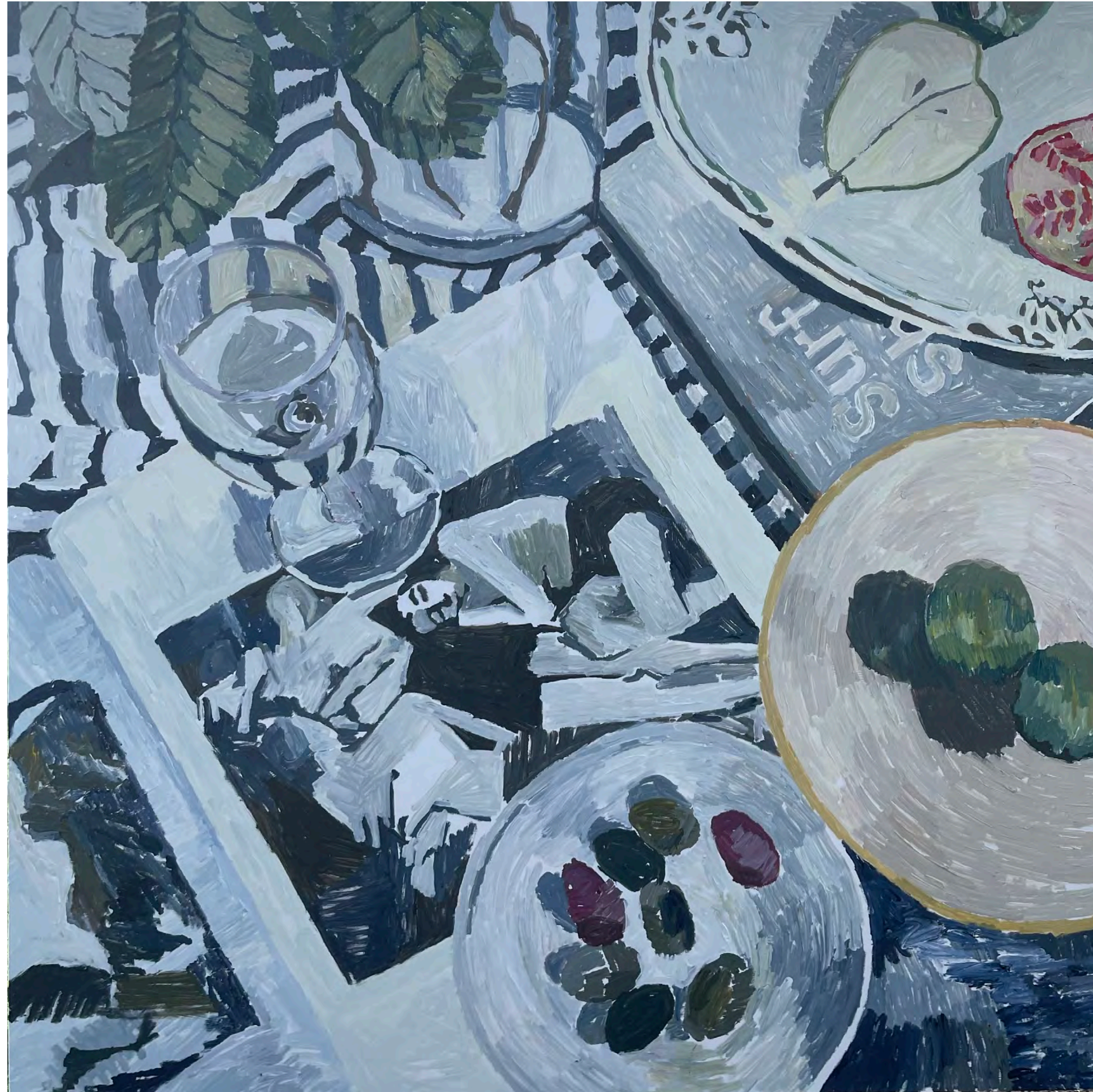
Chablis, Olives + Surf Shack (study of study) 2021 Acrylic on Belgian Linen 150 x 150 cm $18,000.00