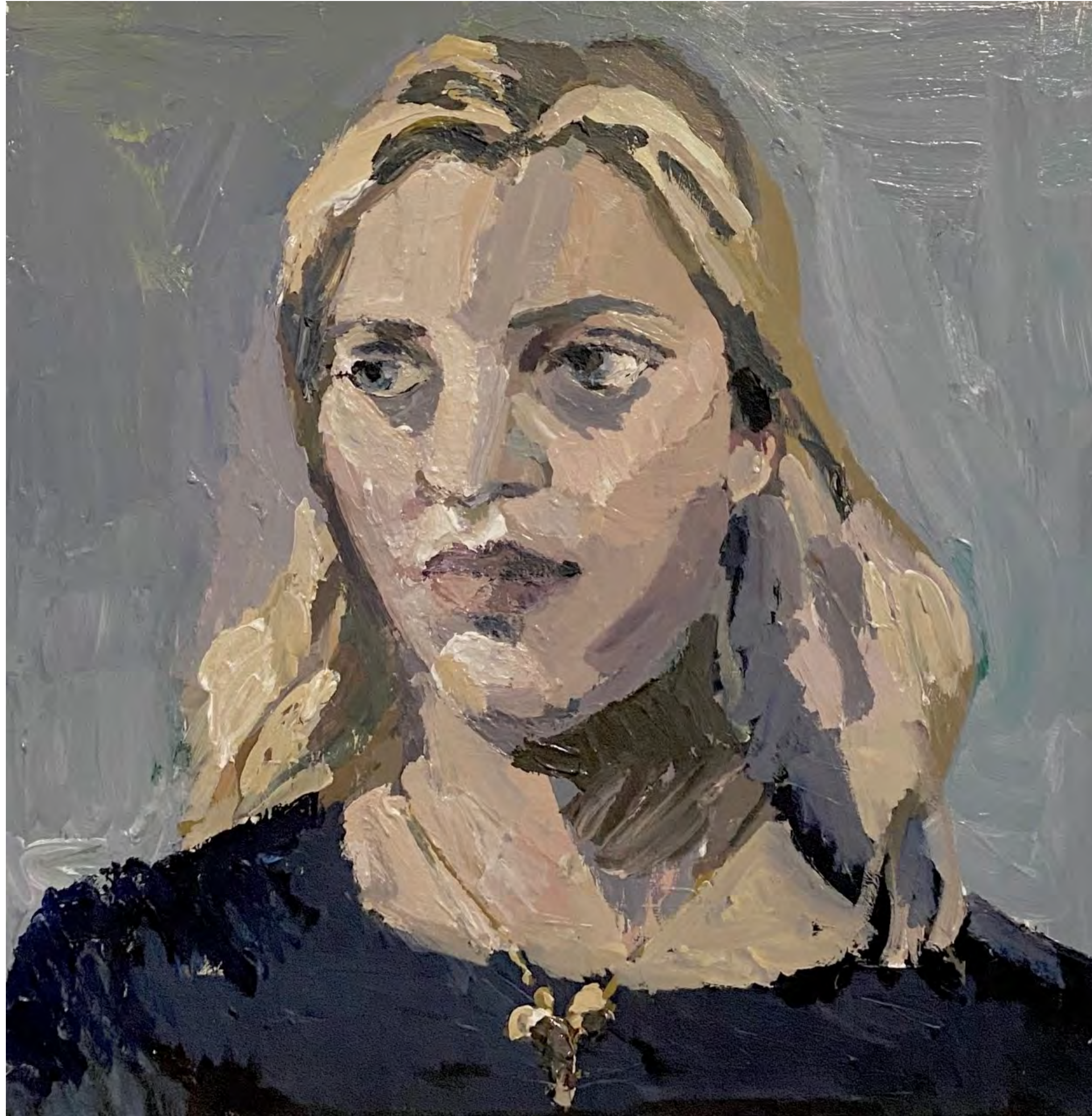
Henrietta 2021 Acrylic on Birchwood 40 x 40 cm NFS