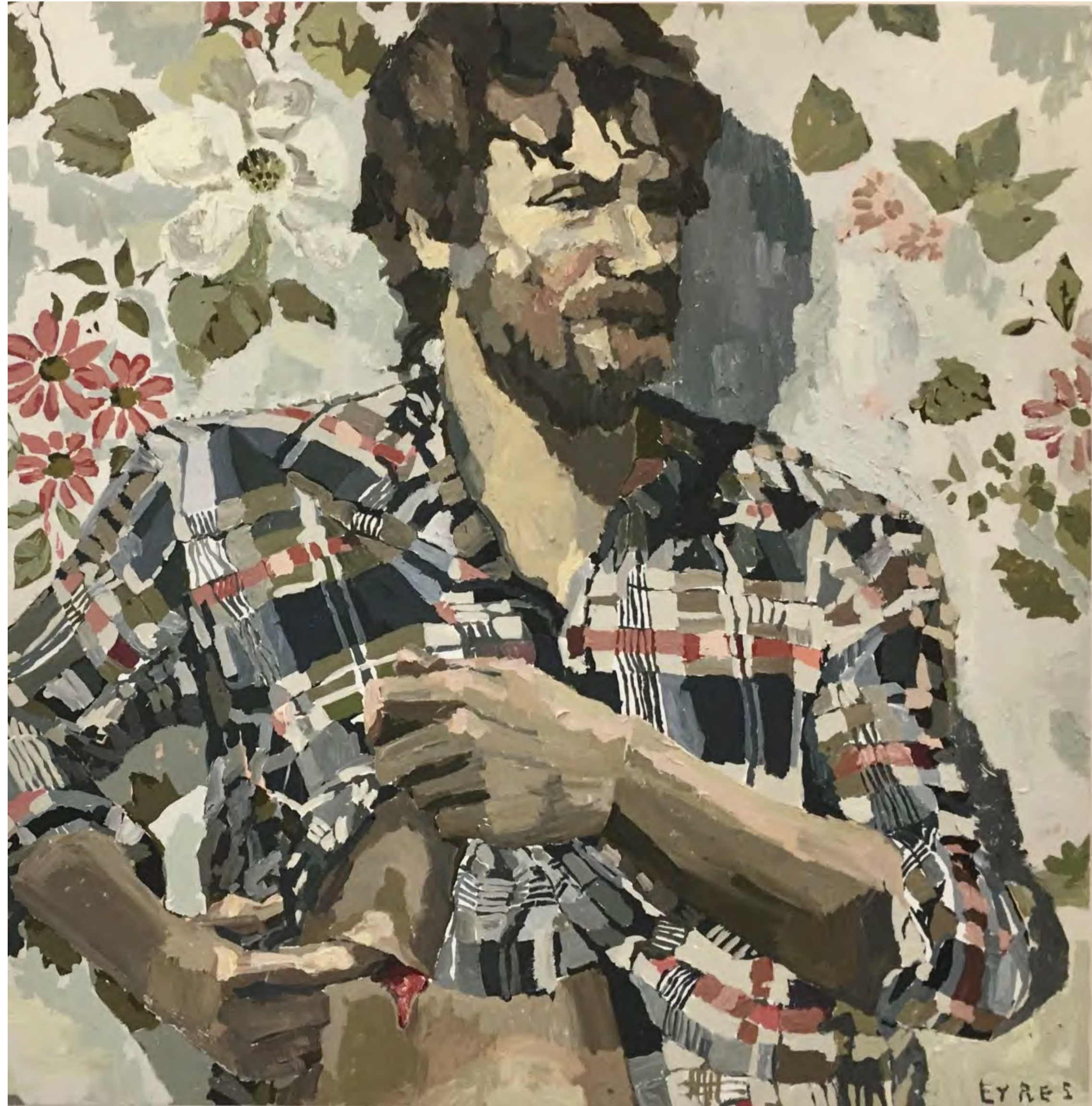
The Benefit of The Doubt, after Caravaggio 2020 Acrylic on Belgian Linen 150 x 150 cm $18,000.00