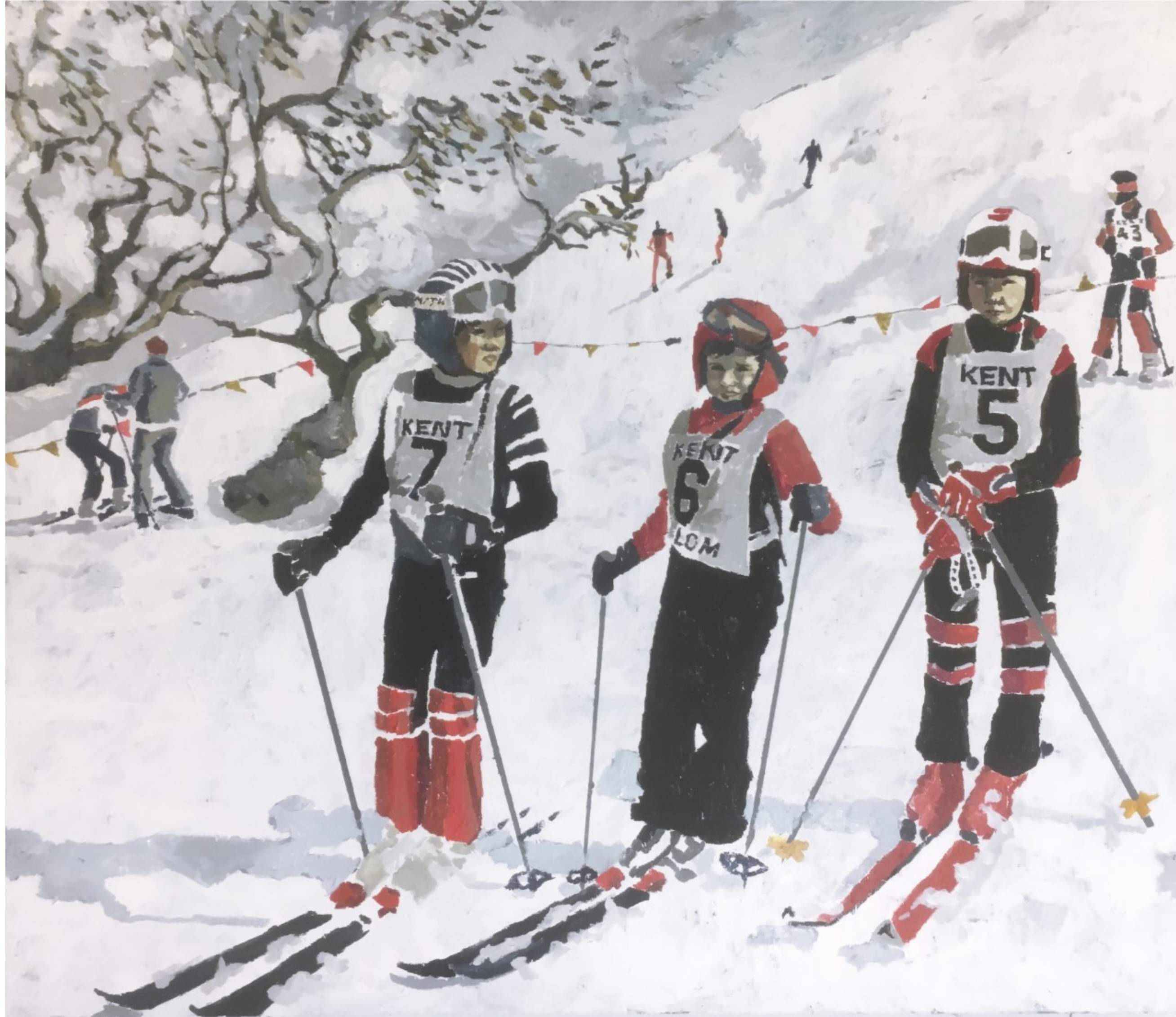
Winter Soundtrack Great Southern Land 2018 Acrylic on Belgian Linen 120 x 140 cm NFS