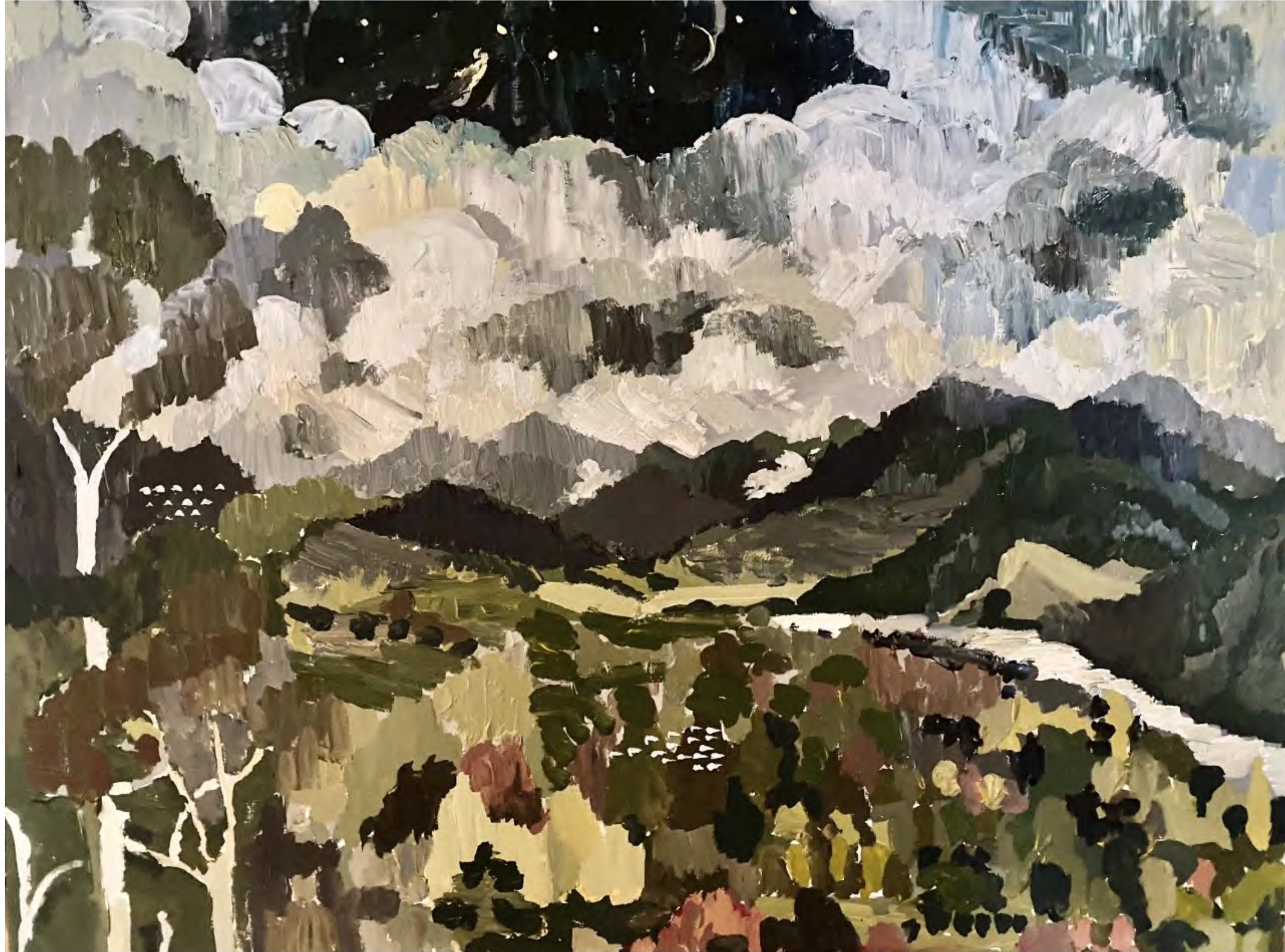
The Day The Duke Died 2021 Acrylic on Birchwood 42 x 60 cm $5,500.00