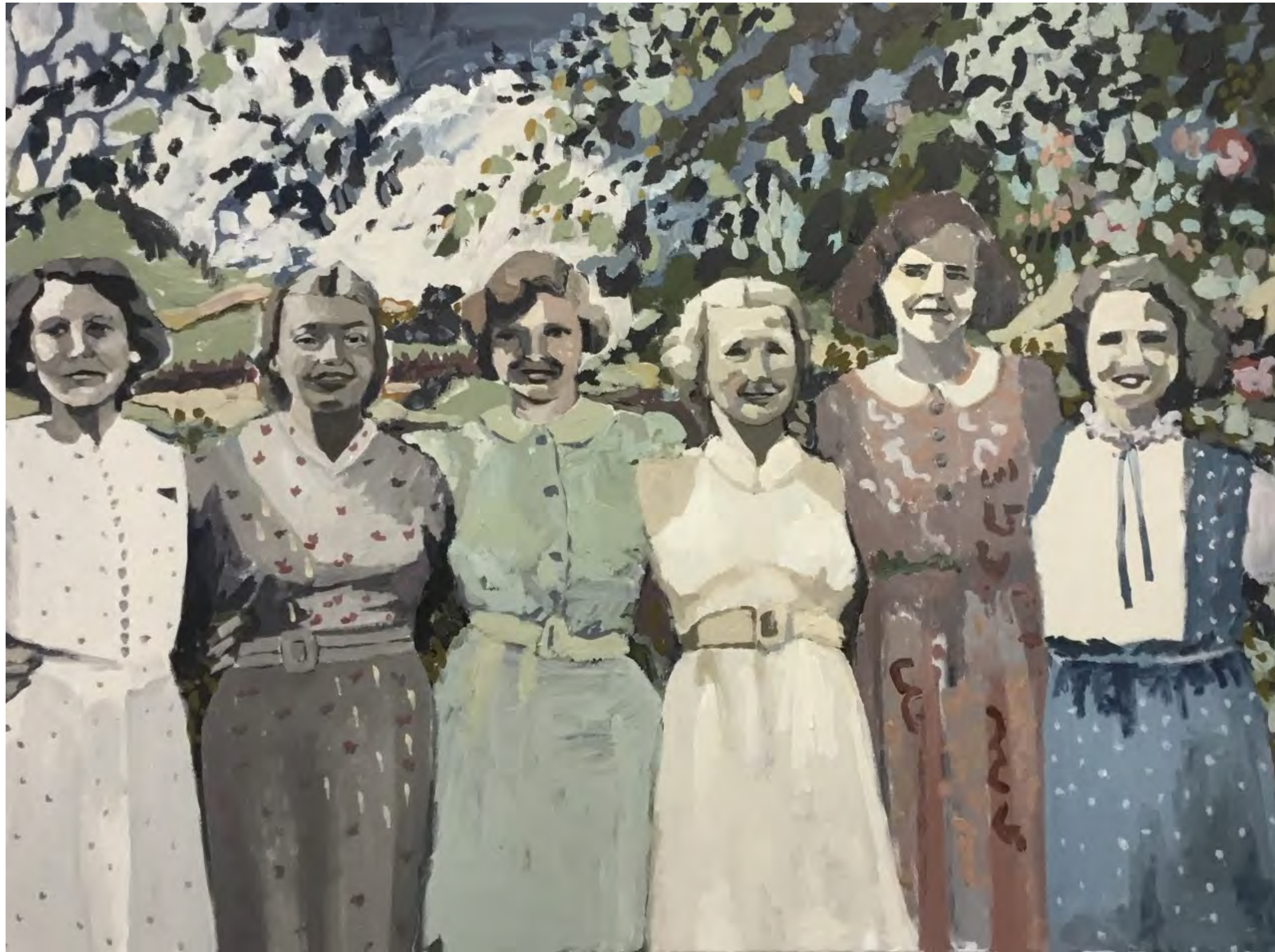
Girls 2014 Acrylic on Canvas 120 x 90cm $10,500.00