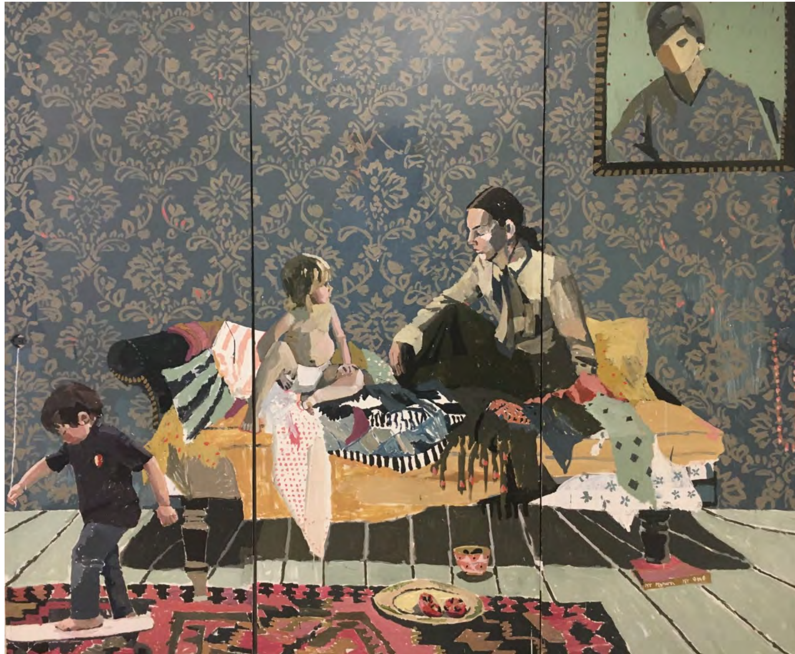
My Mother, My Self 2015 Acrylic on Recycled Doors 270 x 210 cm $28,000.00