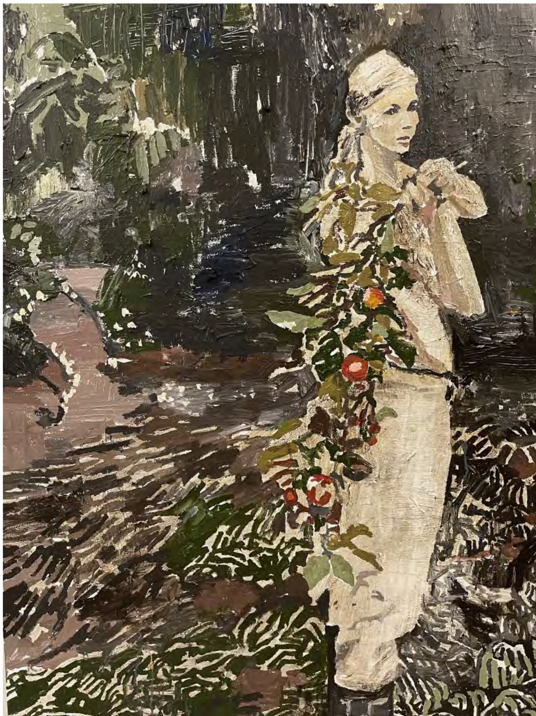
Foraging by the Weir 2021 Acrylic on Belgian linen 90 x 120 cm $10,500.00