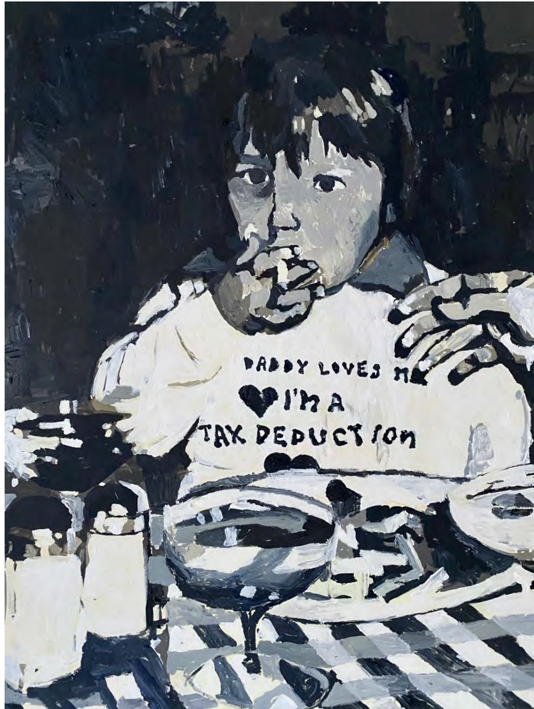
Henri 75 2020 Acrylic on Belgian Linen 129 x 160 cm $16,000.00