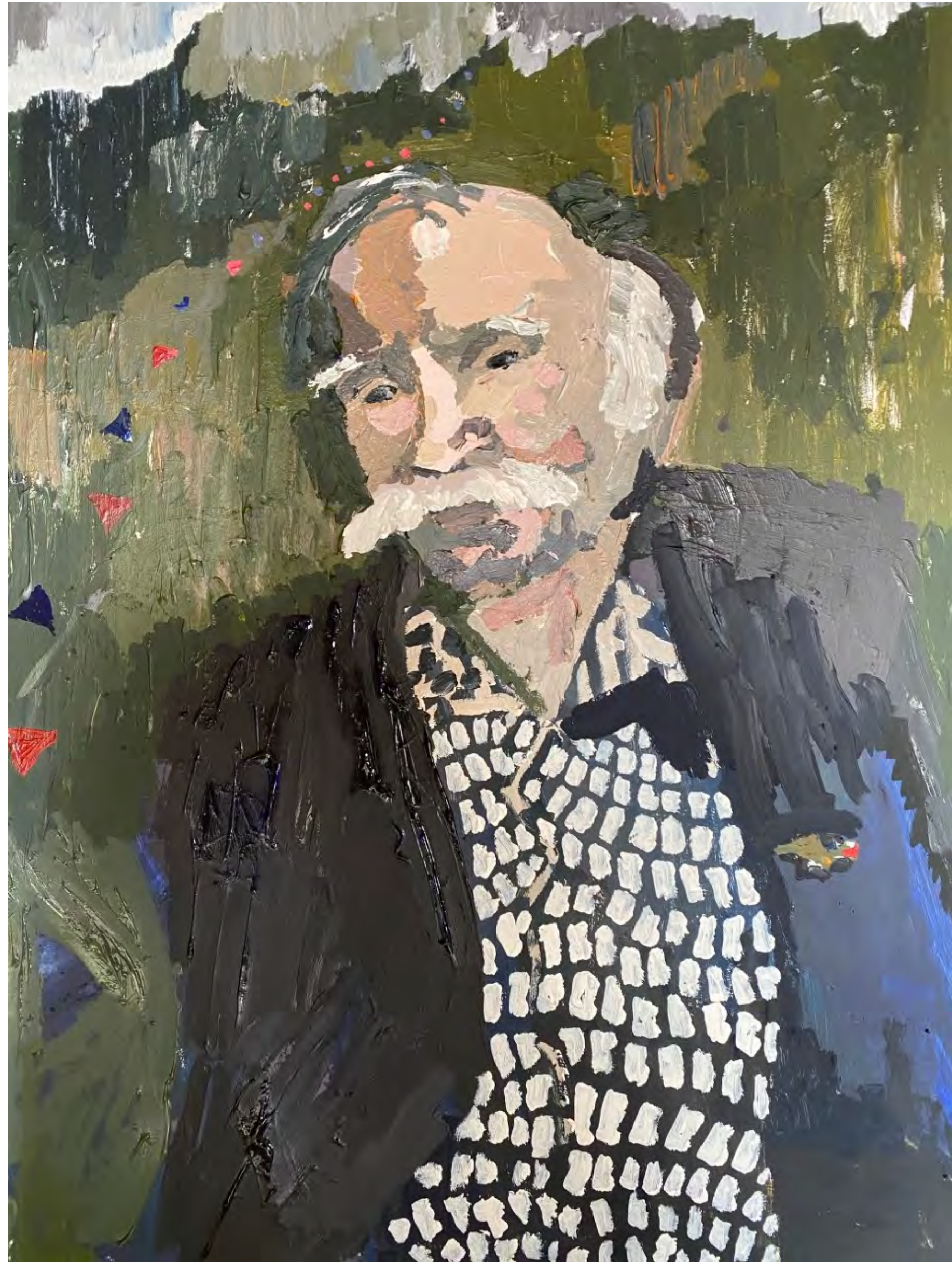
Frank Pihoda 2021 Acrylic on Birchwood 45 x 60cm $6,500.00