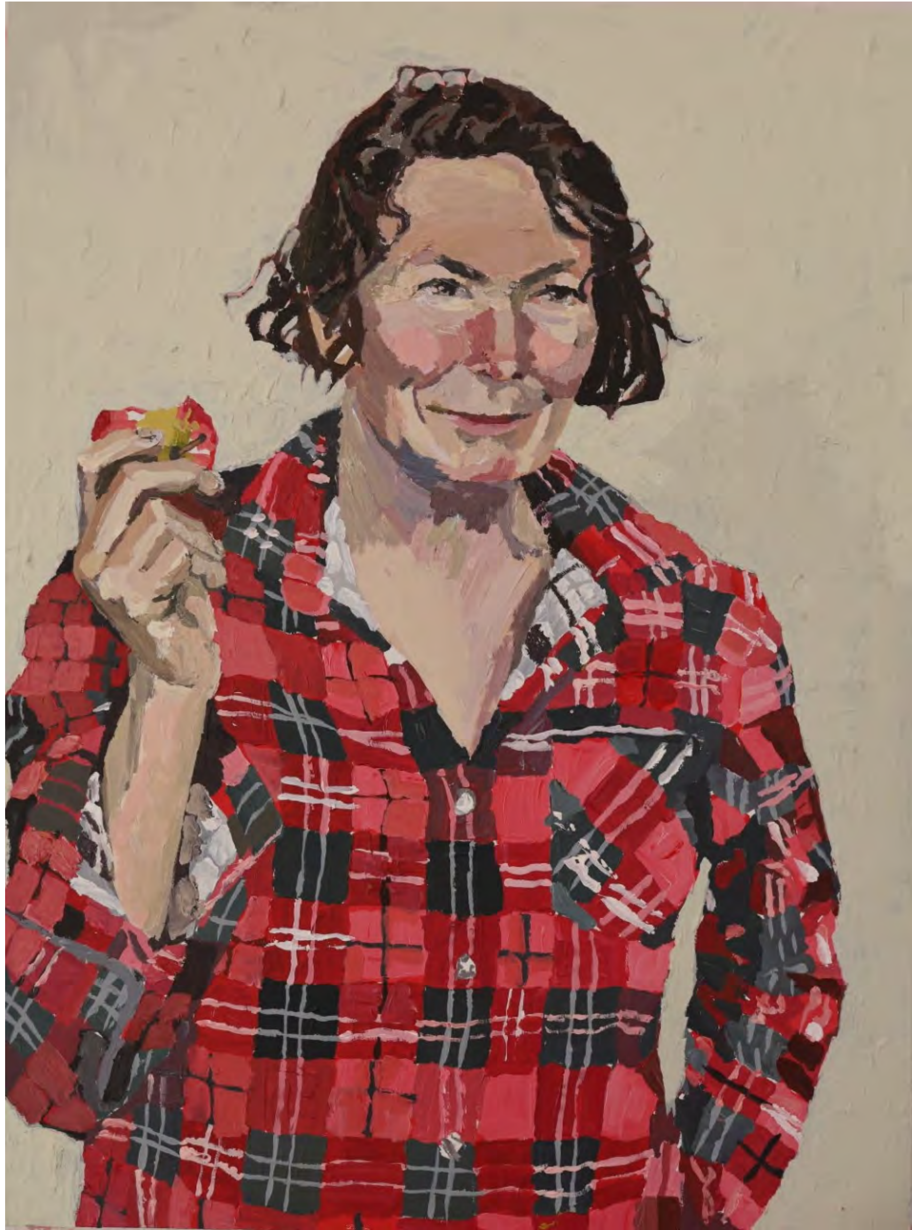
Lucy Eating an Apple 2020 Acrylic on Birchwood 60 x 40 cm $6,500.00