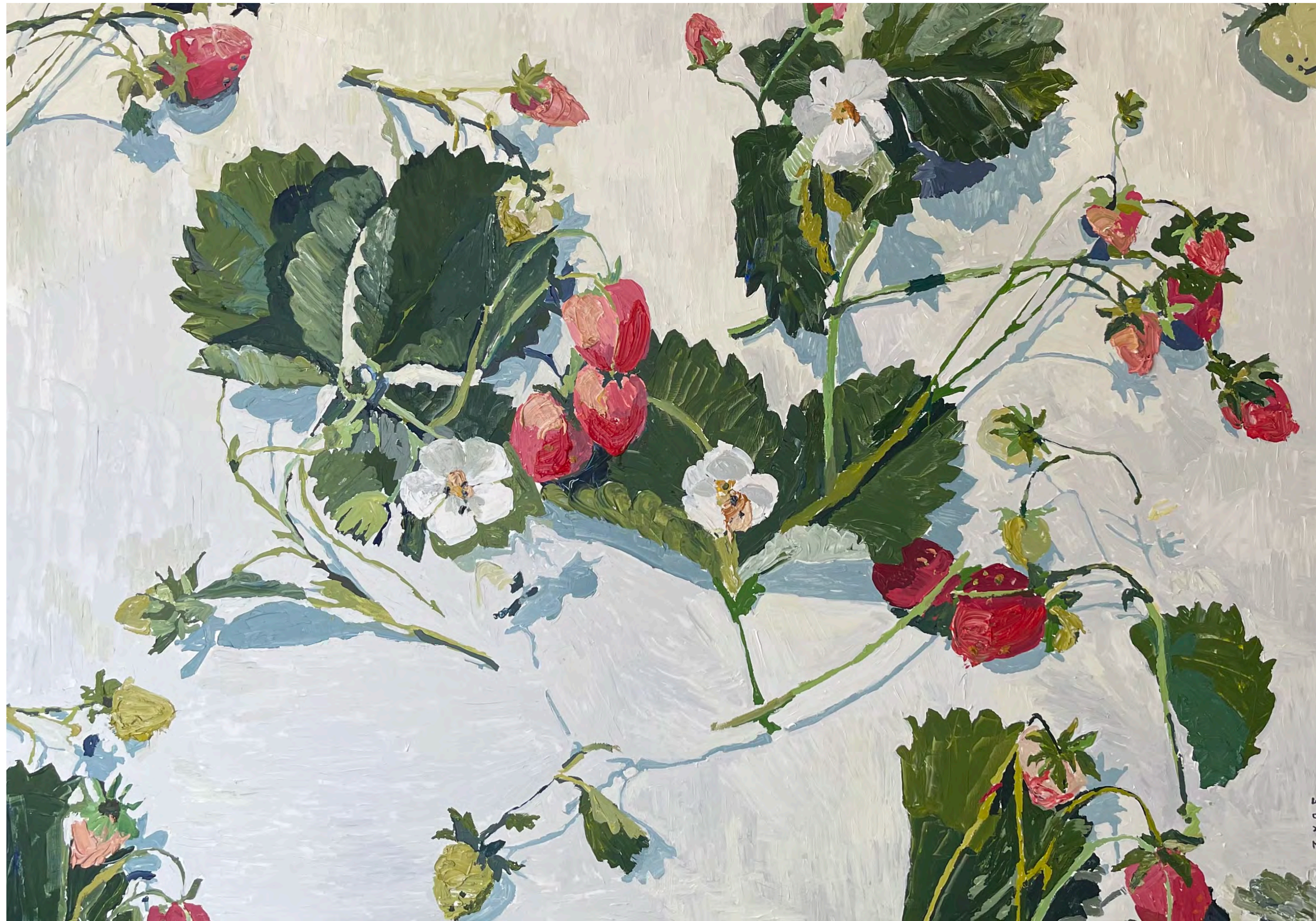
Champagne Gathering 2021 Acrylic on Belgian Linen 240 x 160 cm $30,000.00