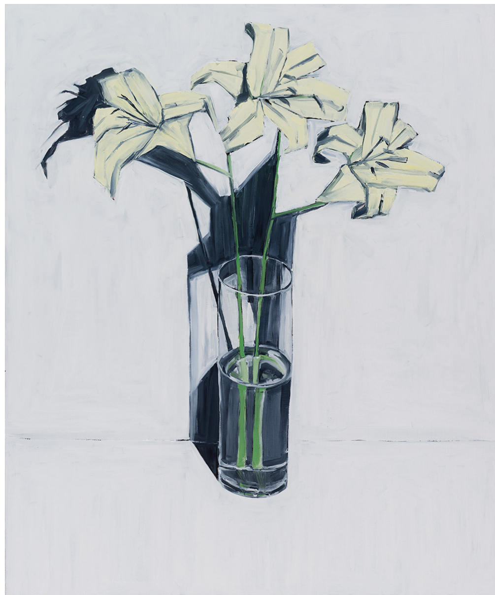
Impervious, 2020 Oil on aluminium in powder-coated steel frame, 75 x 90cm Price (inc GST): $5,500