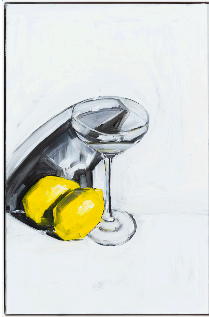
Warpaint, 2021 Oil on aluminium in powder-coated steel frame, 45 x 30cm Price (inc GST): $2,200