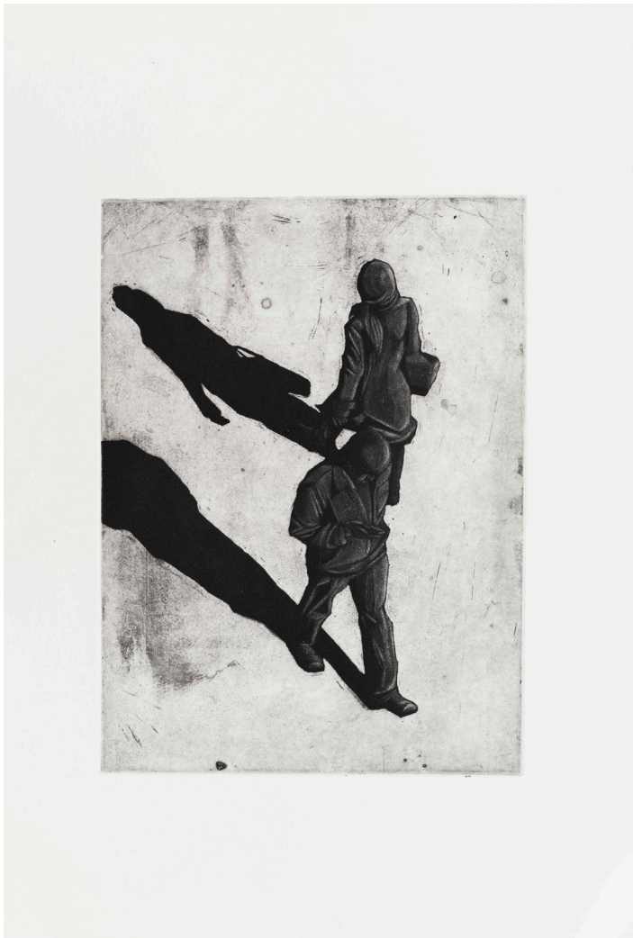
In Passing II, 2020 Copper plate etching, aquatint on paper, 21 x 28cm (plate size), printer proof Price (inc GST): $1,300