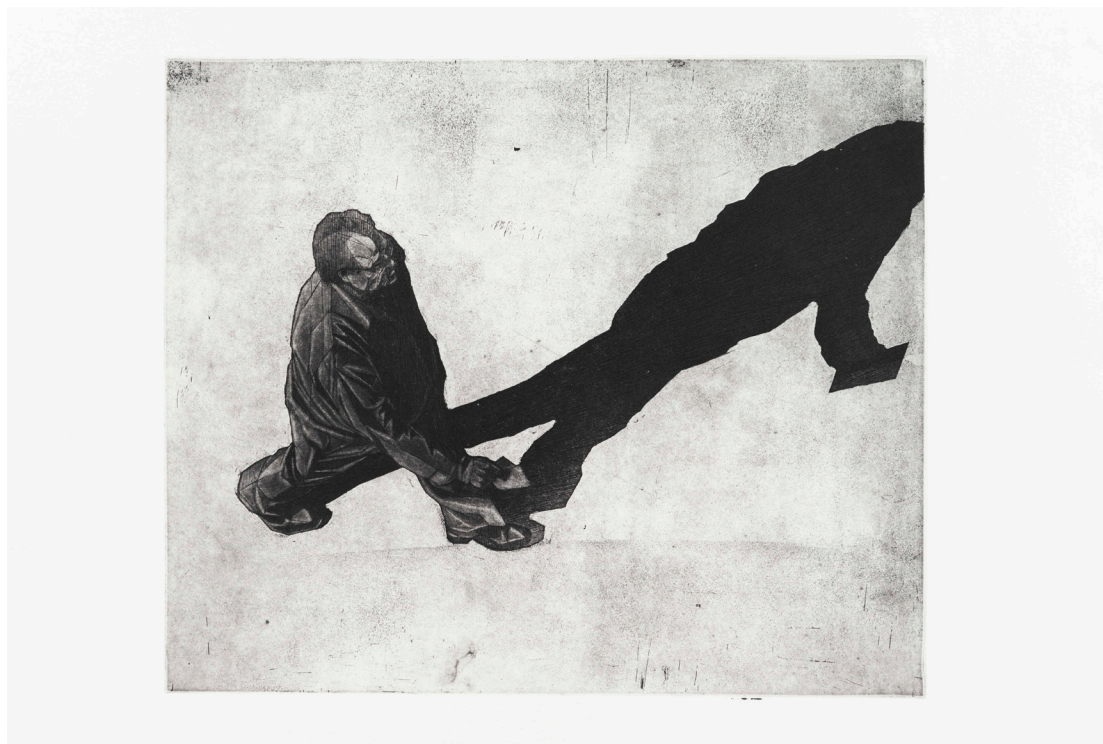
Urgent Delivery, 2020 Copper plate etching, aquatint on paper, 34 x 29cm (plate size), printer proof Price (inc GST): $1,400