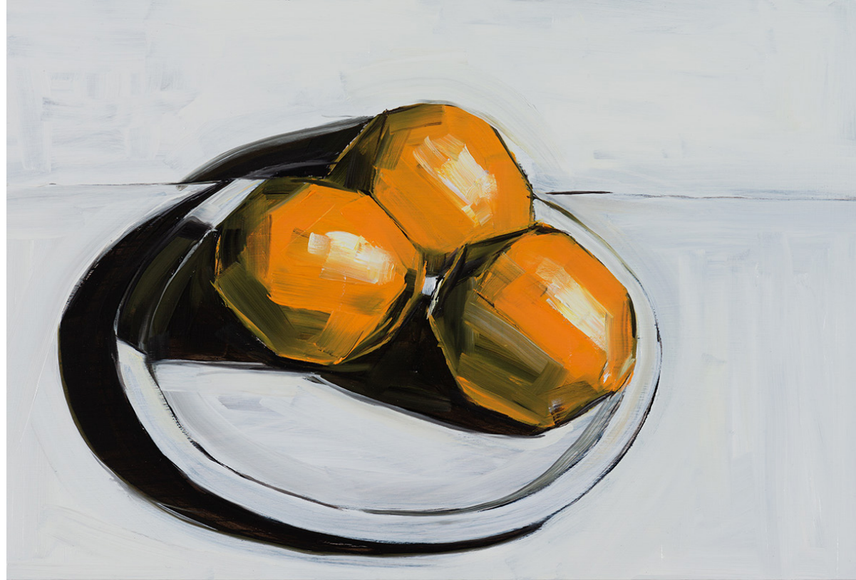
No Filter (Filter) , 2020 Oil on aluminium in powder-coated steel frame, 45 x 30cm Price (inc GST): $2,200