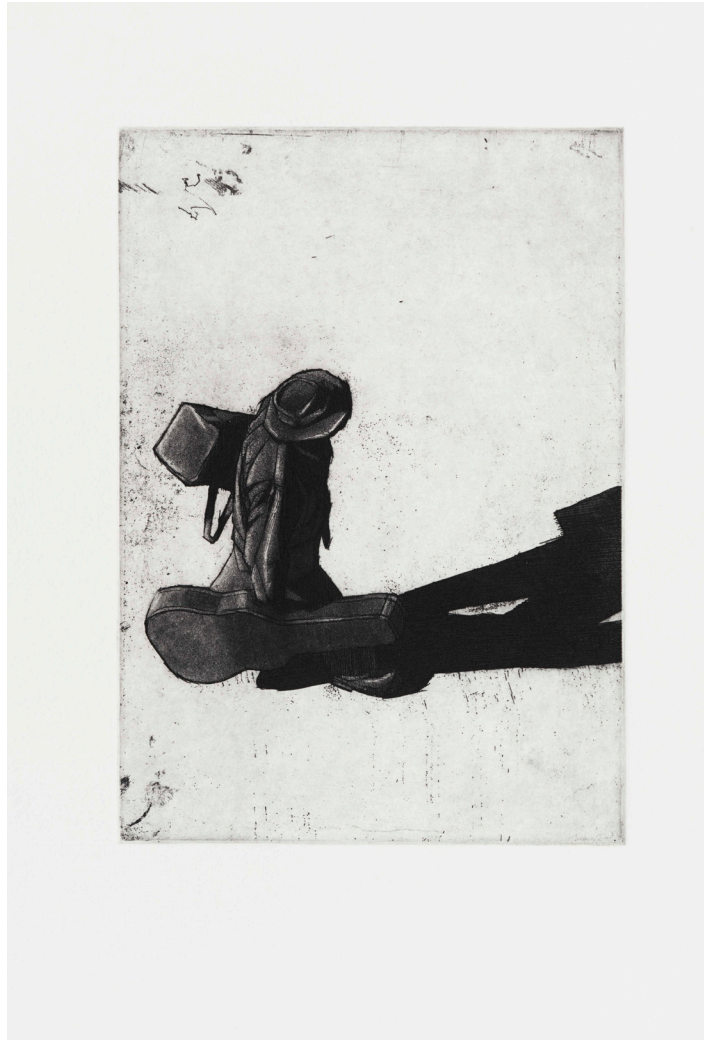
Moving On, 2020 Copper plate etching, aquatint on paper, 18 x 25cm (plate size), printer proof Price (inc GST): $1,200