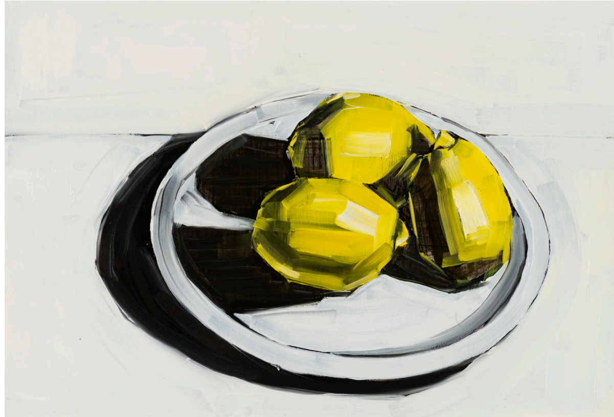
Support Network , 2020 Oil on aluminium in powder-coated steel frame, 45 x 30cm Price (inc GST): $2,200