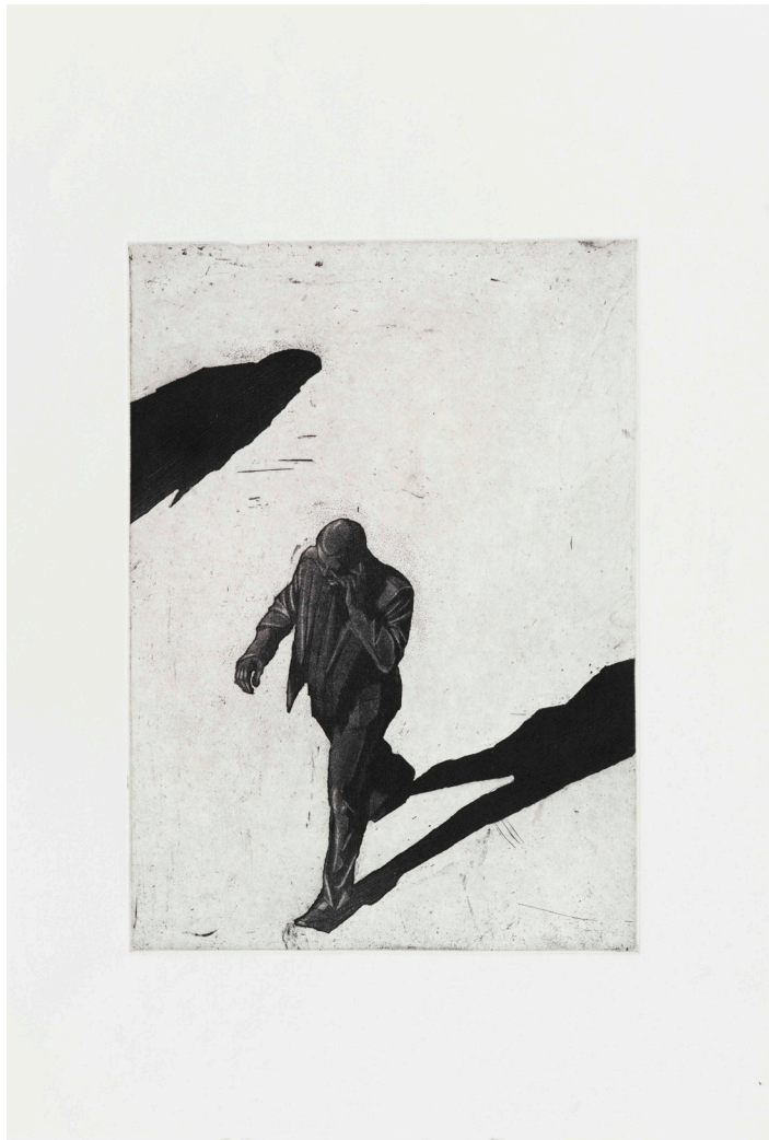
I'll be there in 5, 2020 Copper plate etching, aquatint on paper, 21 x 28cm (plate size), printer proof Price (inc GST): $1,300