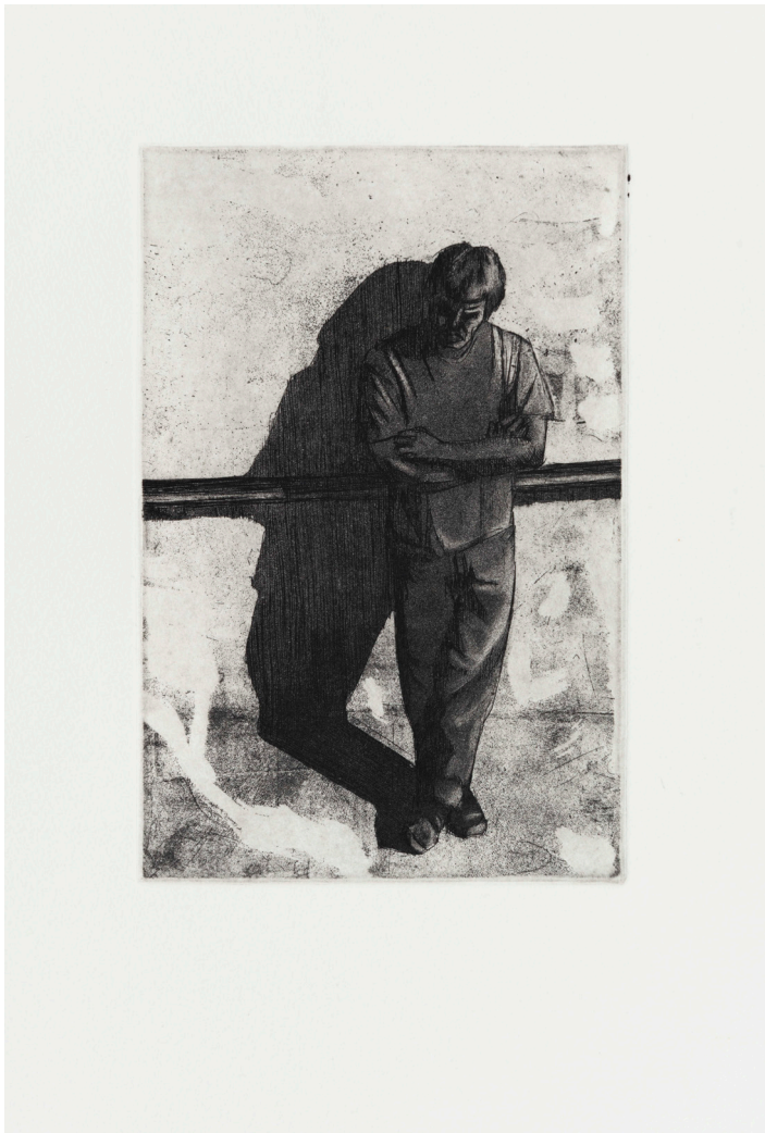
Down on his Luck, 2020 Copper plate etching, aquatint on paper, 13 x 20cm (plate size), printer proof Price (inc GST): $1,000