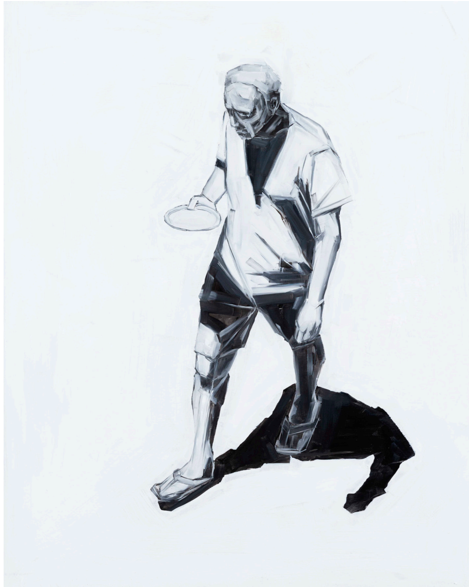
Days are Nights, 2021 Oil on aluminium in powder-coated steel frame, 60 x 75cm Price (inc GST): $3,800