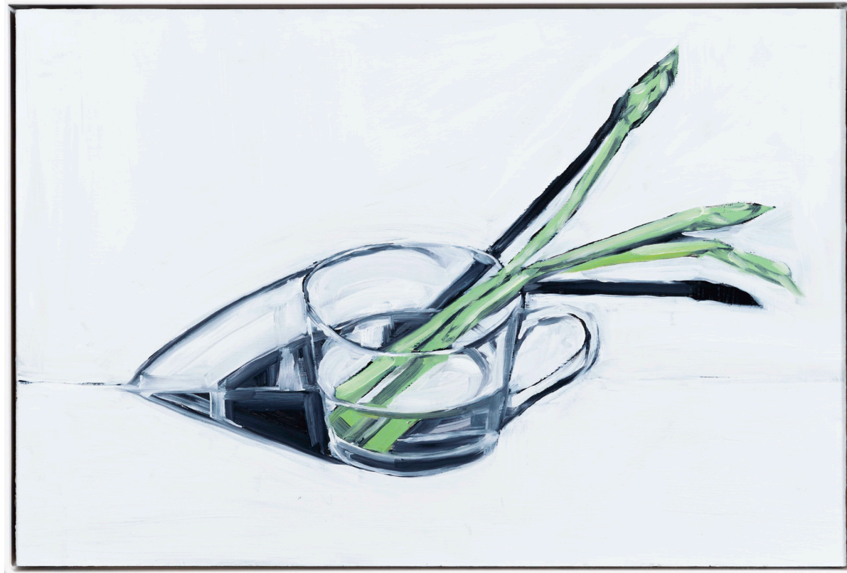
Laying Bricks, 2021 Oil on aluminium in powder-coated steel frame, 45 x 30cm Price (inc GST): $2,200