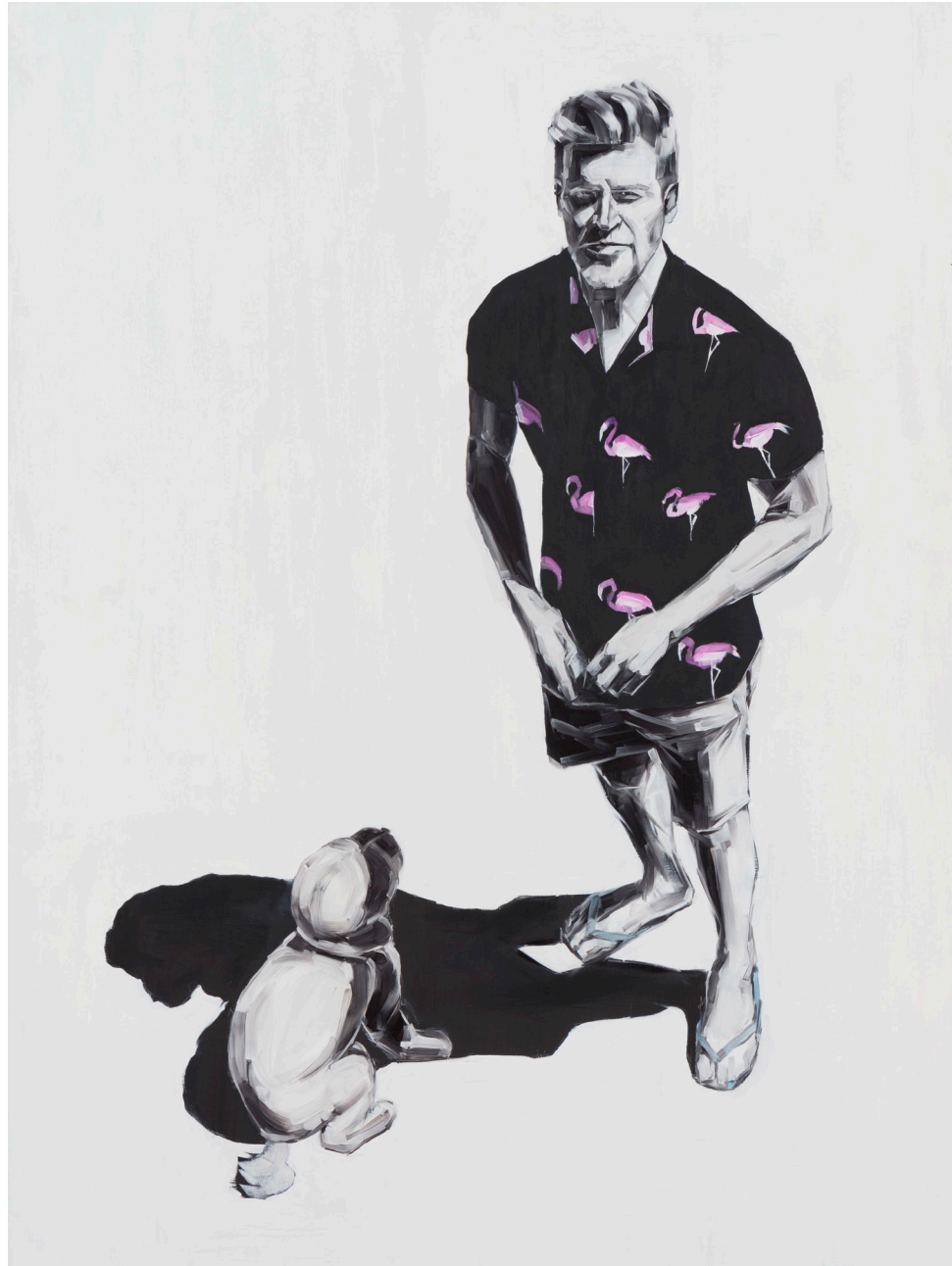
Osher & Frankie, 2020 Oil on aluminium in powder-coated steel frame, 90 x 120cm Price (inc GST): $6,800