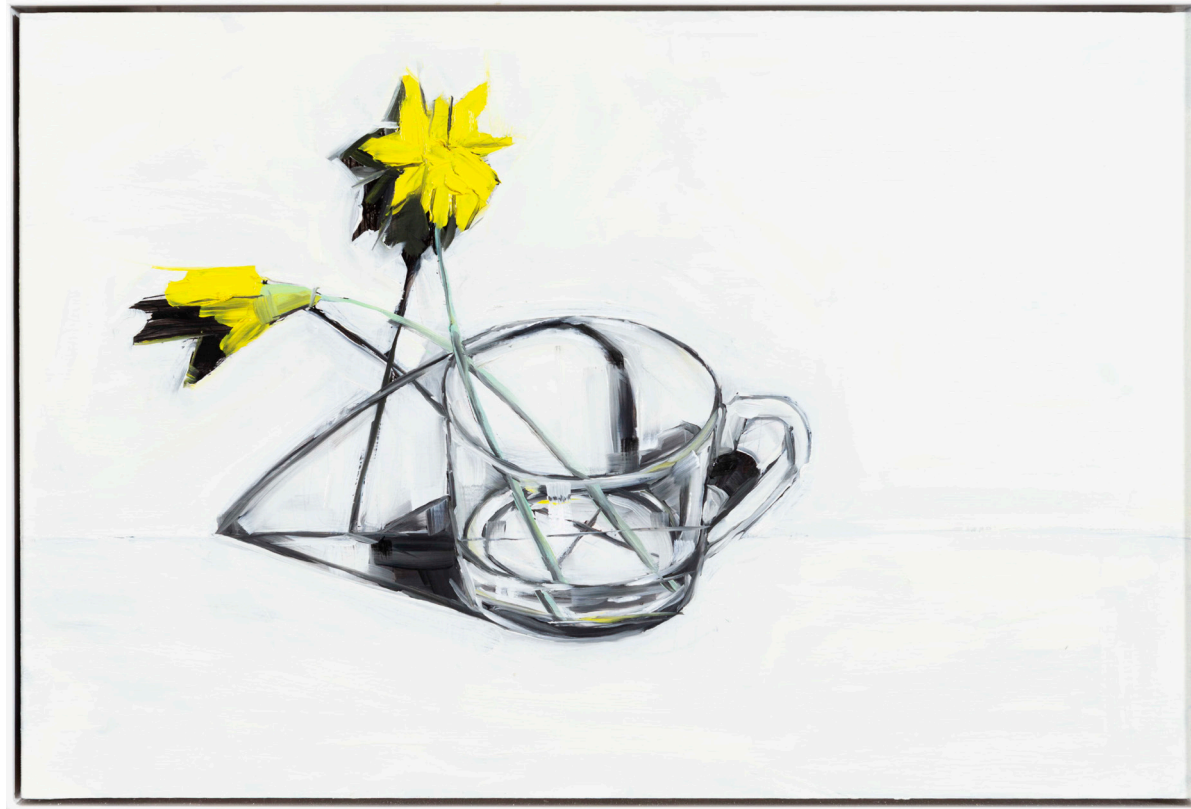
When the tide goes out, 2021 Oil on aluminium in powder-coated steel frame, 45 x 30cm Price (inc GST): $2,200