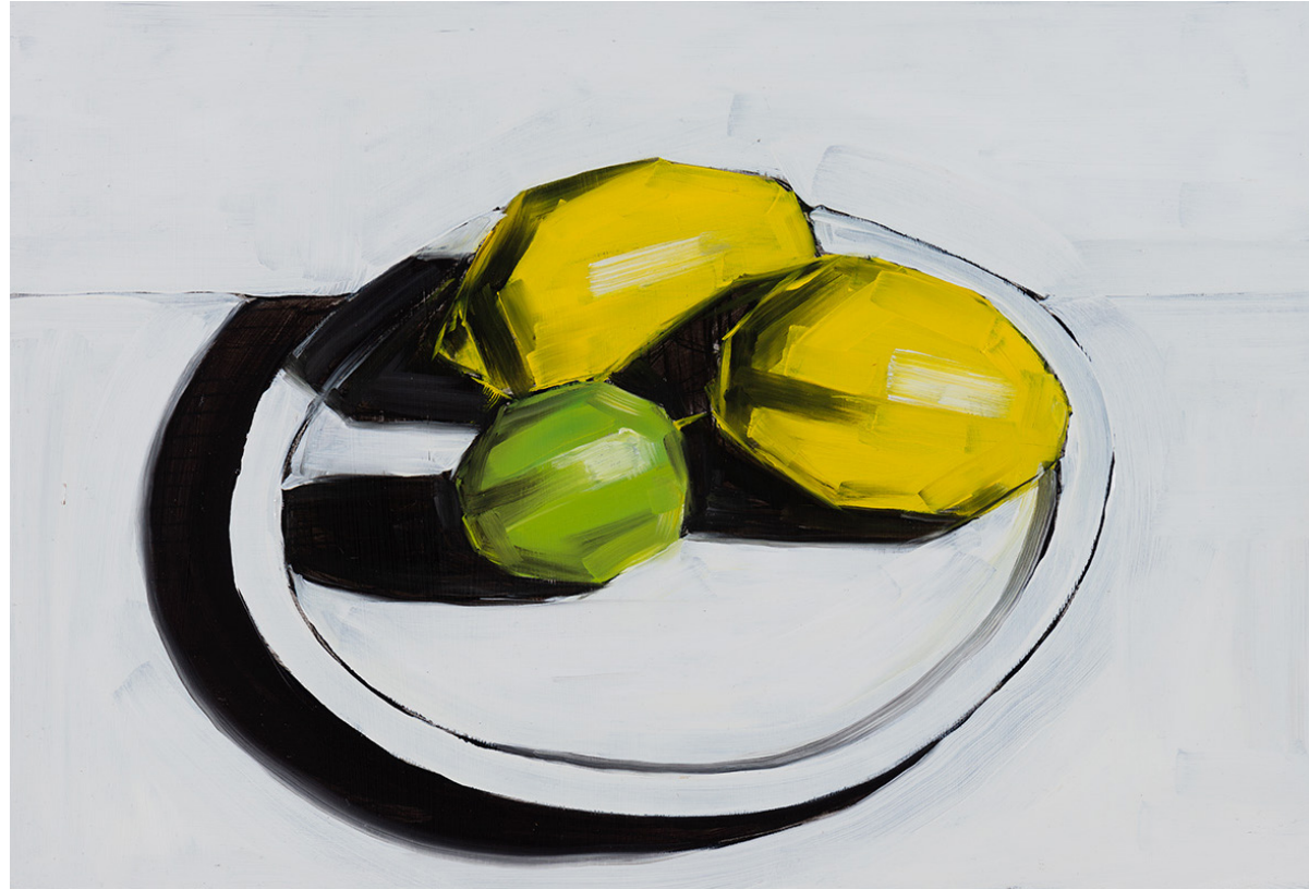
Three Wise Men, 2020 Oil on aluminium in powder-coated steel frame, 45 x 30cm Price (inc GST): $2,200