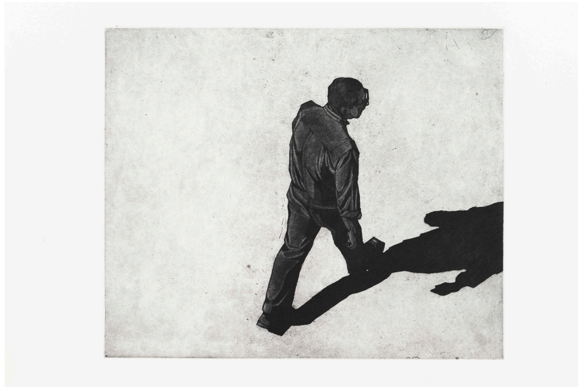
Back to work Again, 2020 Copper plate etching, aquatint on paper, 34 x 29cm (plate size), printer proof Price (inc GST): $1,400