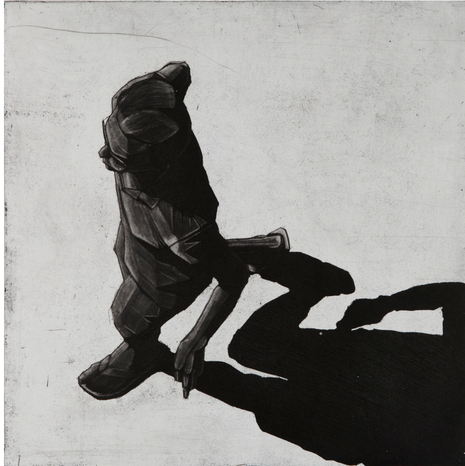
Australia Day, 2020 Copper plate etching, aquatint on paper, 50 x 50cm (plate size), printer proof Price (inc GST): $1,800