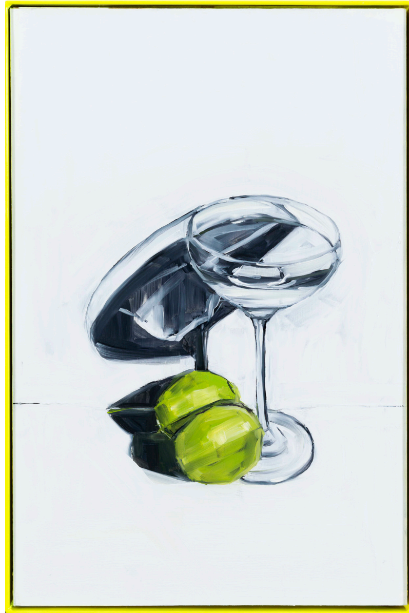
Layday, 2021 Oil on aluminium in powder-coated steel frame, 45 x 30cm Price (inc GST): $2,200