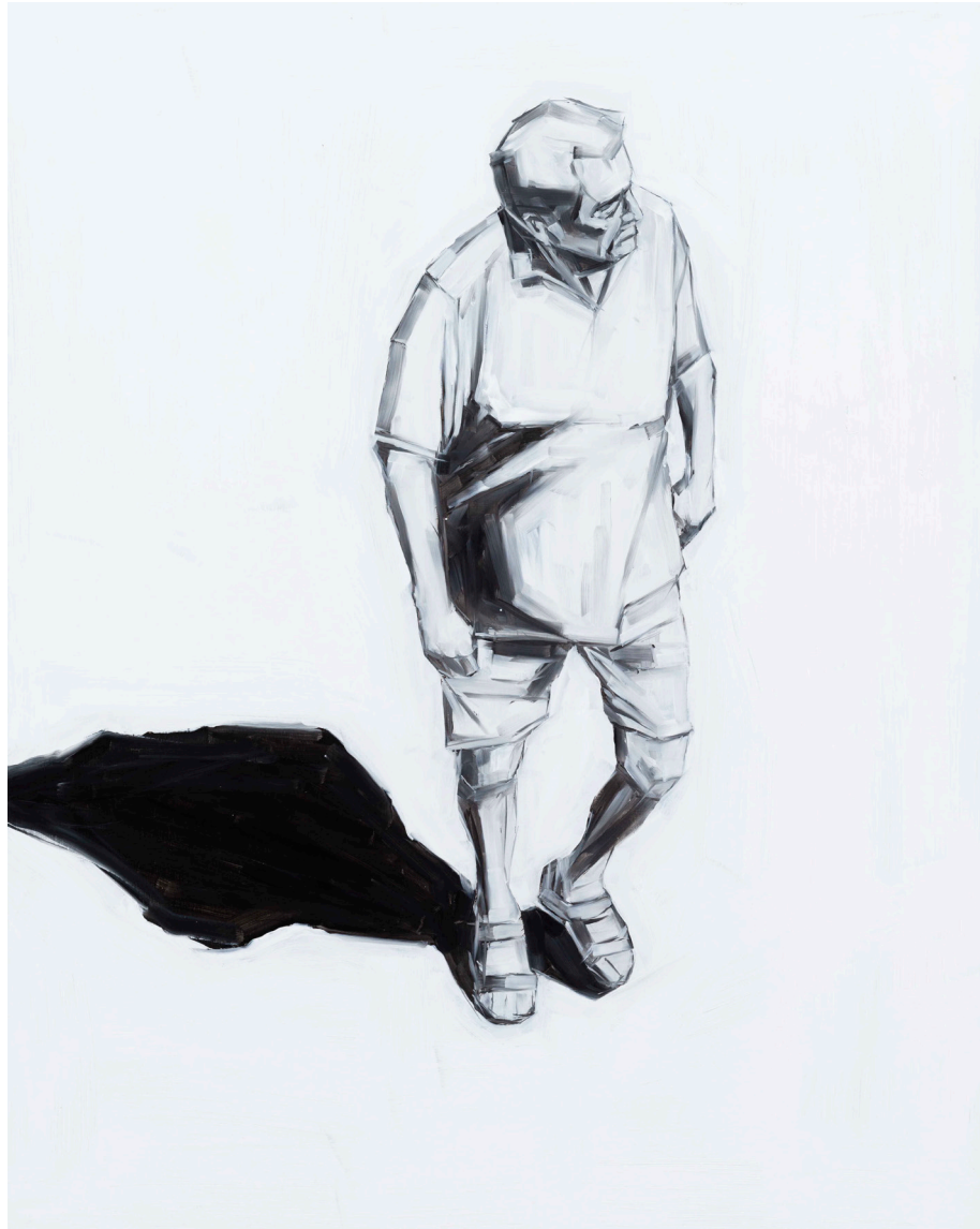
Red Stop, Green Go , 2021 Oil on aluminium in powder-coated steel frame, 60 x 75cm Price (inc GST): $3,800