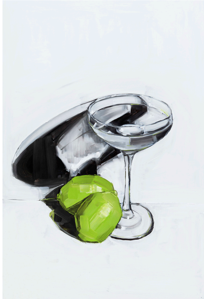
Home Game, 2020 Oil on aluminium in powder-coated steel frame, 45 x 30cm Price (inc GST): $2,200