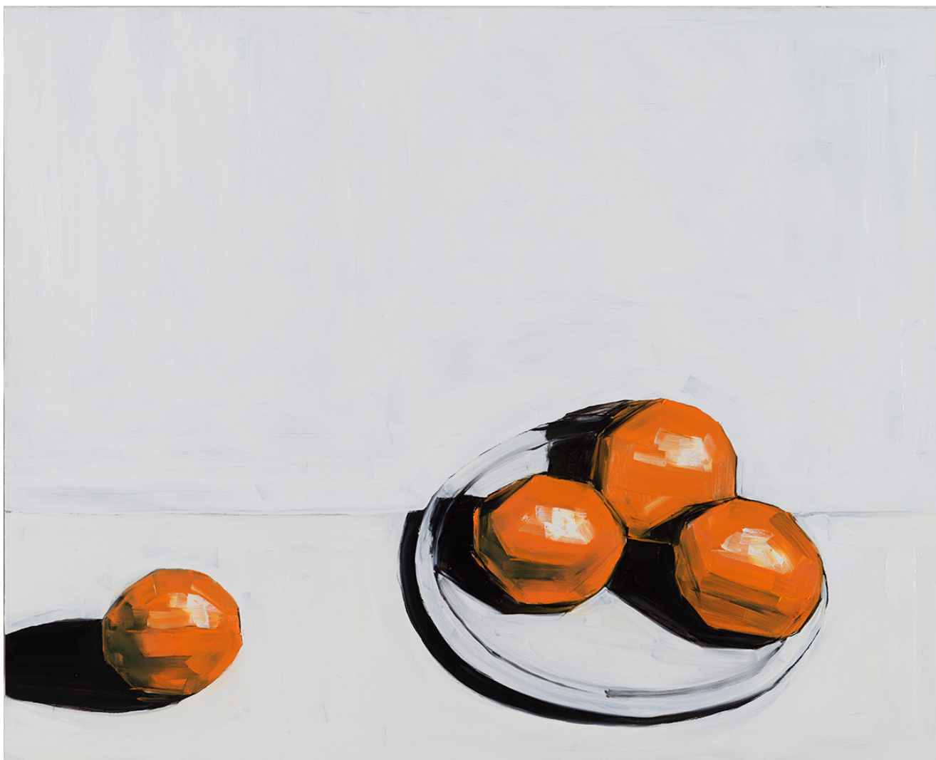
Lonely Boy, 2020 Oil on aluminium in powder-coated steel frame, 75 x 60cm Price (inc GST): $3,800