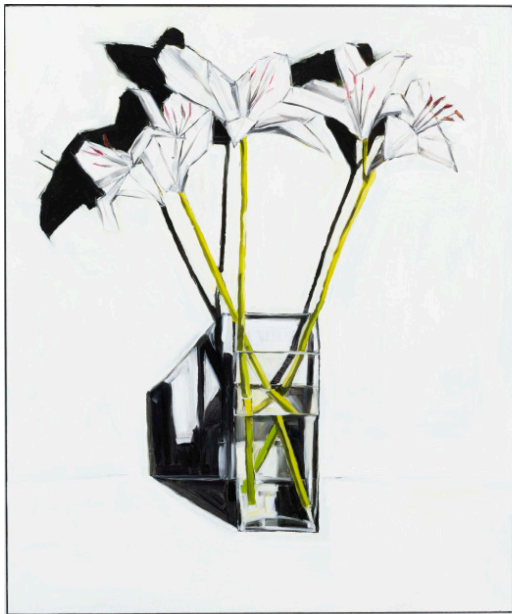
Impervious II, 2021 Oil on aluminium in powder-coated steel frame, 75 x 90cm Price (inc GST): $5,500