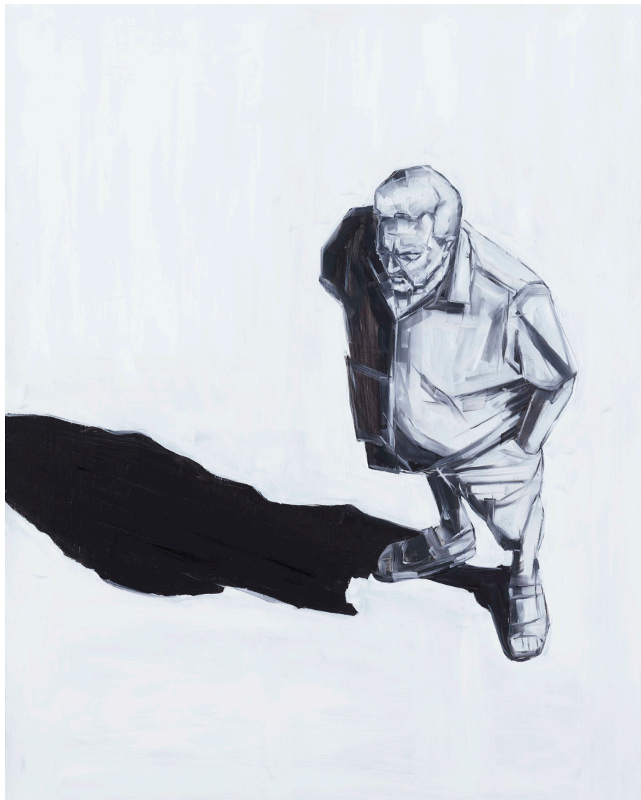
The Client II, 2021 Oil on aluminium in powder-coated steel frame, 60 x 75cm Price (inc GST): $3,800