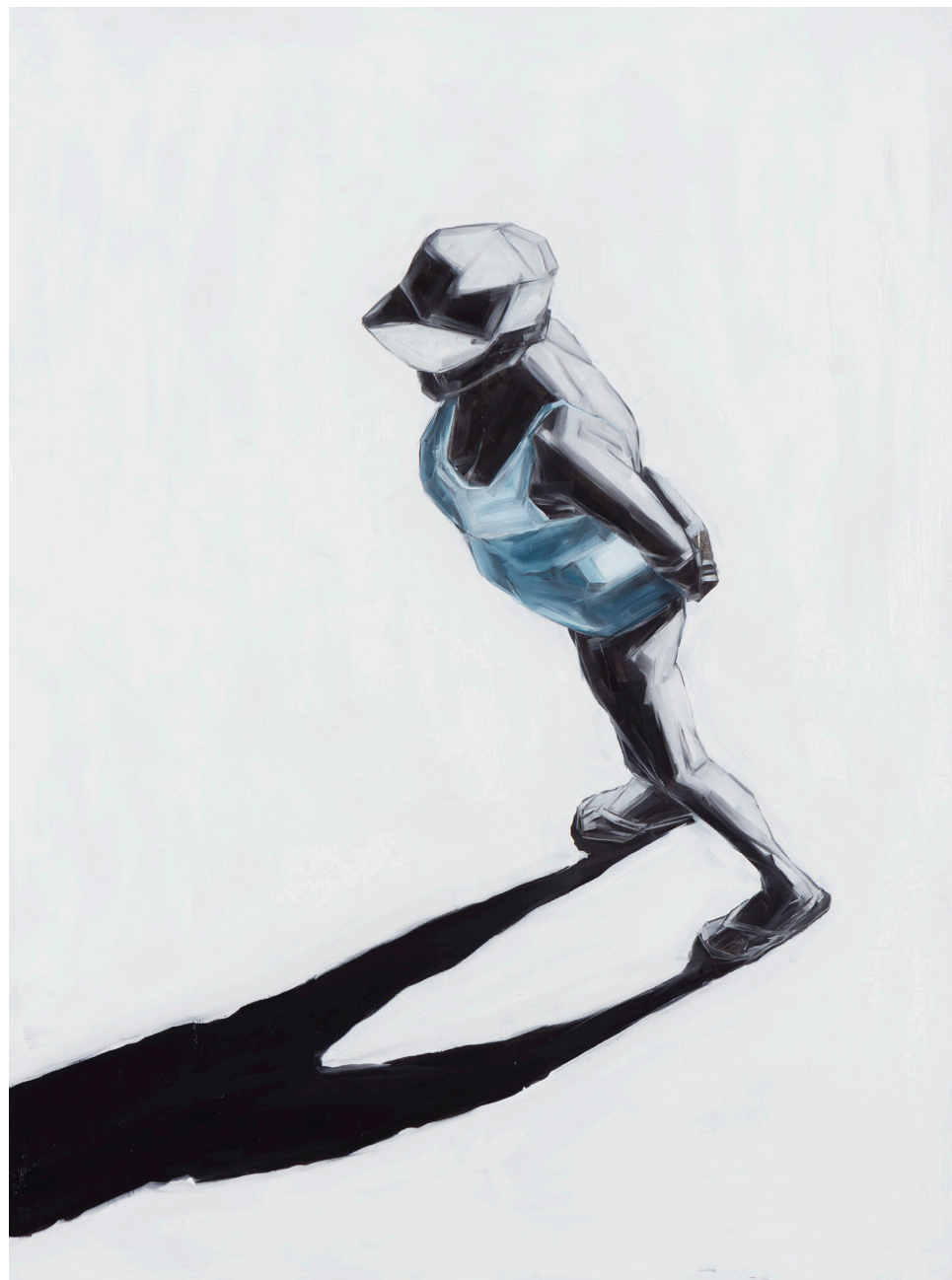
Holidays, 2019 Oil on aluminium in powder-coated steel frame, 90 x 120cm Price (inc GST): $6,800