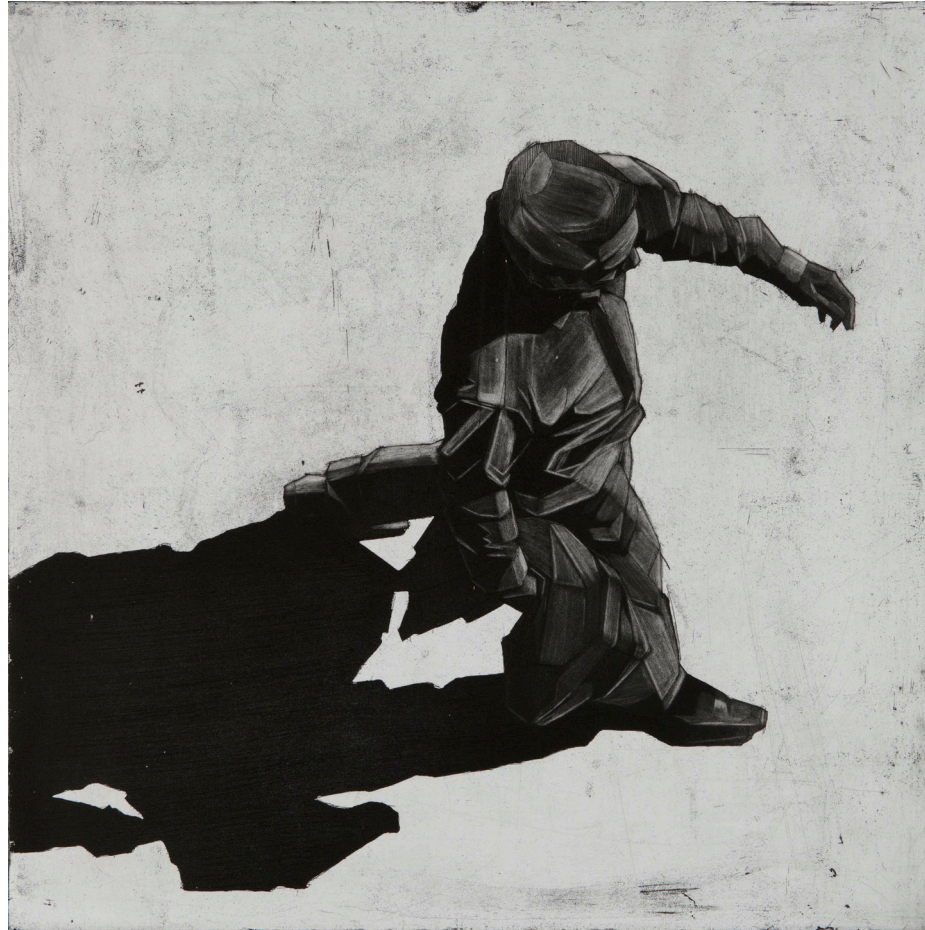
Jimmy's Going Away, 2020 Copper plate etching, aquatint on paper, 50 x 50cm (plate size), printer proof Price (inc GST): $1,800