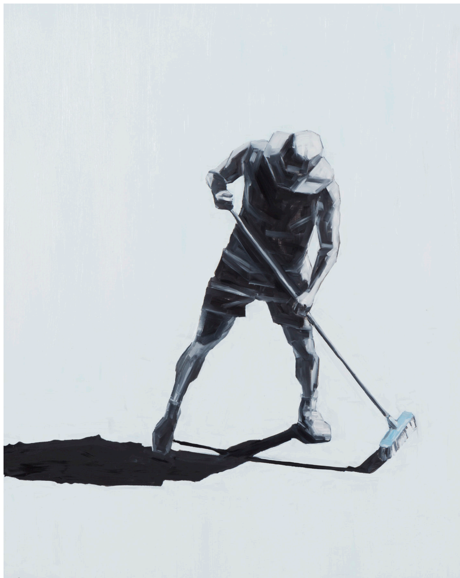
Labour Hire , 2019 Oil on aluminium in powder-coated steel frame, 60 x 75cm NFS