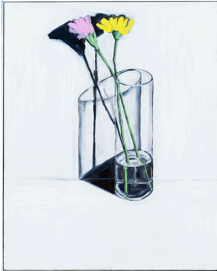
Alone Together, 2021 Oil on aluminium in powder-coated steel frame, 60 x 75cm Price (inc GST): $3,800