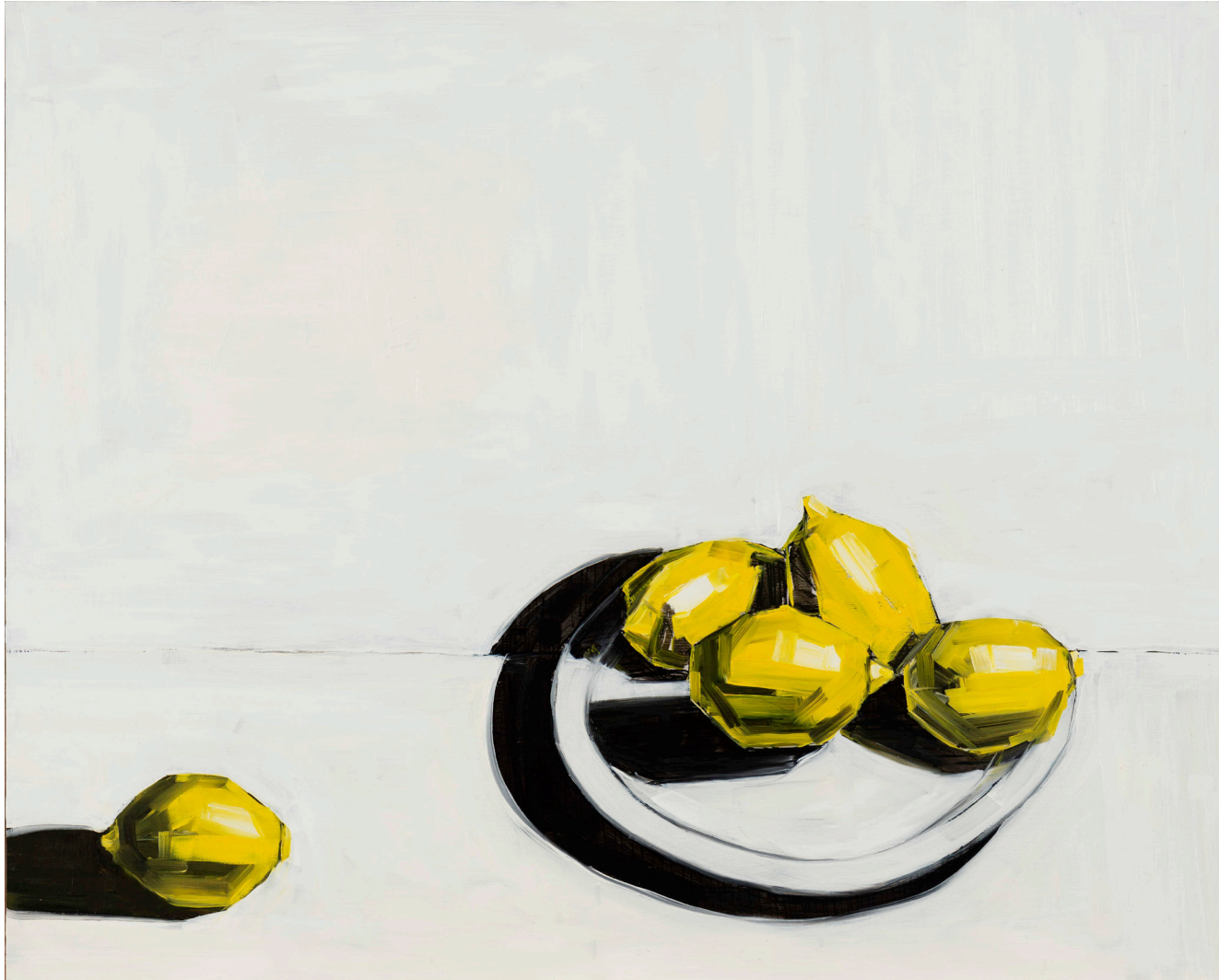
The Bottle-Up, 2020 Oil on aluminium in powder-coated steel frame, 75 x 60cm Price (inc GST): $3,800