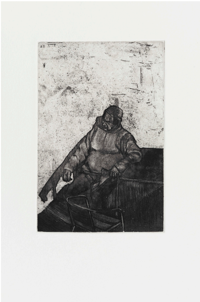
The Punter, 2020 Copper plate etching, aquatint on paper, 13 x 20cm (plate size), printer proof Price (inc GST): $1,000