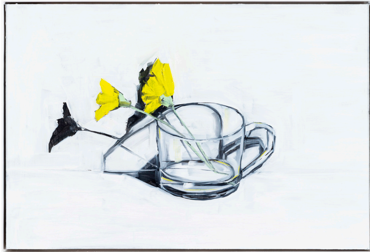
When the tide comes in, 2021 Oil on aluminium in powder-coated steel frame, 45 x 30cm Price (inc GST): $2,200