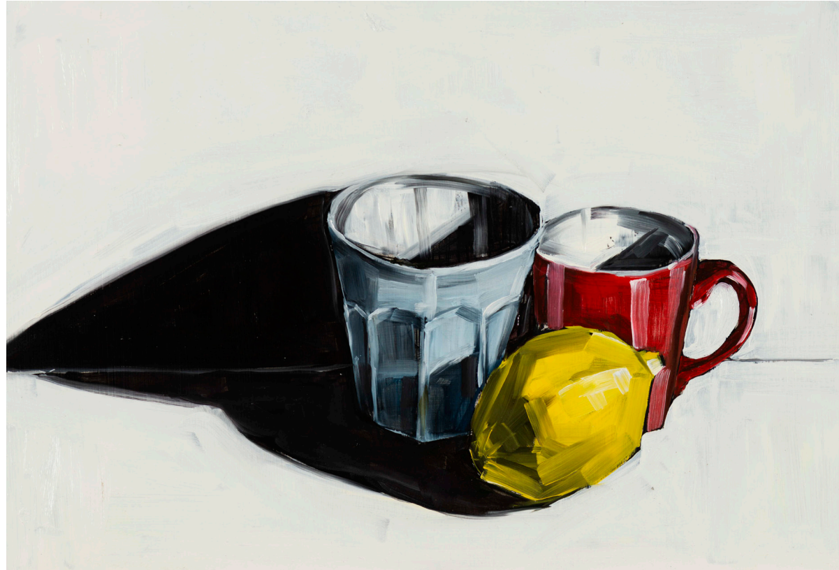
Study in Primary, 2020 Oil on aluminium in powder-coated steel frame, 45 x 30cm Price (inc GST): $2,200