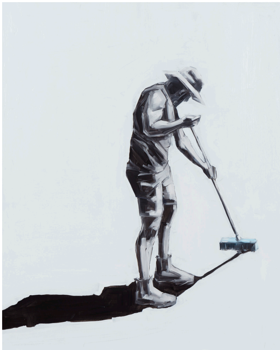
Sweeping Snow, 2021 Oil on aluminium in powder-coated steel frame, 60 x 75cm Price (inc GST): $3,800