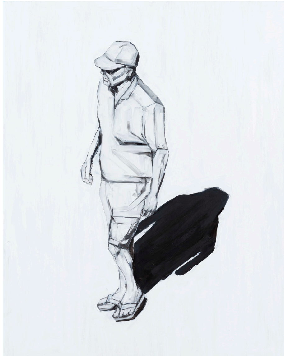
In a station of the metro, 2021 Oil on aluminium in powder-coated steel frame, 60 x 75cm Price (inc GST): $3,800