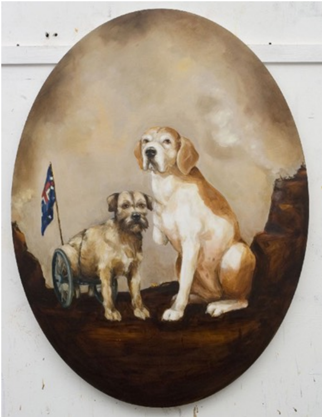
Diggers 2005 oil on canvas 160 x 119 cm $9,500