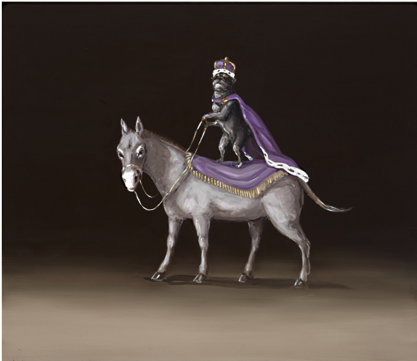
Class Act III 2015 oil on canvas 91.5 x 107 cm