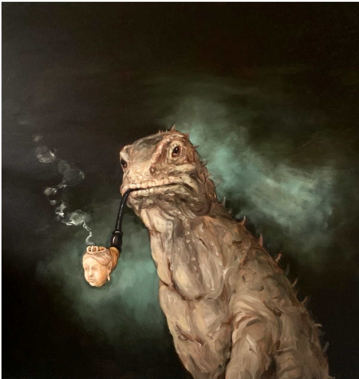
Pipe Dreams 2010 oil on canvas 111 x 111 cm