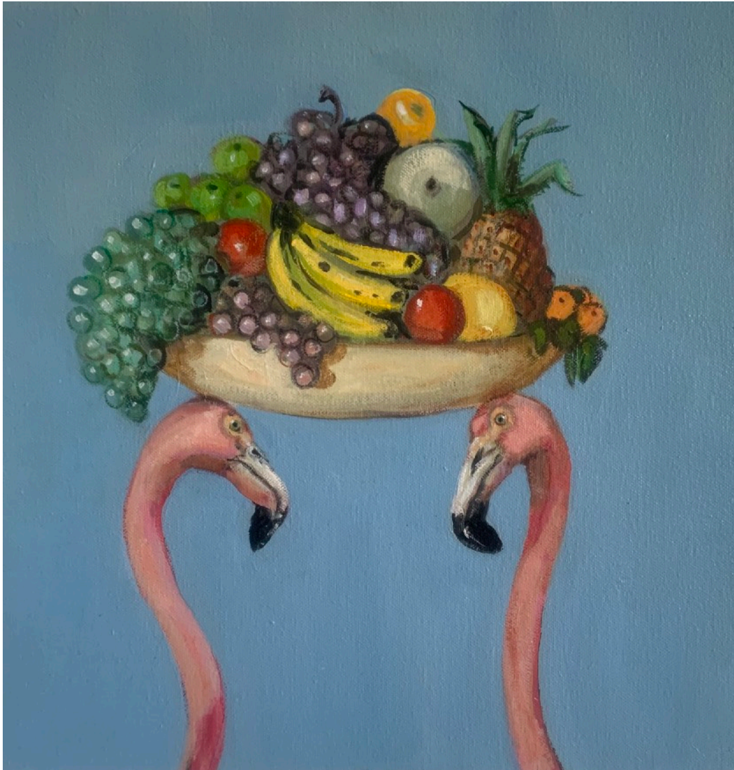
Tropical 2016 oil on canvas 30 x 30 cm