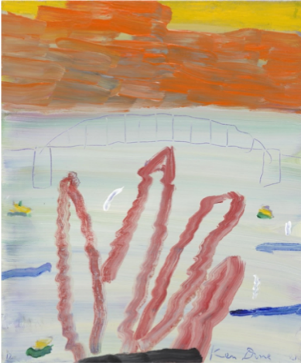
Sydney heatwave 2021 Oil and acrylic on linen 61 x 51 cm A$6,500.00