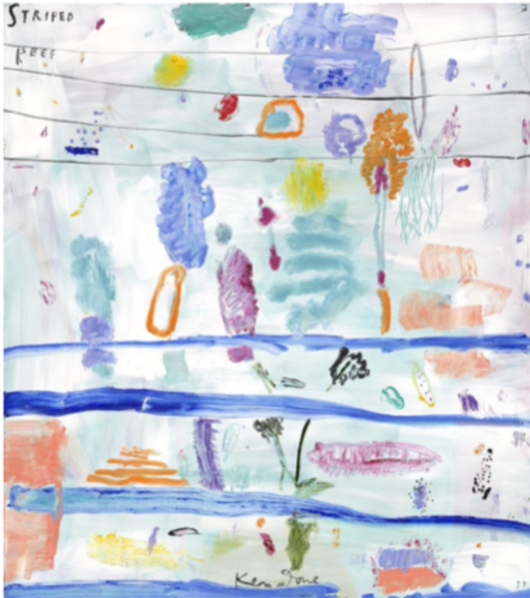
Striped reef II 2022 Oil and acrylic on linen 137.5 x 122 cm A$30,000.00