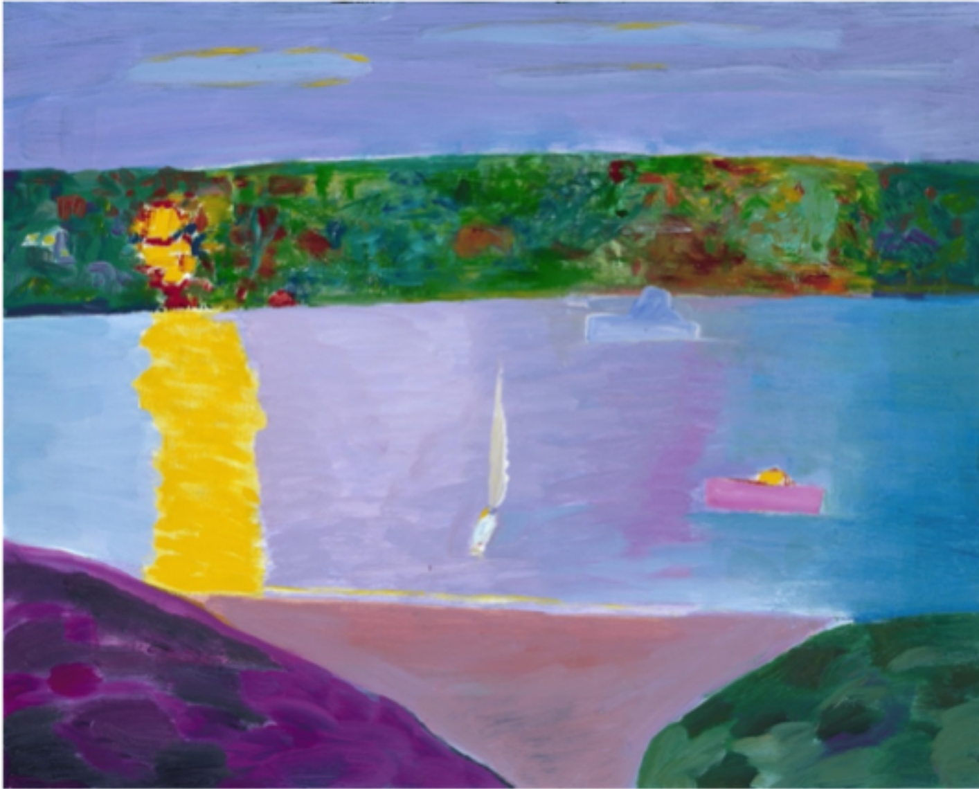
Last light 2000 Oil on canvas 60 x 75 cm A$8,000.00