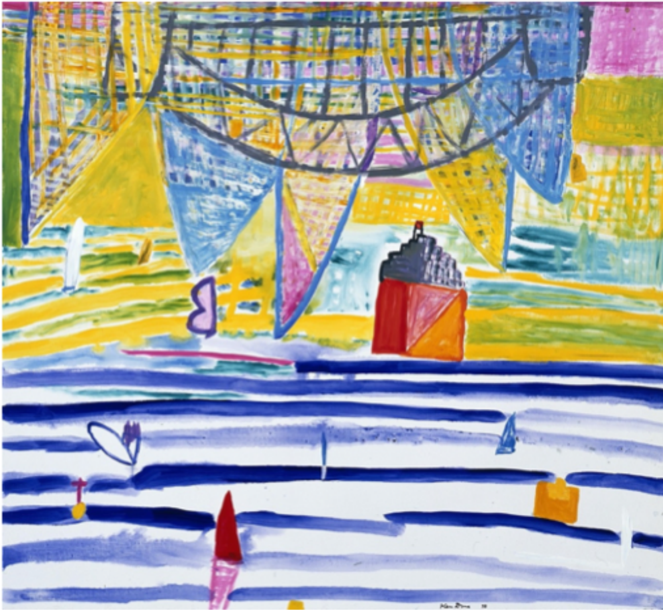
Opera House, city and harbour III 1998 Acrylic on canvas 168 x 183 cm A$45,000.00