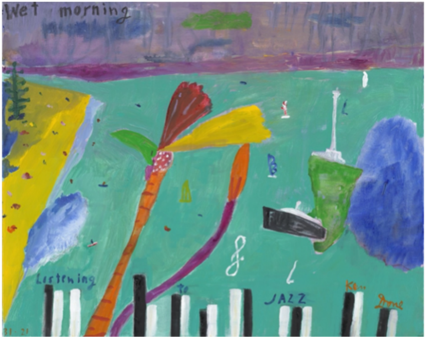
Wet morning listening to jazz

2022 Oil and acrylic on linen 82 x 102 cm A$14,000.00