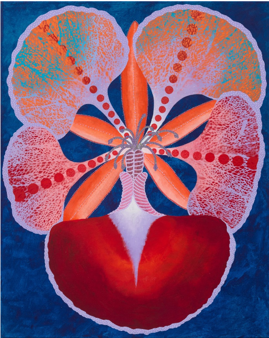
Truly 2023 acrylic on canvas 75 x 60 cm $4,800