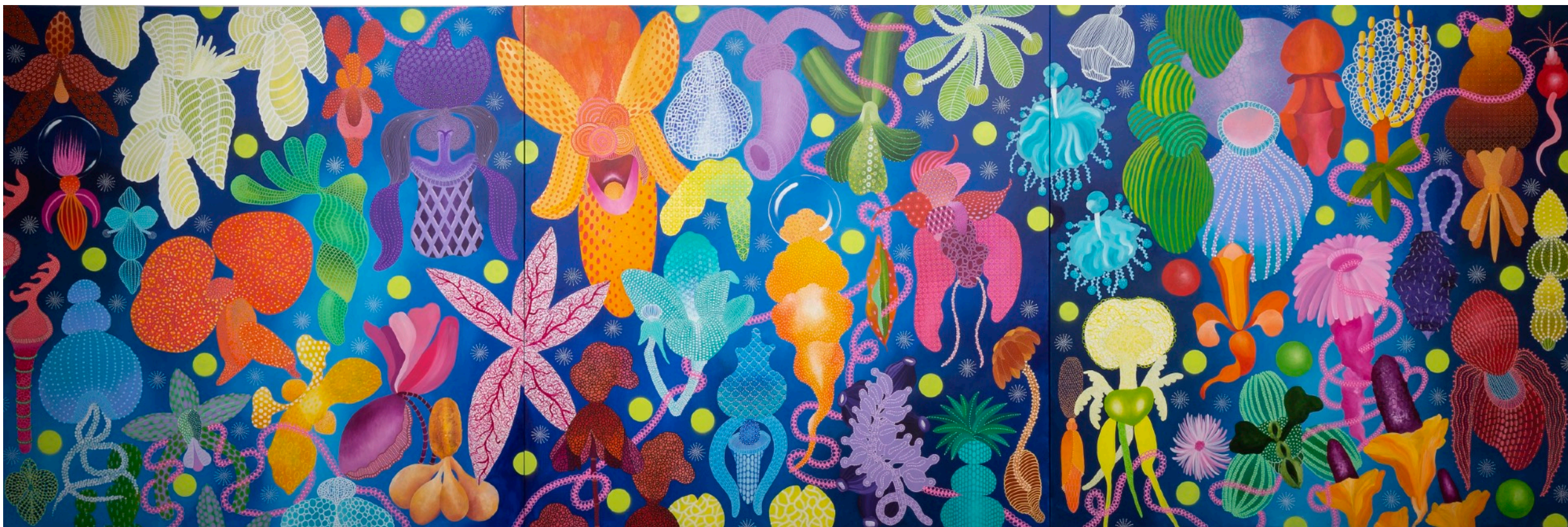
Swimming in the clouds , 2022, acrylic on canvas, 200 x 600 cm (3 panels), $60,000