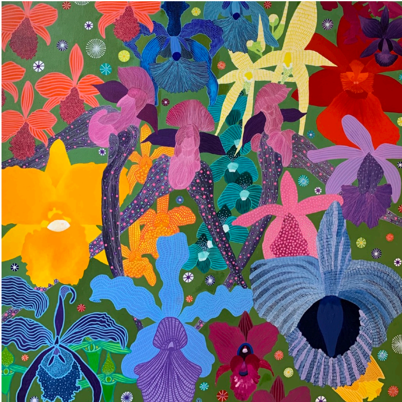
Jitterbug 2020 acrylic on canvas 120 x 120 cm NFS