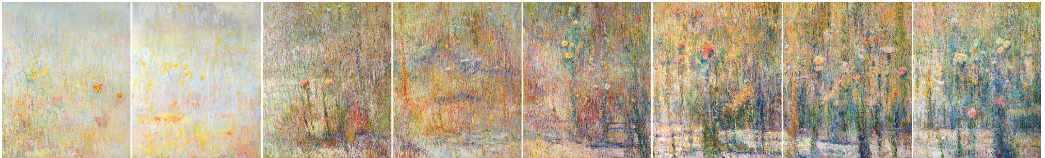
Midday light , 2021, oil and lapis lazuli on canvas, 25 panels, 152 x 3050 cm, $1,250,000