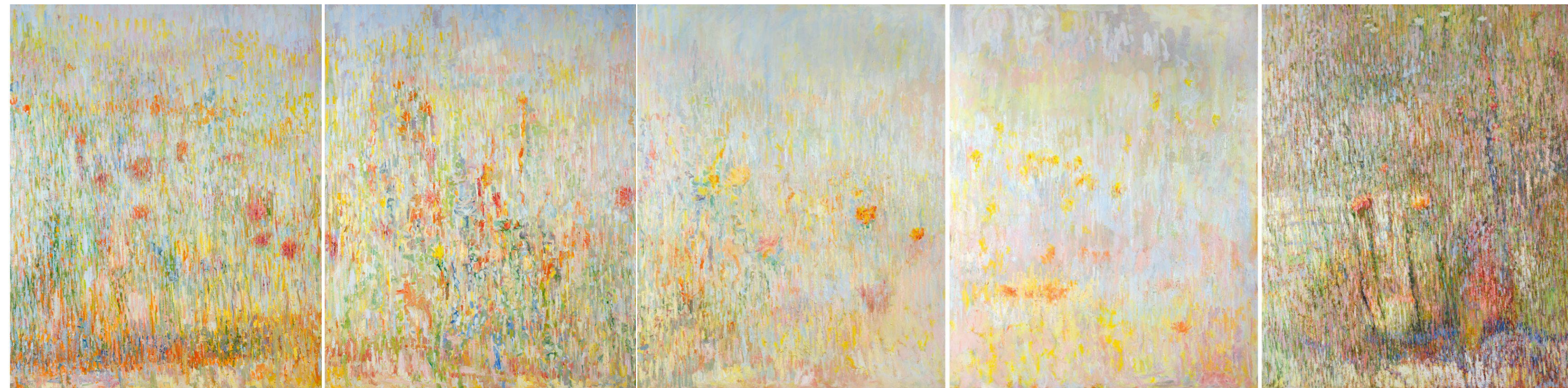
Midday light , 2021, oil and lapis lazuli on canvas, detail - panels 16-20