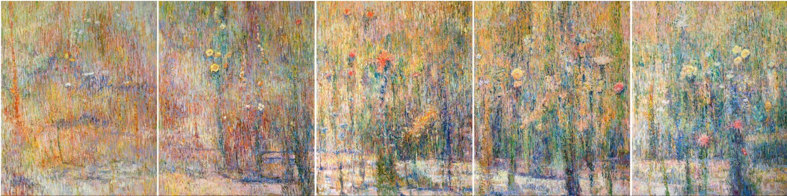
Midday light , 2021, oil and lapis lazuli on canvas, detail - panels 21-25