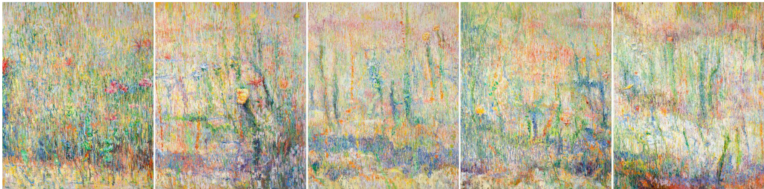
Midday light , 2021, oil and lapis lazuli on canvas, detail - panels 11-15