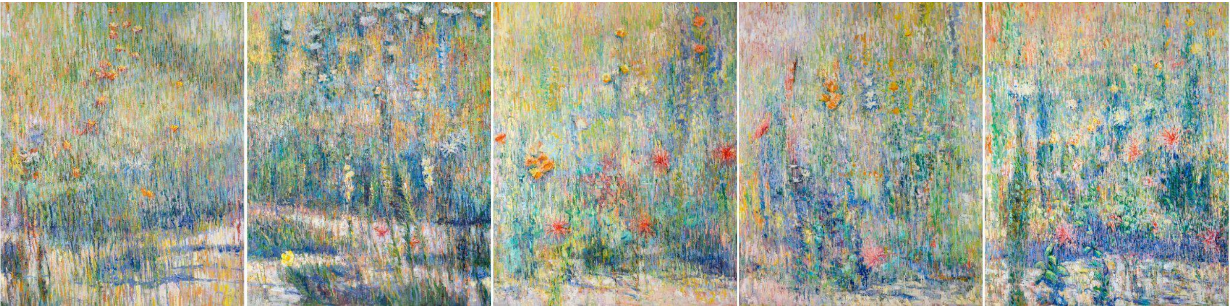
Midday light , 2021, oil and lapis lazuli on canvas, detail - panels 1-5