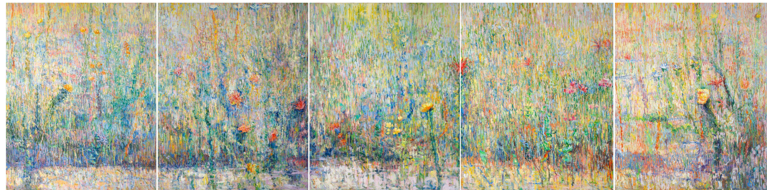
Midday light , 2021, oil and lapis lazuli on canvas, detail - panels 6-10